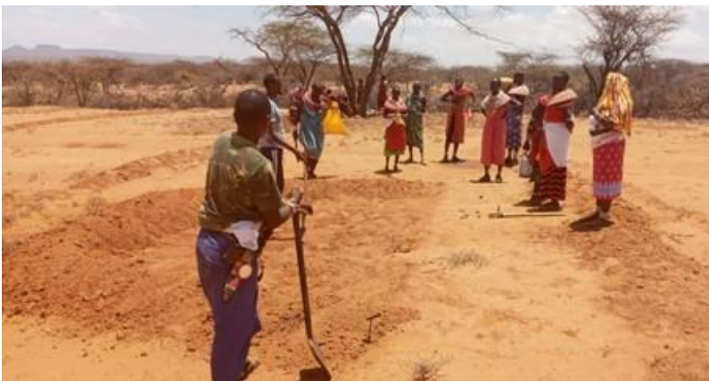
Pic. 08: Semi-circular bund team

During the drought the GZT rangelands team had to be innovative on how to build hopes for a better future, despite the daunting situation. To maintain the momentum of community engagement, they focused on voluntary land restoration through construction of semi- circular bunds, to control water runoff. A total of 12,580 bunds were constructed in Kalama, Westgate and Meibae community conservancies.