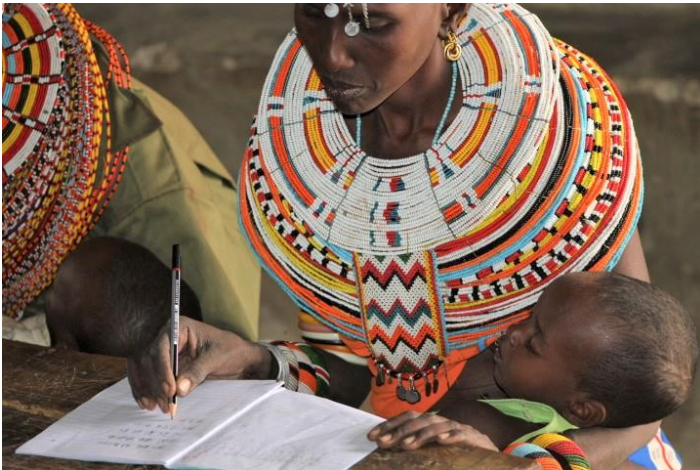
Pic. 10: lady scout during literacy class

Marwell's Field Manager also arranged for a member of a Savings and Credit Cooperative Society (SACCO) to visit the scouts in the field and discuss with them how to open accounts. Unlike standard banks, SACCOs accept people even if they do not earn above a certain threshold. They also provide extra benefits such as loans. The literacy skills and banking knowledge have provided the scouts with new independence in managing their daily lives, including the women.