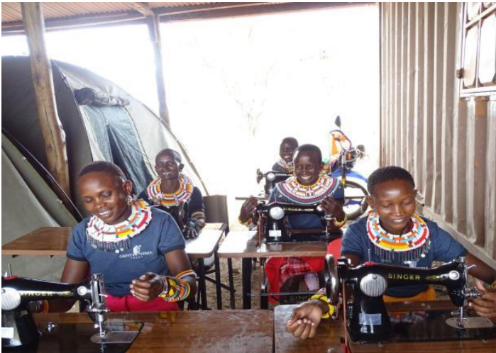
Pic.12: Women learning to sew sanitary pads

620 dignity packs were distributed to women and girls in villages; 800 dignity packs were distributed to schoolgirls from three secondary schools, and 1,969 dignity packs were distributed to schoolgirls in 20 primary schools across Wamba, Laisamis & El Barta regions.