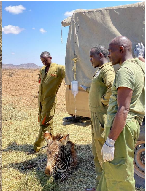
Pic. 02: Vet team aiding weakest Grevys

In a huge effort, GZT teams were able to feed an average of 500 Grevy's zebra daily for 141 days (Pic 01). Of these, 45% were lactating females and foals, 23% were non-lactating females, 8% were pregnant females, 20% were bachelor males and 4% were territorial males. They distributed 24,000 bales of hay, 600 bales of lucerne (alfalfa grass), 1,200 kgs of lucerne pellets, and 1,930 kgs of nutritional supplements. Their teams drove a total of 34,000 kms to deliver feed to Grevy's zebra herds. As a result, an average body condition score for most Grevy's zebra was maintained, thereby significantly reducing potential mortality. Marwell employed Hay Monitors from the local communities and some of their scouts at their feeding sites to monitor the Grevys, hay usage, and replenish the hay daily. Camera traps were also deployed to monitor nightly activities at the feeding sites, including other wildlife that was benefitting from the hay. Hay was purchased through GZT and delivered to the far northern region. While numbers of individuals were far lower in the north than in the GZT areas, these individuals are crucial as a potential link between the Kenyan and Ethiopian Grevy populations. At the height of the drought, Marwell was feeding 70-80 Grevy's zebra in Anderi; 40 in Lonjorin; 60 in Sivicon and 20-30 in Kargi. They also provided hay to some KWS wardens to feed the Grevys local to their stations. Overall, 2400 bales of hay were delivered.