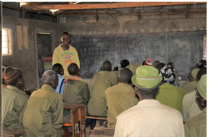
Pic.11: Scouts learning new skills

Nkirreten Project (GZT - Grevy's Zebra Scout women and their community peers have been trained to make reusable sanitary pads for women and girls in their communities).