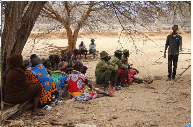
Pic.17: Marwell scout meeting

In addition to regular conservation sessions in schools, Marwell has begun to take school classes on 2-3 day field trips so that the children can experience wildlife up close, often for the first time in their life (Pics 18 & 19). Schools are chosen based on several factors: The school's academic performance, their commitment to environmental sustainability, the support and active involvement of students and school administration in our outreach work, and their role as pioneers of our programmes. The children are very much enjoying this and usually return home with much enthusiasm for conservation in their own communities. Schools are now approaching us to request trips of this nature and we try to accommodate them where possible.