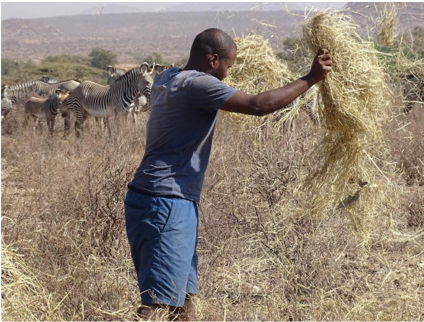
Pic.01: scouts providing hay

monitoring so that observed mortalities could be better understood, and possibly prevented where only basic veterinary interventions were required (Pic.02).