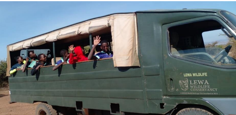
Pic.18: School during outing to Lewa Conservancy

In addition to regular conservation sessions in schools, Marwell has begun to take school classes on 2-3 day field trips so that the children can experience wildlife up close, often for the first time in their life (Pics 18 & 19). Schools are chosen based on several factors: The school's academic performance, their commitment to environmental sustainability, the support and active involvement of students and school administration in our outreach work, and their role as pioneers of our programmes. The children are very much enjoying this and usually return home with much enthusiasm for conservation in their own communities. Schools are now approaching us to request trips of this nature and we try to accommodate them where possible.