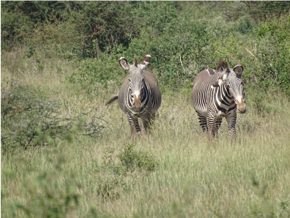
The landscape recovers. Happy Grevy's zebra at long last

MORE DETAILED REPORTS ON ALL GREVY'S ZEBRA CONSERVATION ACTIVITIES ARE AVAILABLE FROM MARWELL WILDLIFE AND GZT FROM THEIR RESPECTIVE WEBSITES OR YOU CAN CONTACT ME FOR QUESTIONS. I WILL EITHER PROVIDE INFORMATION DIRECTLY OR APPROPRIATE CONTACT DETAILS.