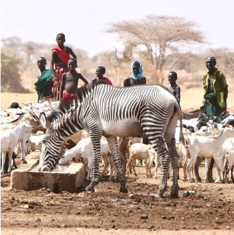
Pic.03 Grevys approaching water in daylight