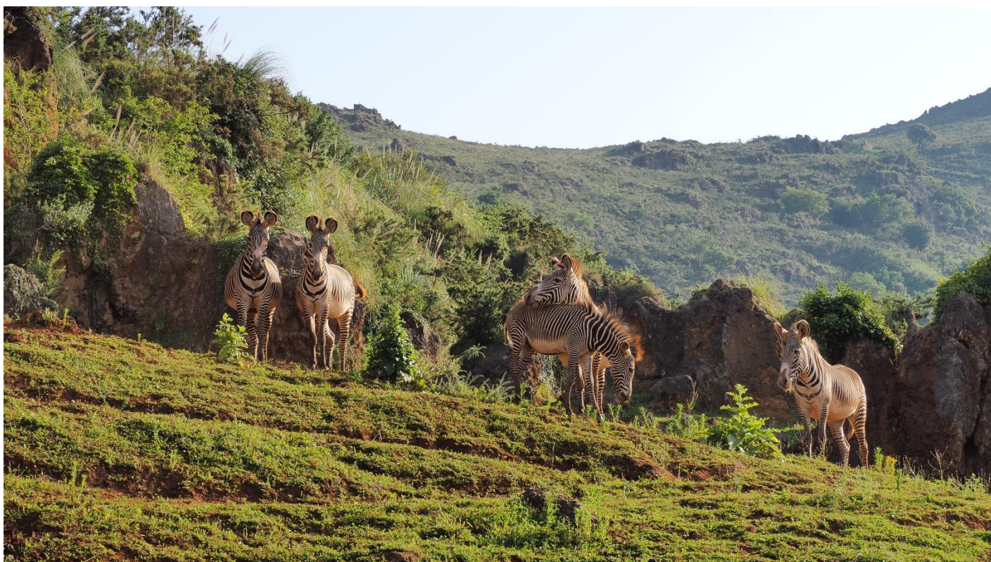
Picture 1: Grevy's zebra, PARQUE DE LA NATURALEZA DE CABÁRCENO