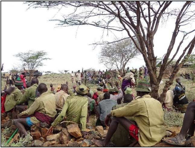
Pic.16: GZT community meeting

GZT Warriors and Ambassadors held 107 meetings reaching a total of 2,509 people (Pic 16). Marwell also held quarterly meetings with communities during which they are updated on the scout and conservation work and can bring questions and grievances to the Marwell team as well as the local KWS warden (Pic 17).