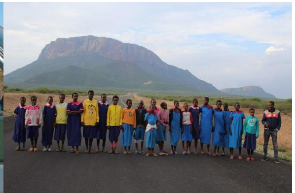
Pic.19: Lonjorin school outdoors