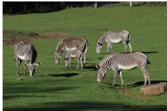
Pic. 2: Grevy's zebra, Marwell