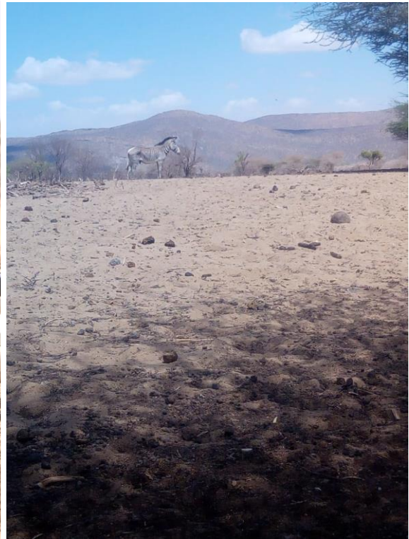
Pic.04: The drought at its worst

All these activities cost enormous amounts of money as huge quantities of hay and lucerne were needed as well as fuel, vehicles and people to move it all. Combined with the huge global increase in cost for fuel and food, the situation became unsustainable just for GZT and Marwell alone. GZT contacted Marwell Wildlife for help with an emergency call for donations from the European zoo community. The European Ex situ Programme contacted the Grevy's zebra holders. Online donation pages were set up and the zoo community rallied round and donated plenty of funds, securing the feeding efforts in Kenya and potentially helping the core population of Grevy's zebra survive these terrible times.