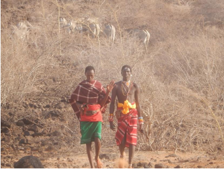
Pic.06 GZT warriors

GZT Warriors and Ambassadors carried out 1,377 foot patrols (Pic 06), walking 14,201 kms to monitor and protect Grevy's zebra. They had 370 encounters (individuals or herds) with Grevy's zebra and collected data on 1,842 sightings of Grevy's zebra. From these sightings they identified that the combined juvenile and foal breakdown as a percentage of the total population (in their area) was 24.5%.