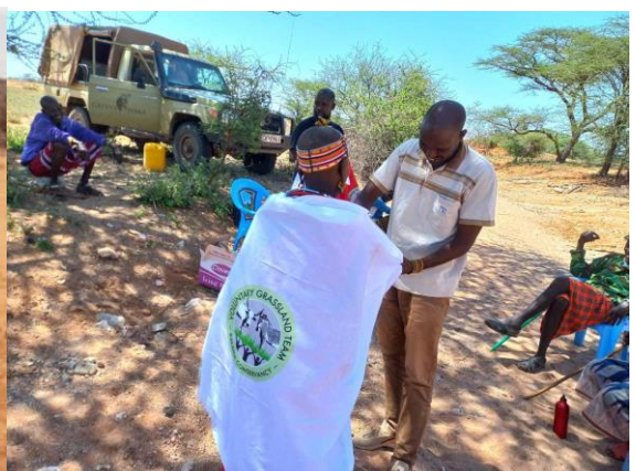
Pic.09: Grassland team