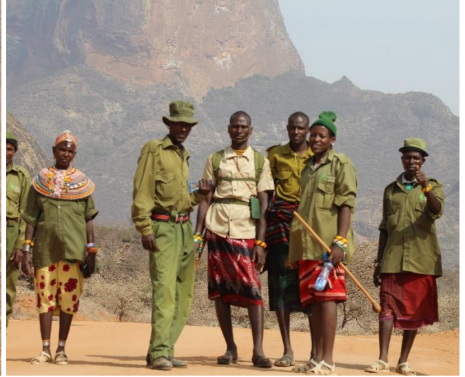
Pic.07: Marwell scouts

The whole Marwell scout team (Pic 07) had been issued with the updated technology of SMART Mobile last year and GZT will follow suit in 2023. SMART Mobile, together with SMART Connect improves on patrol efforts and data collection. It allows real-time data transfer to 'connect' scouts and rangers in the field to the home hubs that can analyse the data. This will make it possible to respond to real-time alerts and enable more effective and rapid operational responses.