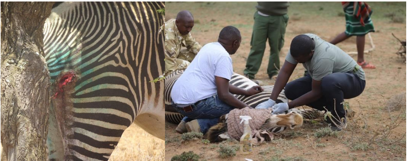
Pic.14 & 15: Poached Grevy's zebra and the KWS vet team treating it

The KWS wardens are crucial to any wildlife incidents that are reported by our scouts. They are in constant communication with the vet and our office, liaising with us on every matter and lastly providing us with security during our field trips.