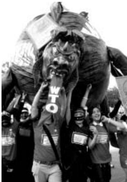
Anti-WTO protest in Hong Kong

The idea that the world's only superpower will volunteer to surrender its hegemonic status is indeed "hopelessly unrealistic" (Age of Consent, p.64).