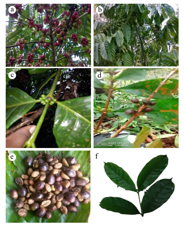
Fig. 2 (a), (b) High yielding G-98 and Unripe A-2 C. canephora . (c) Branch of C. liberica with young fruit bunches. (d) Relatively low yielding C. stenophylla branch. (e) Ripe fruits of C. stenophylla . (f) Secondary branch with leaves of C. stenophylla .

Since the 11-year interregnum full of civil strife, unrest and political instability, there has been little or no research effort on tree crops in the country. However, the Sierra Leone Agricultural Research Institute (SLARI) is geared up through its donor partners to boost the tree crop sector in terms of research and