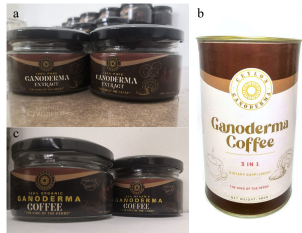
Fig. 3 Several Ganoderma products used as drugs and food supplements in Sri Lanka. (a) Ganoderma lucidum extract (Ceylon nature mushroom (PVT) Ltd). (b) G. lucidum coffee 3 in 1 (Ceylon nature mushroom (PVT) Ltd). (c) G. lucidum coffee 2 in 1 (Ceylon nature mushroom (PVT) Ltd).

To achieve the growing economic potential of the Ganoderma industry in Sri Lanka, many obstacles must first be overcome. Misidentifying taxa in Ganoderma and duplicated entries across different studies will lead to confusion in biotechnology; hence, the systematics and taxonomy of Ganoderma species need to be studied and resolved. Distribution and the gene flow of Ganoderma species in Sri Lanka are significant, thus molecular characterization of Ganoderma sp.