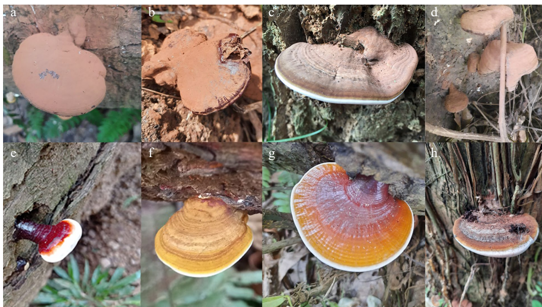
Fig. 1 Different Ganoderma species found in Sri Lanka.