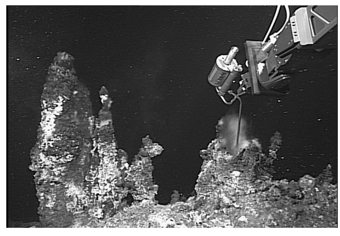
Figure 2. One of several vigorous chimneys venting clear fluids.

available in the original cruise. We measured temperatures at several vigorous chimneys emitting clear fluids of up to 304°C and collected vent water samples using both major an gas-tight bottles (Figure 2). The fluids have lowerthan-seawater salinities and low metal and