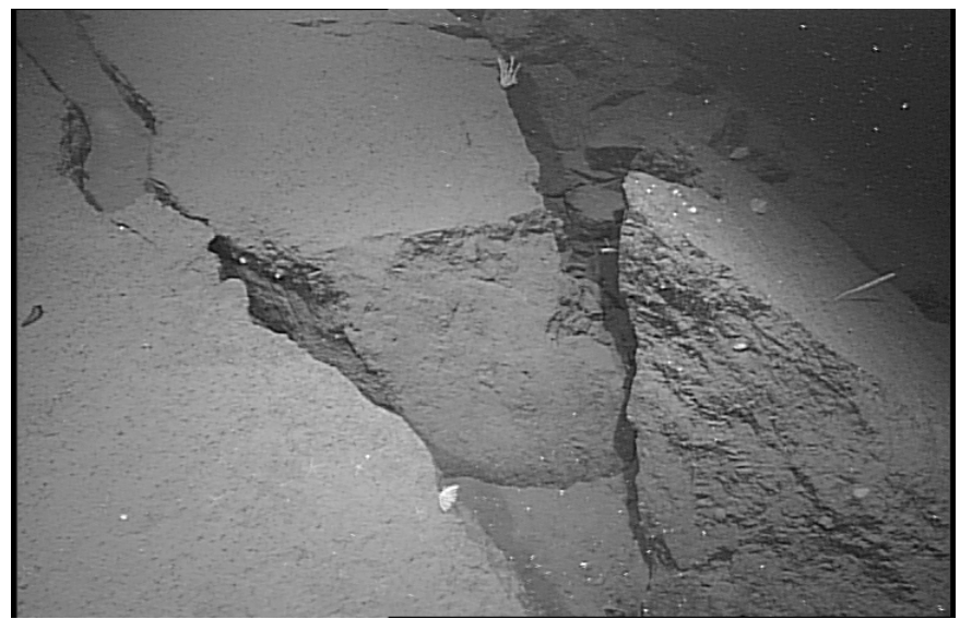
Figure 3. The planar fault surfaces of the greenstone blocks.

We conducted two dives (T185 and T187 on Figure 1) and collected 18 wax-tipped rock cores along the axis of the ridge near the Narrowgate region, just south of the region studied by Davis and Clague (1990). The first (northern most) dive was aborted after only a short time on the bottom due to technical problems with the vehicle and the second searched for the proposed southern lava flow from the 1996 eruption (Chadwick et al., 1998). This southern dive also explored and sampled one of the larger of the flat-topped volcanic cones in the axis of the Gorda Ridge. No young glassy flows or active or inactive hydrothermal fields were observed. The proposed southern lava flow for the 1996 eruption