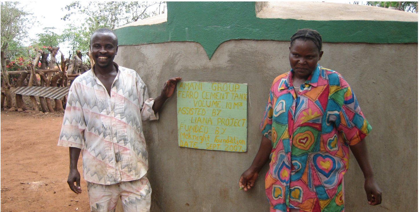
Moshi, Tanzania/February 11, 2008

the [grantee] program directors and their aspirations.” She continued, “I witnessed how McKnight’s money could make a difference not just programmatically but institutionally – technical assistance, capacity building, program evaluations – creating an infrastructure that didn’t [previously] exist.”