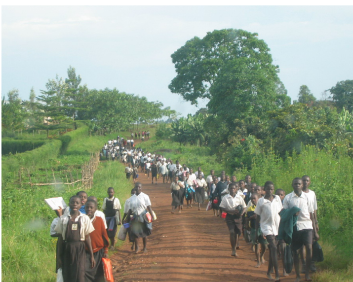
Fort Portal Area, Uganda/November 9-11, 2005