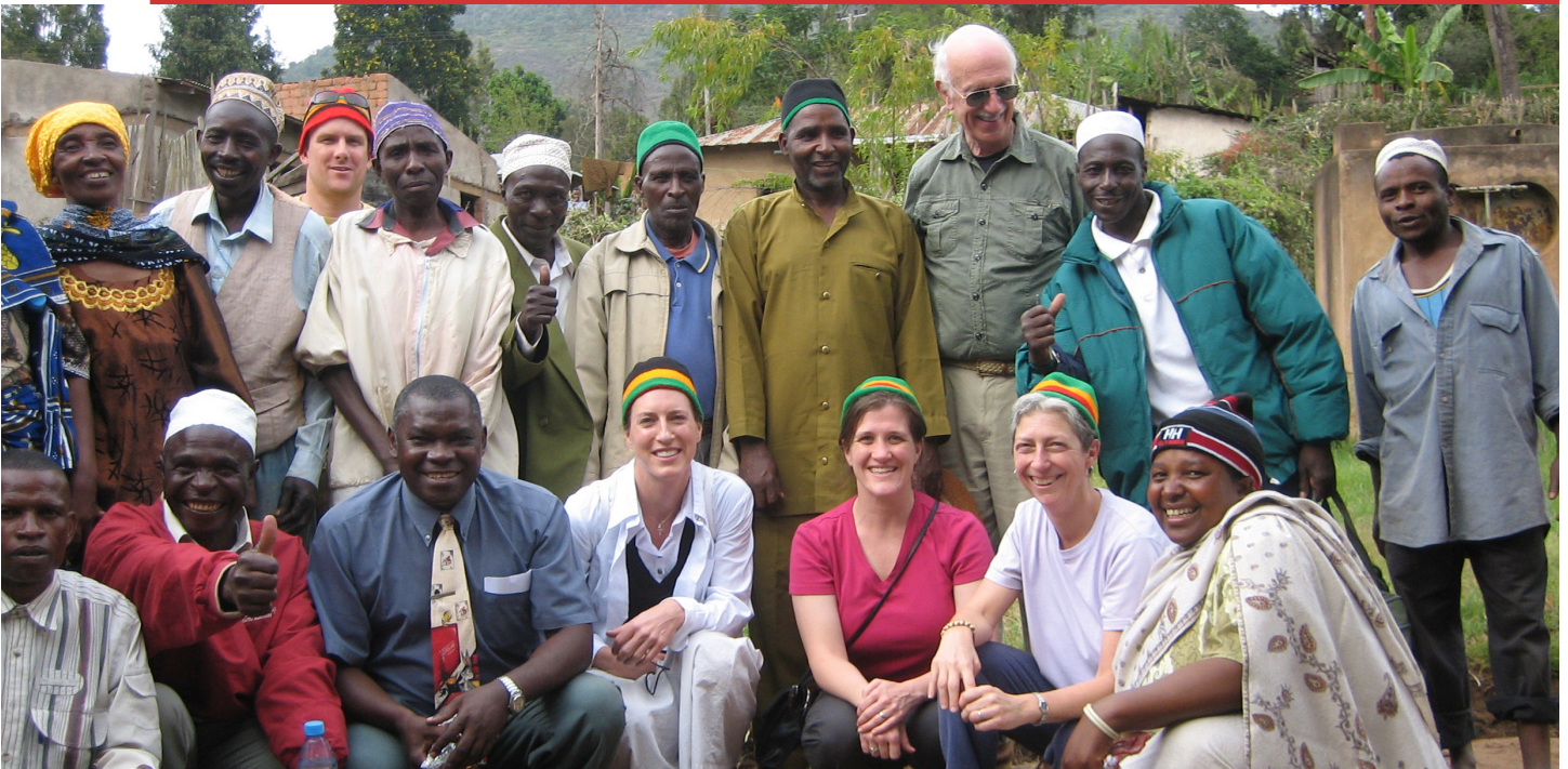
Lushoto, Tanzania/February 9, 2008

The report that follows is intended to serve as part of the "institutional memory" of The McKnight Foundation's East Africa Women's Economic Empowerment program. Its heavy reliance on individual recollections may detract from its precision, but such reflections provide a vivid and inspiring understanding of the Foundation's compassion, commitment, and impact on the people and communities of Tanzania, Uganda, and Zimbabwe.