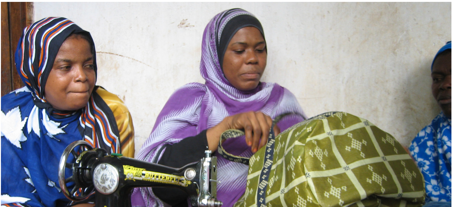
Dar es Salaam, Tanzania/February 7, 2008