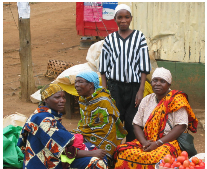
Lushoto, Tanzania/November 4, 2005

With Howard’s help, a board trip was planned focusing on relatively stable countries poised for growth and economic development. South Africa was ruled out, seen as too far along to have significant impact with a small investment, but a number of possibilities remained. Eventually, there