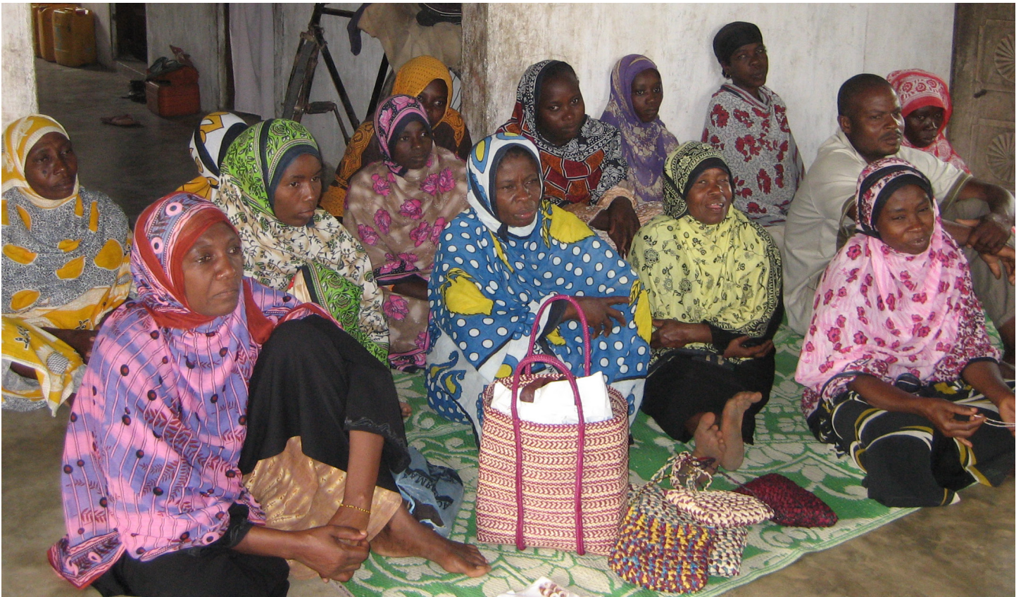
Dar es Salaam, Tanzania/February 7, 2008