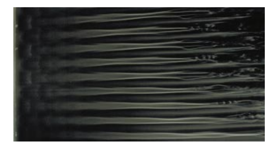
Figure 2: A flow visualization photograph showing oblique transition in a flat plate boundary layer flow. The free stream velocity is 8.4 m/s and the flow is from left to right. The picture is approximately 220 mm wide and 420 mm long. The left hand side is 240 mm from the plate leading edge (flow visualization by Elofsson).