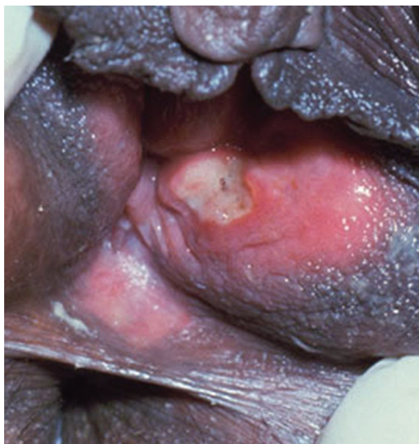
Figure 3. Chancroid ulcers are usually nonindurated with serpiginous borders and friable base, often covered with purulent exudate.

infections or lymphatic obstruction, which may progress to genital elephantiasis. 10 In persons who have receptive anal intercourse, lymphogranuloma venereum may result in tenesmus; constipation; rectal bleeding; pain or