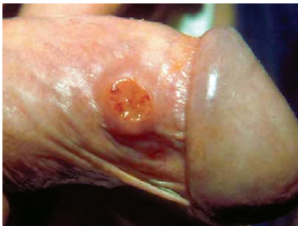
Figure 4. Genital ulcer with hypertrophic borders, caused by donovanosis.