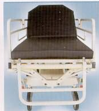
Head/foot push rail Interchangeable between head and foot ends for ease of transport. Conveniently lowers to a stored position completely below the litter.