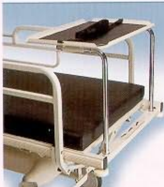
Monitor/Instrument tray Simple to install or remove. Measures 15 \frac{3}{4} " x 22 \frac{3}{4} ". Folds for compact storage.