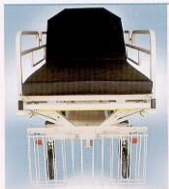
Storage basket Mounts at either head or foot end. Large capacity. Convenient access.