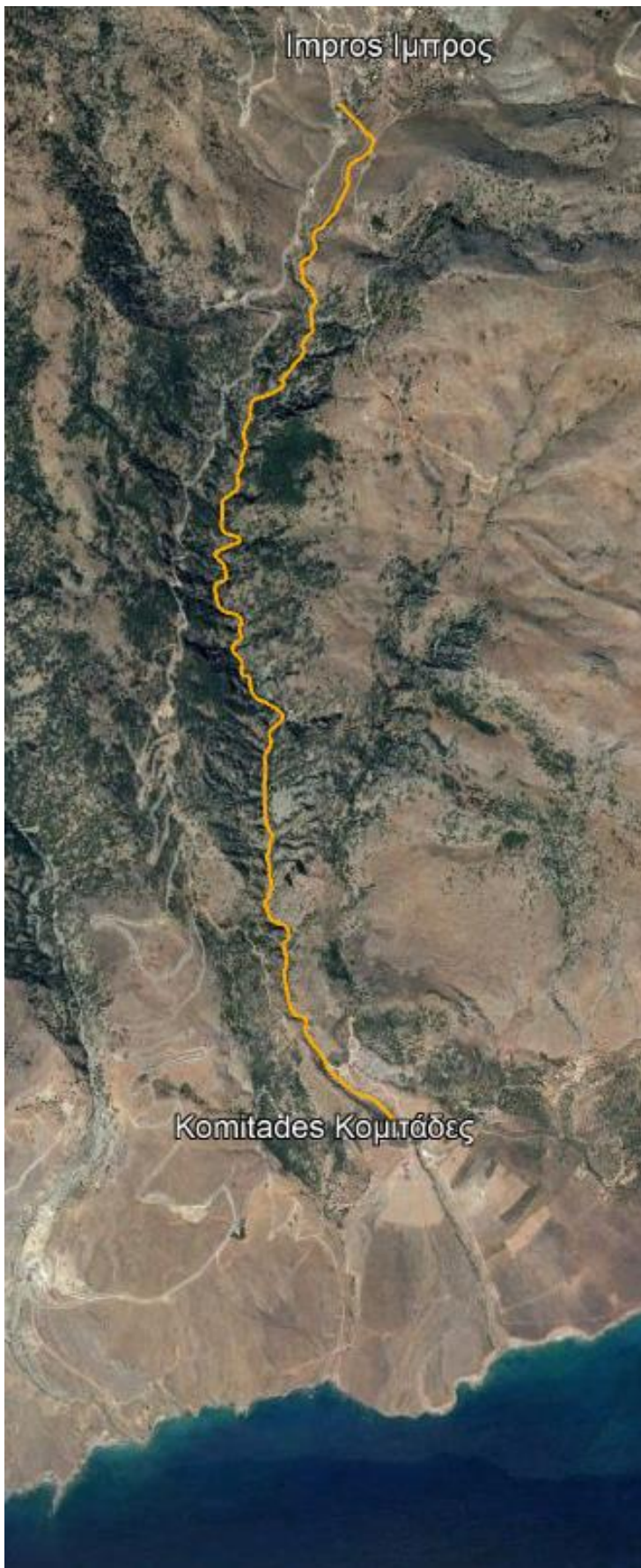
Trekking route of Imbros gorge (Google map)