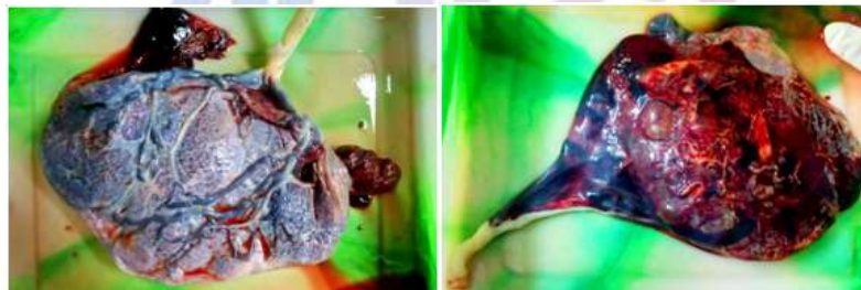
Figure 1: Furcated placenta Figure 2: Velamentous insertion of umbilical cor

Changes in the development and site of insertion of umbilical cord can cause problems which have the potential to affect the maternal and fetal growth and development [11-13]. Diameter of cord, various placental shapes and mode of insertion of umbilical cord of natural conception and assisted reproduction were noted and tabulated. Furcated placenta was noted in 2 cases of assisted reproduction (fig 1).