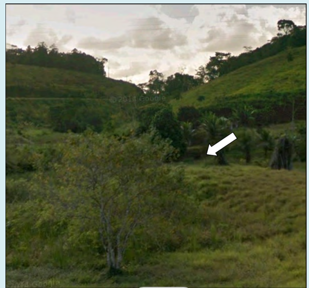
Figure 2: Type locality of Astyanax pardensis sp. n. Salgado, 2021. Panelinha river, tributary of the Panelão river, Pardo river drainage, Camacan, Bahia, Brazil, 15°22'24"S 39°29'59"W (arrow).