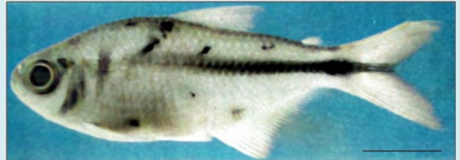
Figure 1: MNRJ 22928, Astyanax pardensis sp. n. Salgado, 2021, 51.3 mm SL, holotype, male, Panelinha river, tributary of the Panelão river, Pardo river basin, Camacan, Bahia, Brazil, 15°22'24"S 39°29'59"W. Bar = 10 mm.

W, PA Backup, AT Aranda, FAG Melo, FP Silva, RS Lima, GR Moyer, Aug. 21, 2001. MNRJ22928 (12 specimens, 23.1-55.2 mm SL), Panelinha river, tributary of Panelão river, Pardo river drainage, Camacan, Bahia, Brazil, 15°22'24"S 39°29'59"W, PA Backup, AT Aranda, FAG Melo, FP Silva, RS Lima, GR Moyer, 22 Aug. 2001.