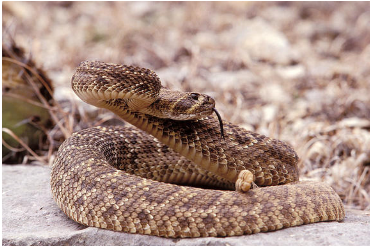
Diamondback Rattlesnake