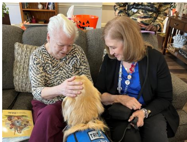
Mustang Creek Assisted Living in Frisco-October 17