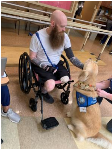
Encompass Rehab-October 13