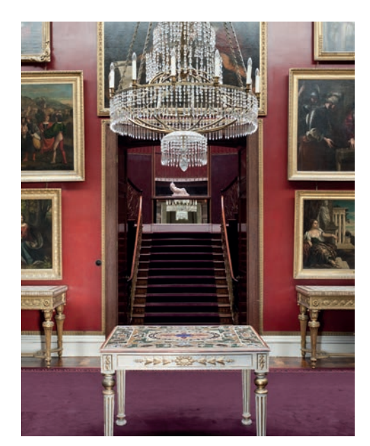
The Picture Gallery at Attingham Park, Shropshire, with a view through the doors to the Staircase.