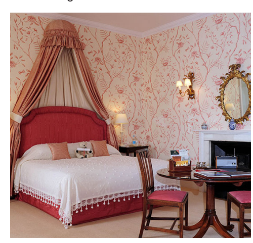
The Orangery (left) and Brewood bedroom (right), Weston Park