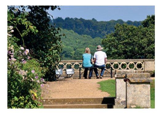
Basildon Park, photo by Gabriella Szekely