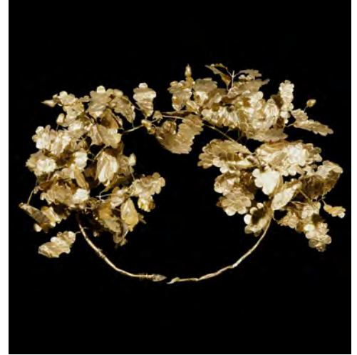
Gold oak wreath with a bee and two cicadas, East Greek, Hellenistic, 350BC-300BC, collection of the British Museum, London

Visit the V&A, and, in the company of a specialist curator, discover the most comprehensive collections of jewelry anywhere in the world—3,000 jewels dating from the ancient to the modern. Admire diamonds once owned by Catherine the Great and jeweled pendants that Queen Elizabeth I gave to her courtiers. Marvel at the famous Beauharnais Emeralds, a gift from Napoleon to his adopted daughter. View splendid jewelry by the French Art Nouveau designer René Lalique as well as confections from Cartier and Tiffany. Enjoy lunch at leisure. Head to the Goldsmiths' Centre, a school for silversmiths and jewelers, and view the students at work fashioning marvels from silver, gold, and jewels. Gather this evening for dinner. B, D