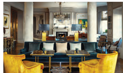
The Kensington Hotel, London

As you are welcomed through the double-framed doors by a bowler-hatted doorman, step back in time to a more genteel age at this stately hotel, situated in one of London's most desirable neighborhoods. Enjoy traditional service and Victorian grandeur combined with sleek style and contemporary comforts like complimentary Wi-Fi. This luxury hotel's health and safety protocols have been officially accredited by the internationally recognized Bureau Veritas.