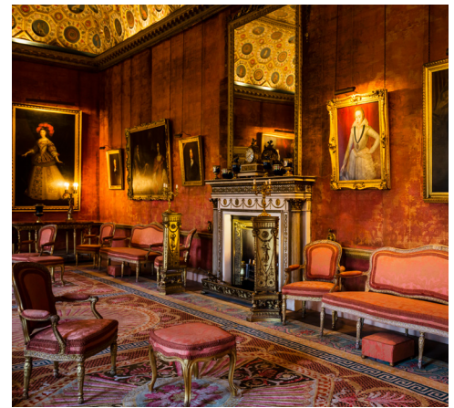
Parure of carved conch shell, collection of the British Museum, London. photo © The Trustees of the British Museum (top) and the Red Drawing Room, Syon House, Richmond, photo courtesy of Syon House (above)