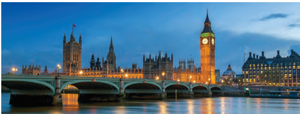
The Thames and Palace of Westminster, London