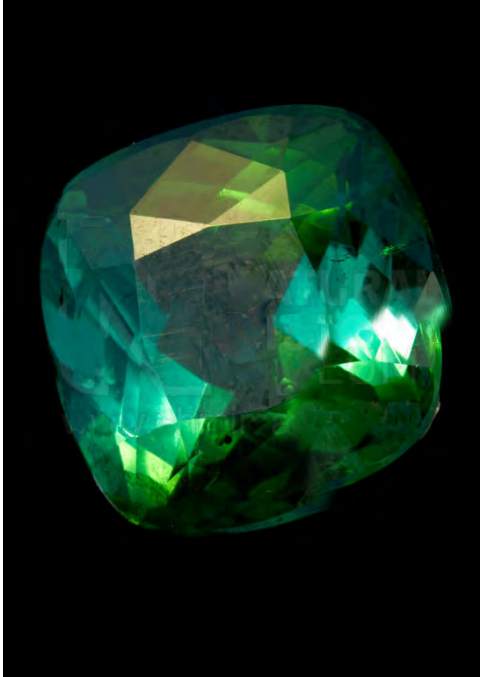
Verdite, Trustees of the Natural History Museum, London