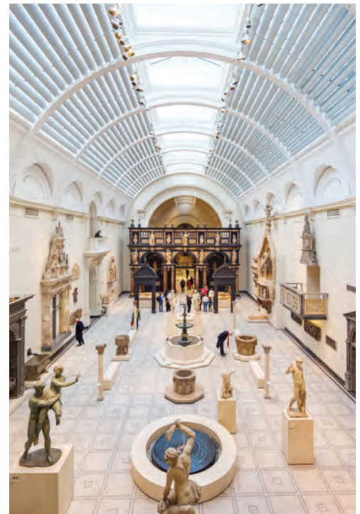
Photos clockwise from top right; Laliq necklace of opal and glass, collection of Wartski, photo courtesy of Wartski, London; Map of the region; The Victoria & Albert Museum, London, photo © Visit London; The Drawing Room, Goldsmith's Hall, London, photo courtesy of The Goldsmith's Company; Diamond oak-leaf and acorn tiara, Hunt & Roskell, 1855, collection of the British Museum, London. Photo © The Trustees of the British Museum; Interior of the British Museum, London, photo © Visit London. Front cover: TBA Back cover: TBA (top) and TBA (bottom).