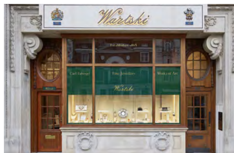
Exterior of Wartski, London

This itinerary is subject to change at the discretion of The Metropolitan Museum of Art and Arrangements Abroad. For complete details, please carefully read the terms and conditions at www.arrangementsabroad.com/terms .