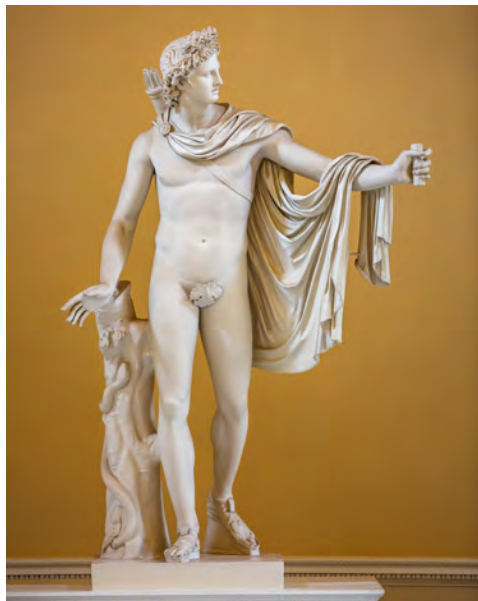
Statue in the Great Hall, Syon House, Richmond