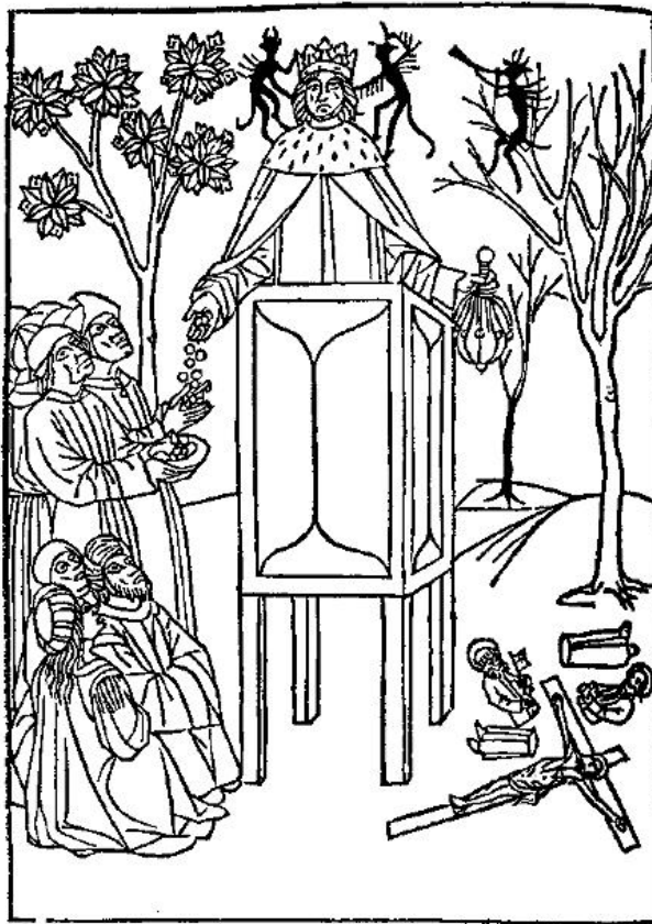
The demons of Antichrist seducing men by bribe and the destruction of sacred images. Lyons, late 15th century.