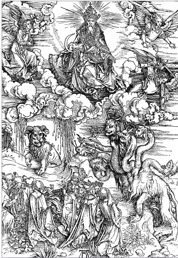
Albrecht Dürer, “The Apocalypse Of St. John,” image of the seven-headed beast and the beast with lamb’s horns (Rev. 13), 1496–98 woodcuts, from the Wetmore Print Collection at Connecticut College.

IN CONCLUSION: FROM THE “ANTI-TRADITION” TO THE “COUNTER-TRADITION”