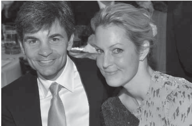
George Stephanopoulos and Ali Wentworth