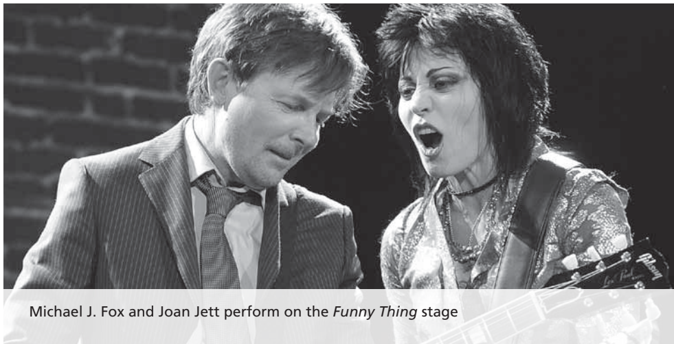
Michael J. Fox and Joan Jett perform on the Funny Thing stage