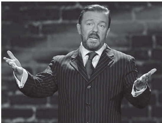
Ricky Gervais gets the laughs at Funny Thing