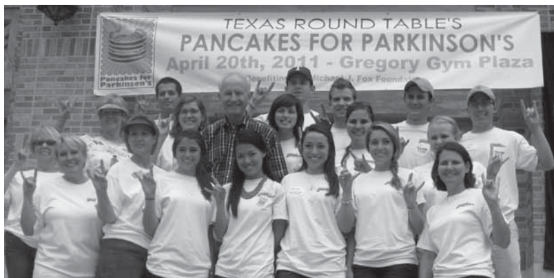
Longhorn Pancakes for Parkinson's