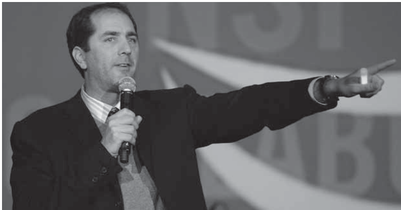
World Poker Tour champion Phil Gordon at Funny Thing