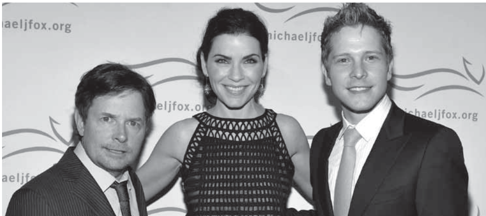
Michael J. Fox, Julianna Margulies and Matt Czuchry at MJFF's 2011 gala A Funny Thing Happened on the Way to Cure Parkinson's