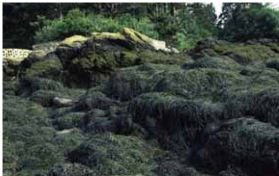
Figure 1. Estuarine rock habitat with Ascophyllum nodosum