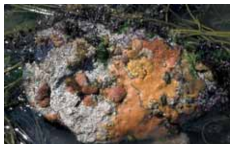
Diverse underboulder community including encrusting sponges and the bulbous bryozoan Turbicellepora magnicostata .