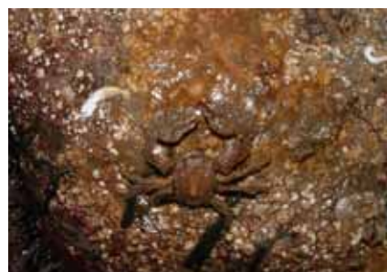
Underboulder community of barnacles and bryozoans with the hairy porcelain crab Porcellana platycheles , (Image: CCW)