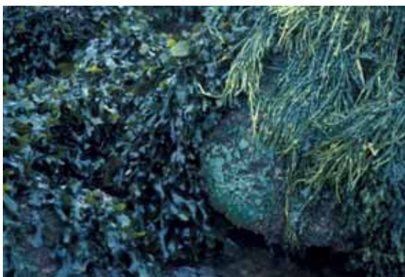
Figure 2. Fucus serratus and Ascophyllum nodosum on boulders.