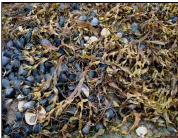
Blue mussel, Mytilus edulis on intertidal sediment.