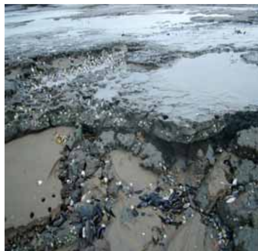
Figure.10 Piddocks in peat. (Image: JNCC shells. (Image: CCW).