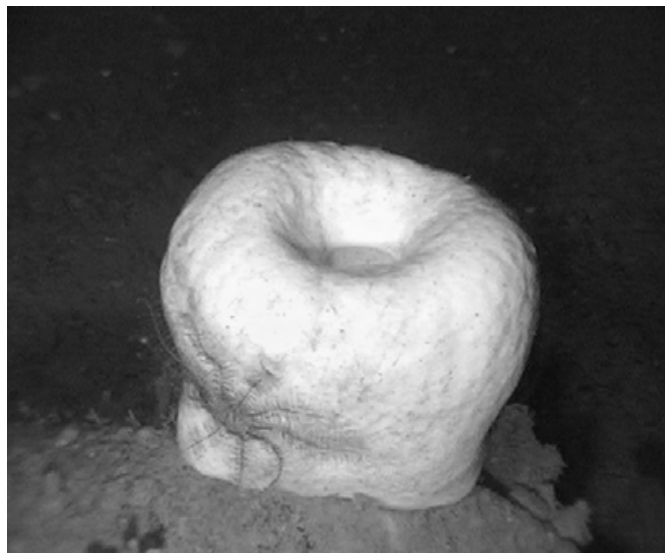
Geodia sponge