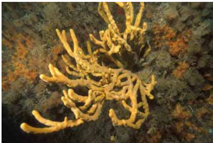
showing a large specimen of the sponge Axinella dissimilis .

Zone/depth Upper circalittoral and lower circalittoral