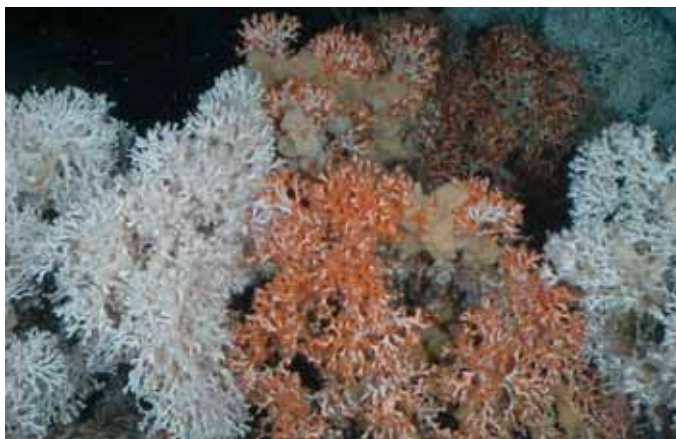
Figure above: Lophelia pertusa reef (showing the white and orange colour morphs) at 400 m depth off Rost, Norway, the largest cold-water coral reef on Earth. Photograph taken on Polarstern Cruise ARK-XXII © Jago/IFM Geomar 2007.