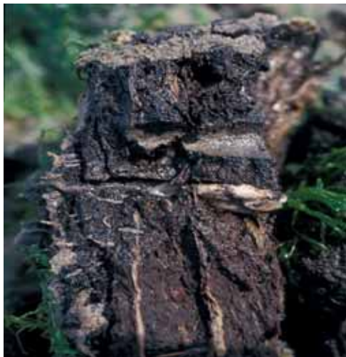
Figure 9. Clay exposure with dead piddock image collection, Anon.)