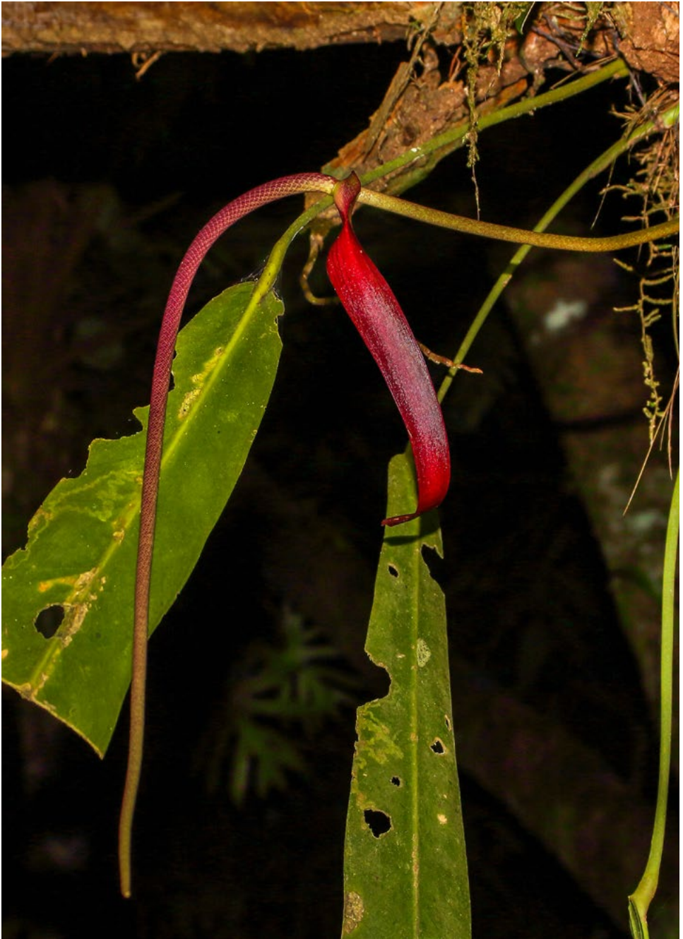
Figure 8. Anthurium kubickii . Lower portion of leaf with inflorescence. Guayacan Rainforest