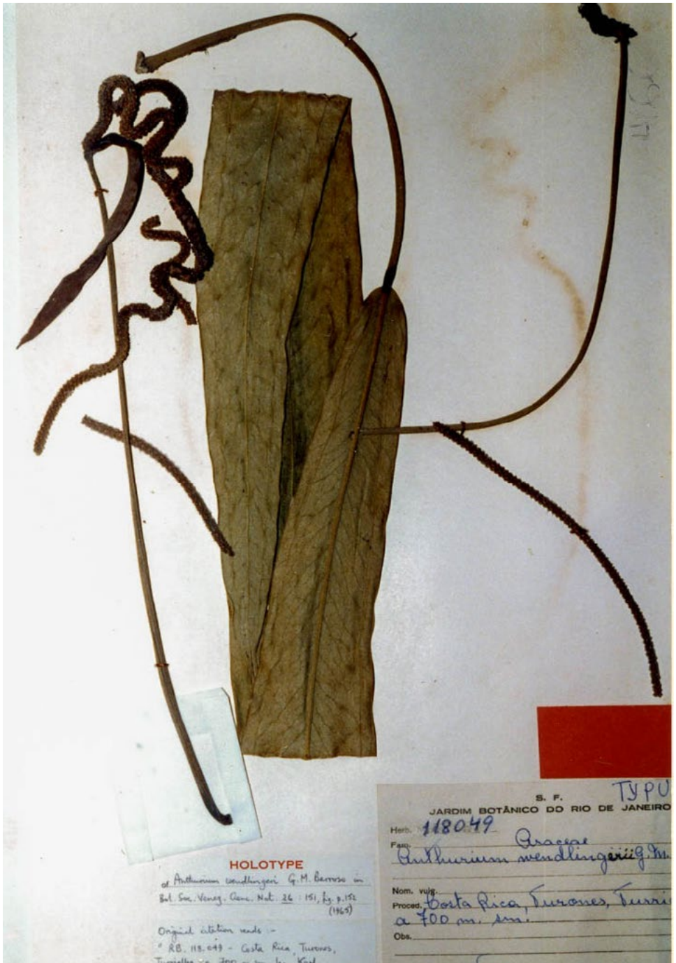
Figure 4. Holotype specimen of Anthurium wendlingeri G.M.Barroso.