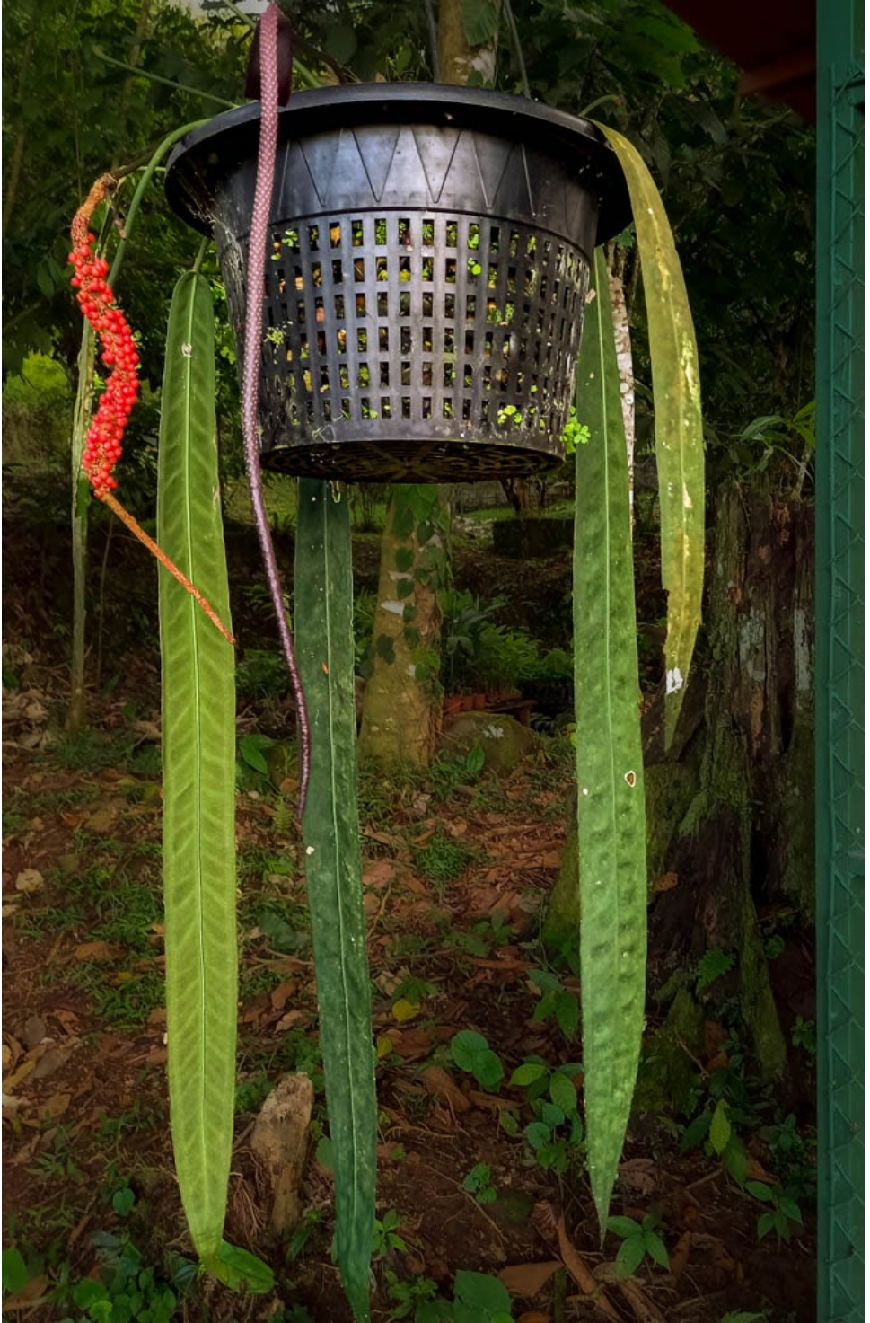
Figure 6. Anthurium kubickii . Potted plant showing habit. Guayacan Rainforest