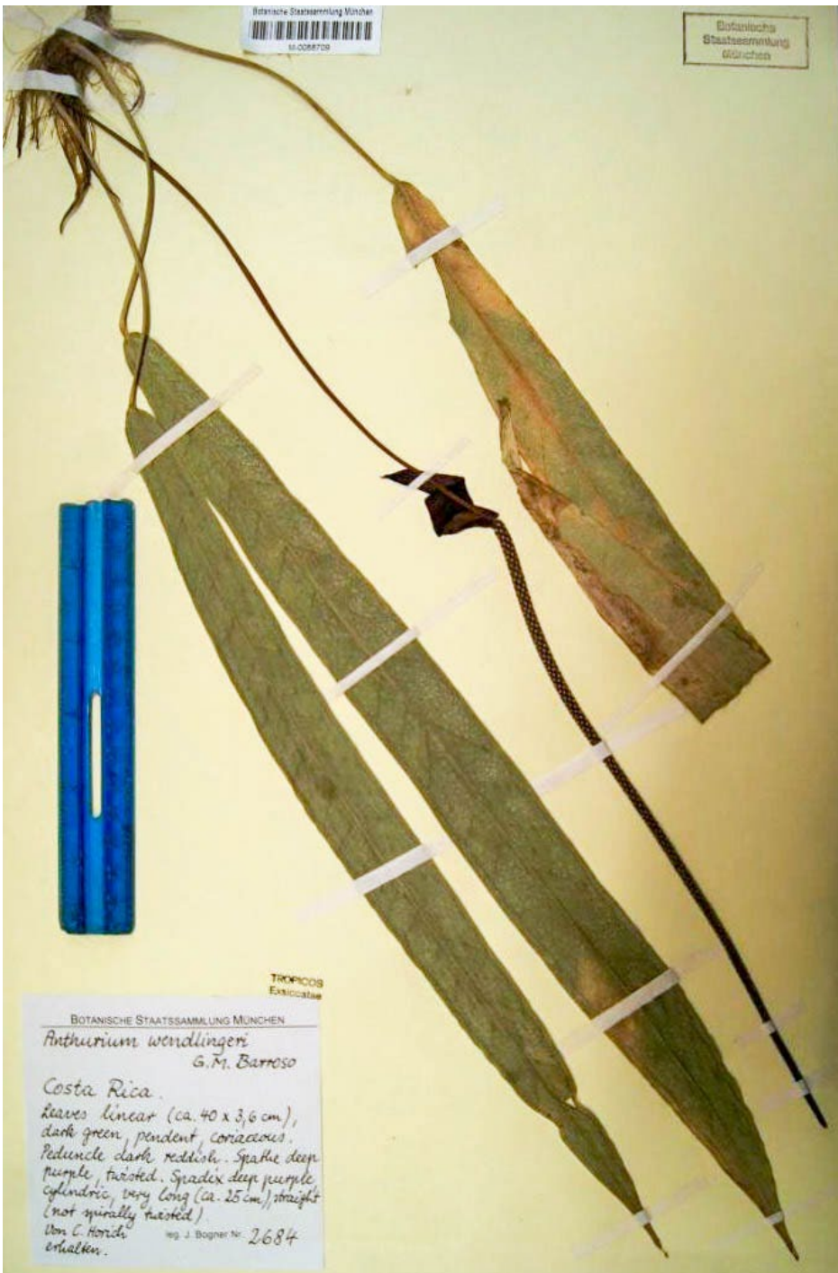
Figure 3. Herbarium specimen of Bogner 2684 (M), first herbarium collection of A. kubickii , vouchered from living plant cultivated at Munich Botanical Garden (without date but believed to be 1965 or 1966).