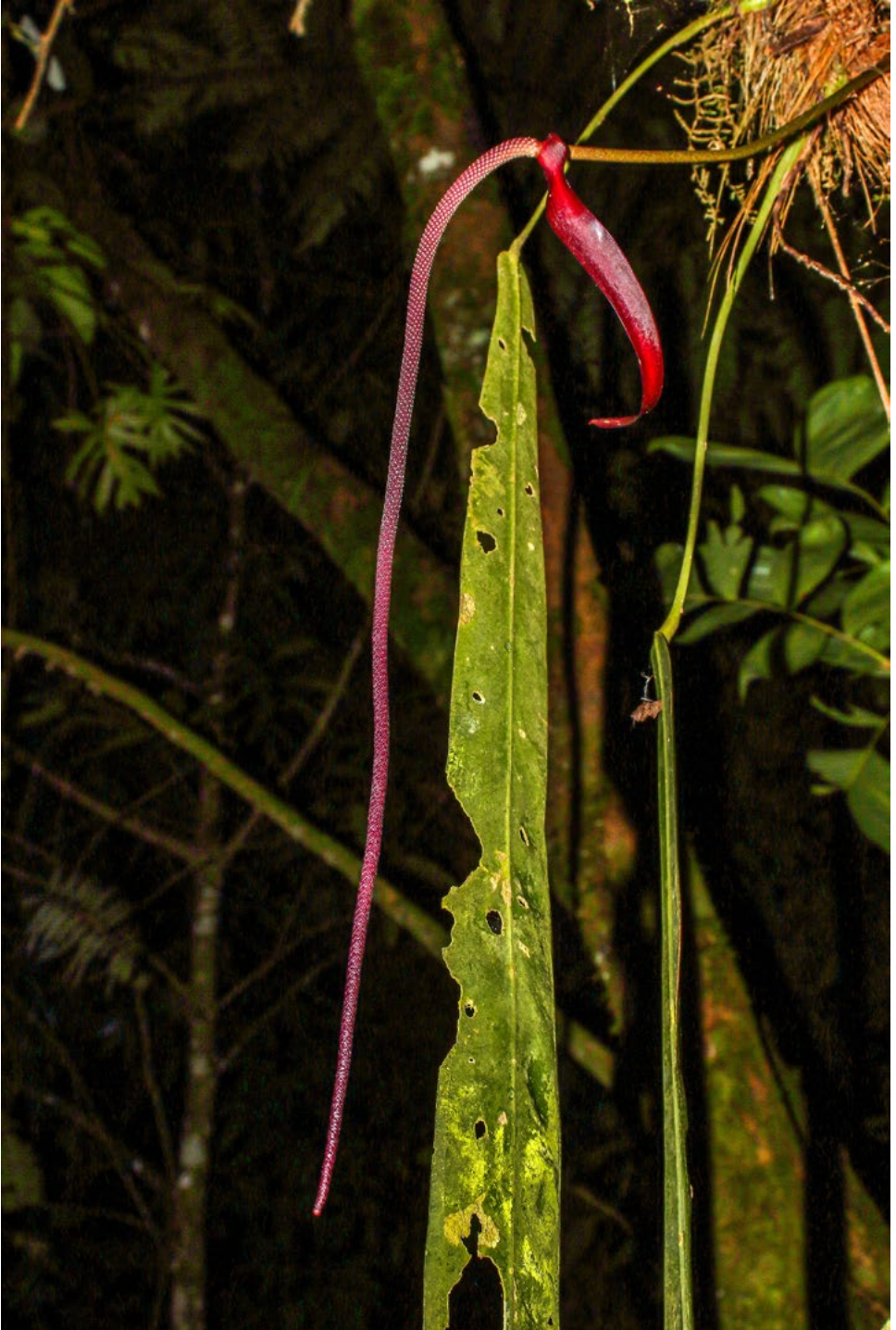
Figure 7. Anthurium kubickii Close-up of stem, leaf base and petiole. Guayacan Rainforest Reserve, Costa Rica.