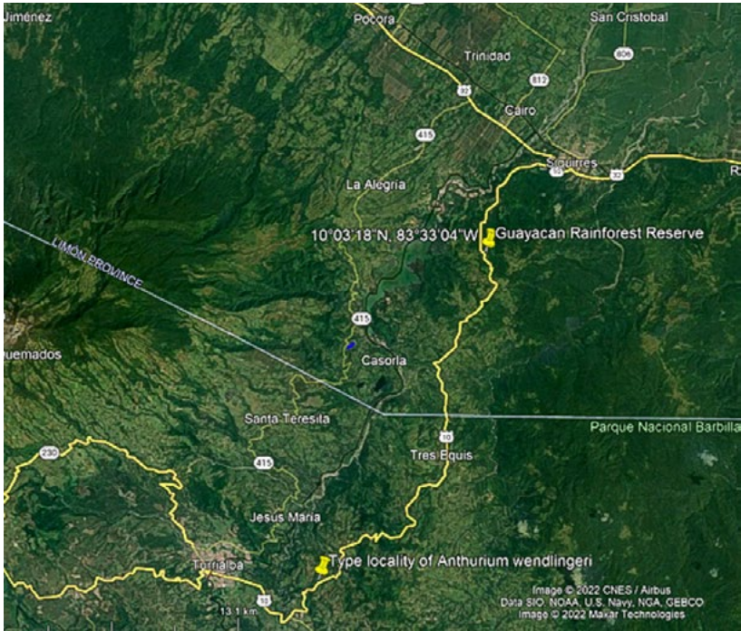
Figure 1. Google Earth map showing type locality of Anthurium wendlingeri .