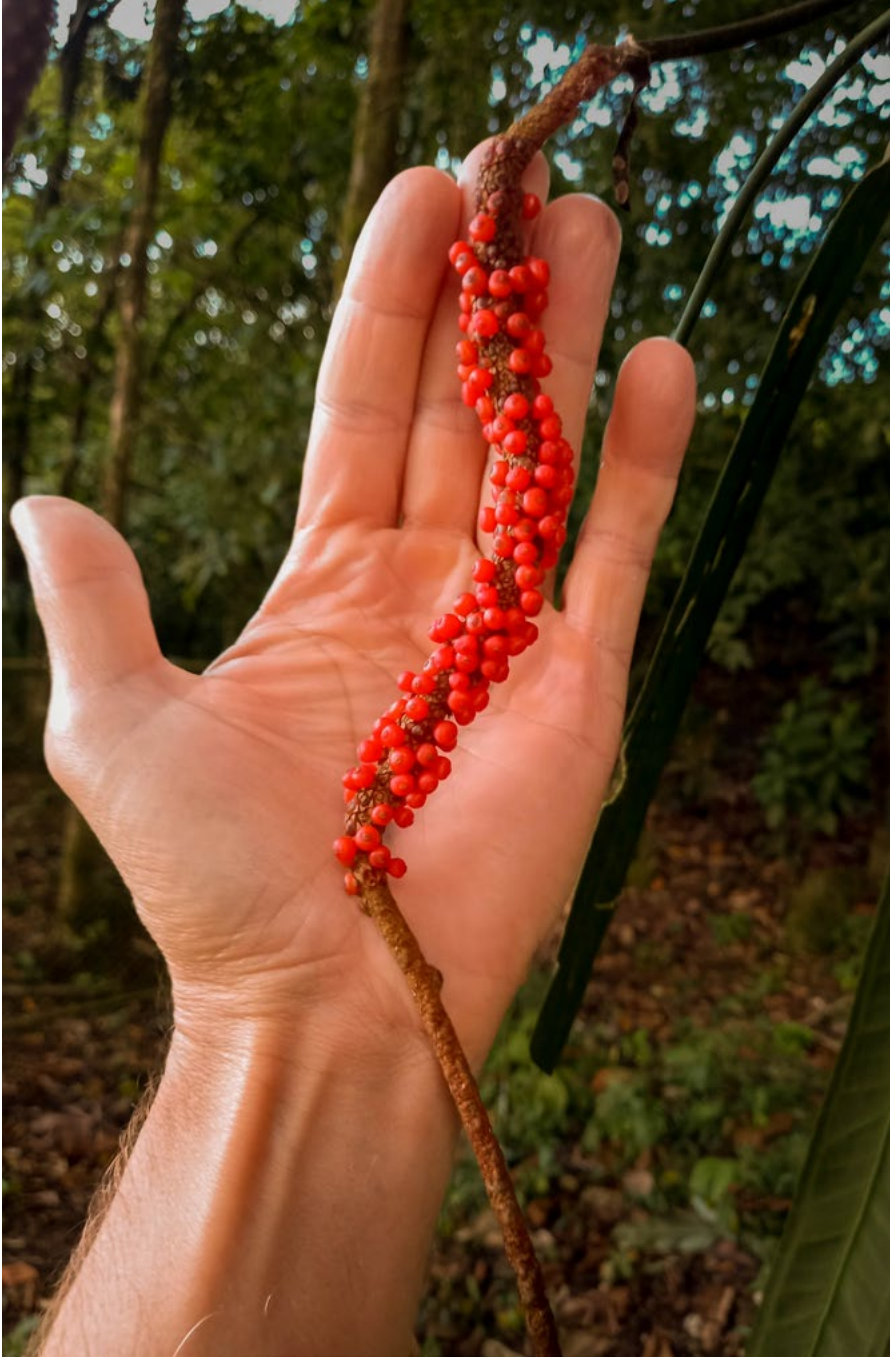
Figure 9. Anthurium kubickii . Inflorescence. Guayacan Rainforest Reserve, Costa Rica.