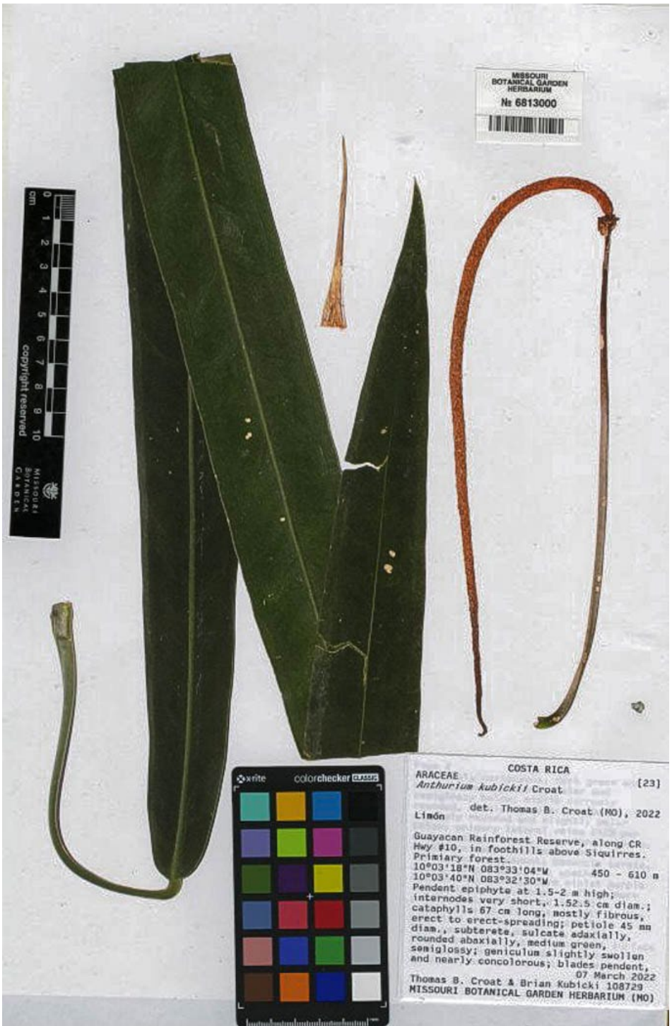
Figure 10. Type specimen of Anthurium kubickii Croat, T.B.Croat & B.Kubicki 108730 (MO)