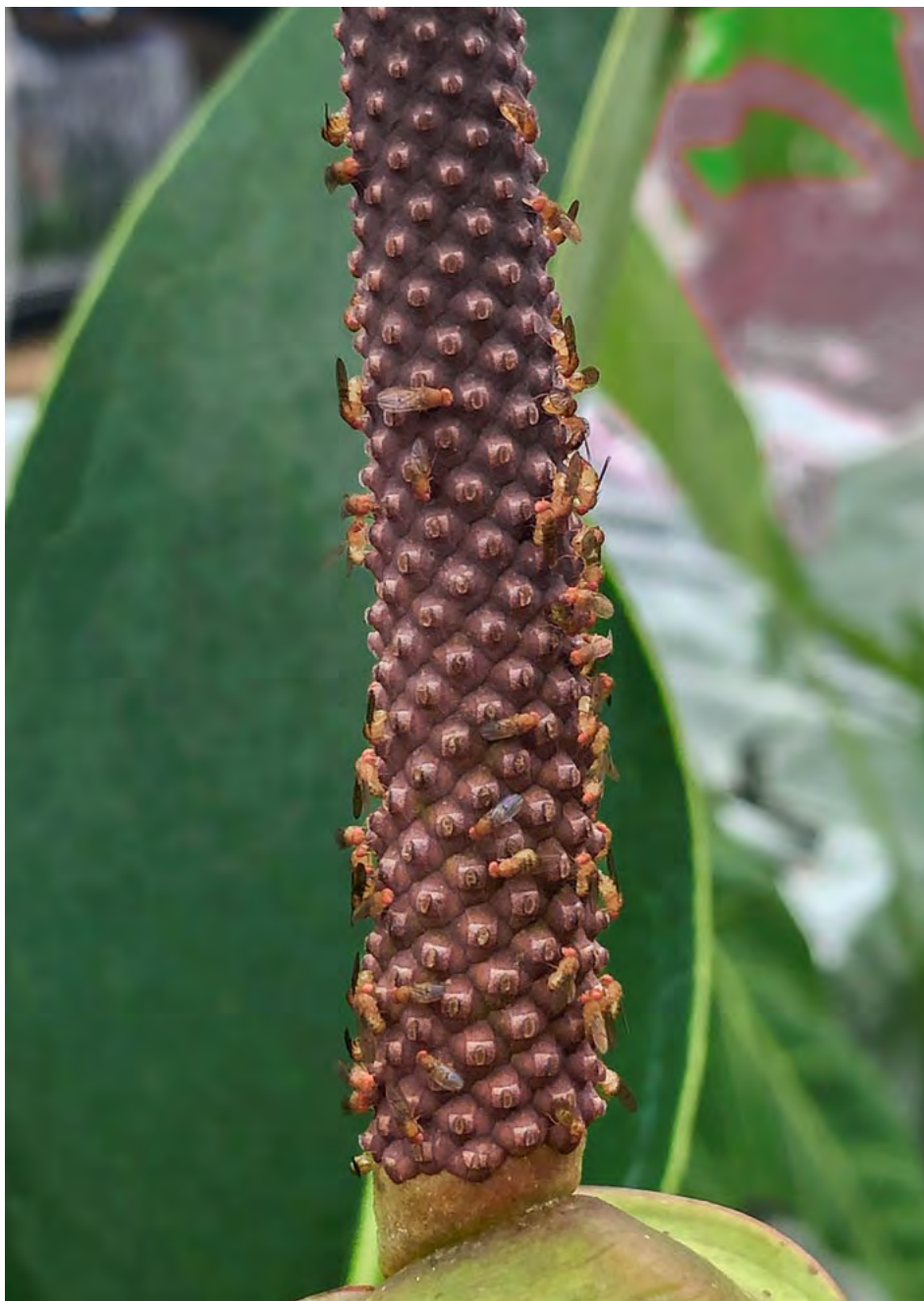
Figure 38. Anthurium ixtenamense Croat, Vannini & Cast. Mont. Spadix at anthesis with small bees.