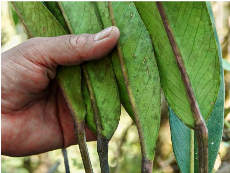
Figure 30. Anthurium ixtenamense Croat, Vannini & Cast. Mont. Habit showing abaxial leaf surfaces.