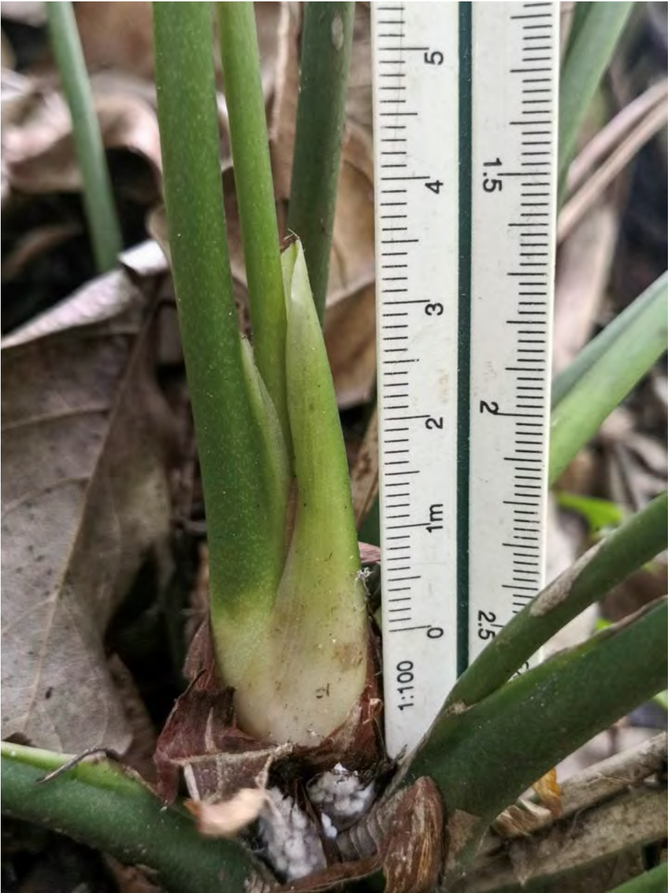
Figure 12. Anthurium diabloense Vannini, Croat & Cast. Mont. Petioles and cat-