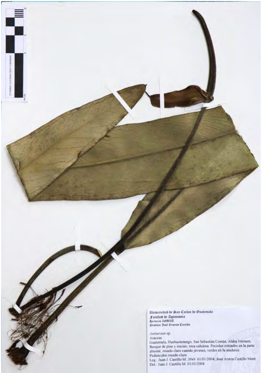
Figure 41. Anthurium ixtenamense Croat, Vannini & Cast. Mont. Herbarium type specimen (J. J. Castillo Mont 3049).