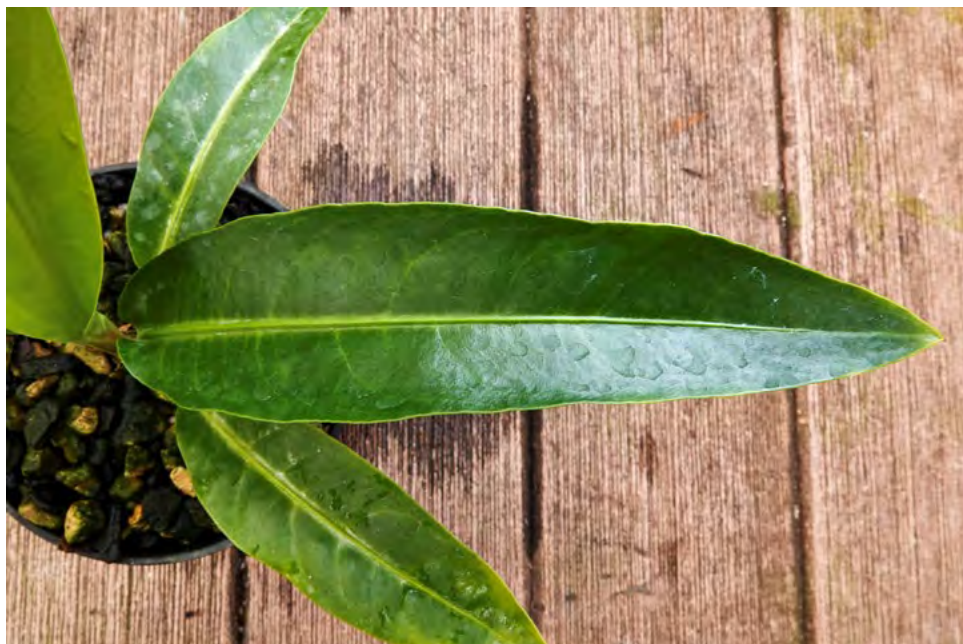
Figure 2. Anthurium breedlovei Croat, Vannini & Fred Mull. Habit, showing abaxial leaf blades.