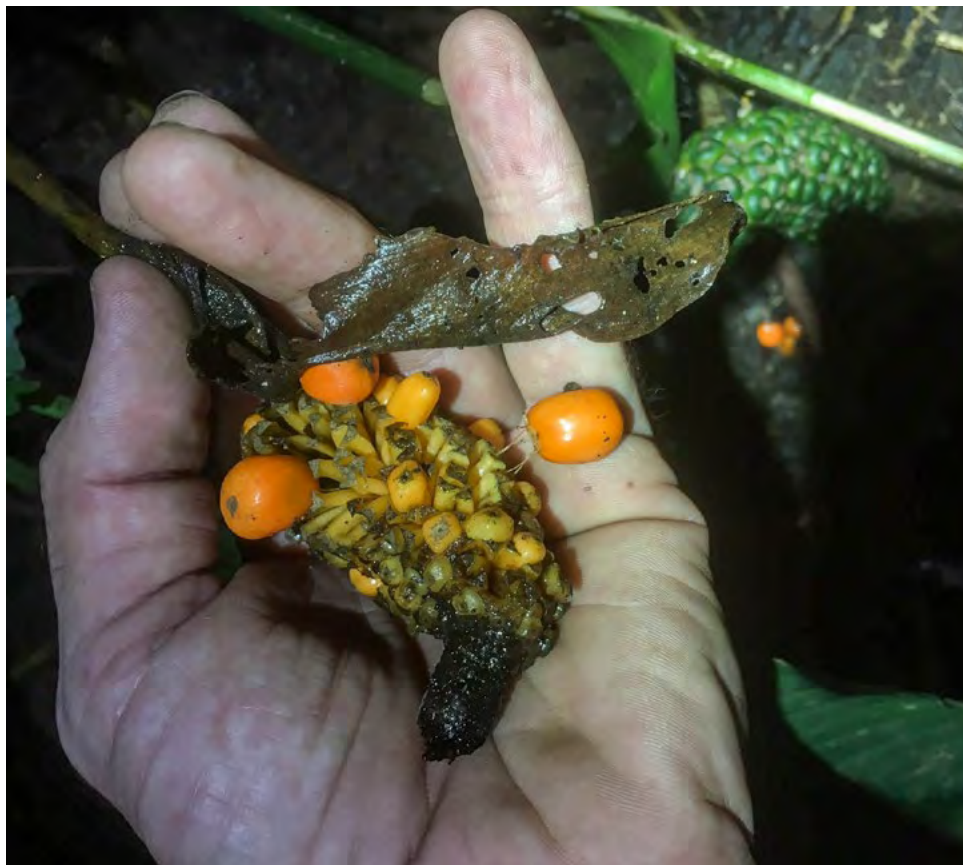
Figure 28. Anthurium fredmulleri Vannini, Croat & Cast. Mont. Inflorescence with loose berries.