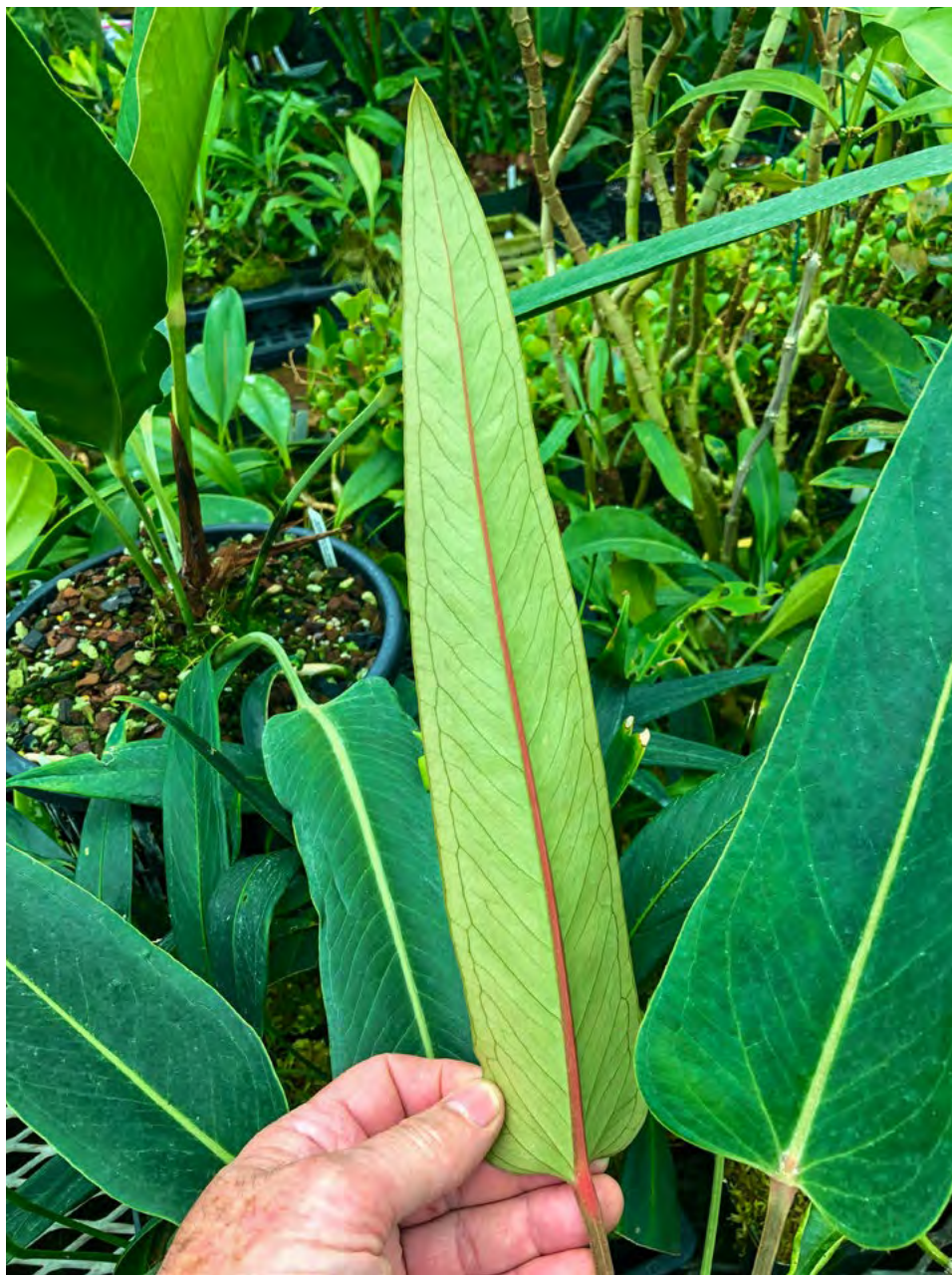
Figure 31. Anthurium ixtenamense Croat, Vannini & Cast. Mont. Juvenile leaves, abaxial surface left, adaxial surface right.