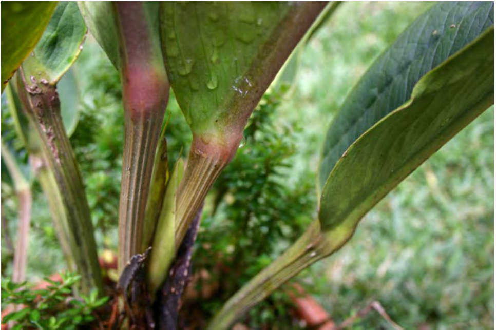
Figure 34. Anthurium ixtenamense Croat, Vannini & Cast. Mont. Petioles.