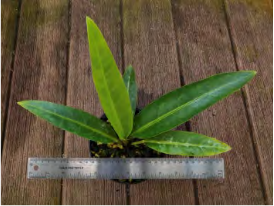
Figure 1. Anthurium breedlovei Croat, Vannini & Fred Mull. Habit.