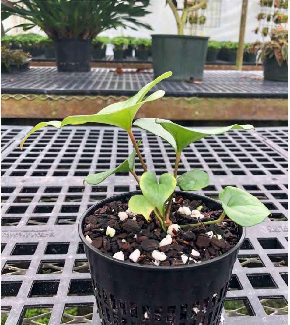
Figure 11. Anthurium diabloense Vannini, Croat & Cast. Mont. Cultivated plant showing side view of leaf.