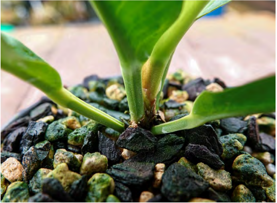
Figure 4. Anthurium breedlovei Croat, Vannini & Fred Mull. Leaf blade, abaxial surface.