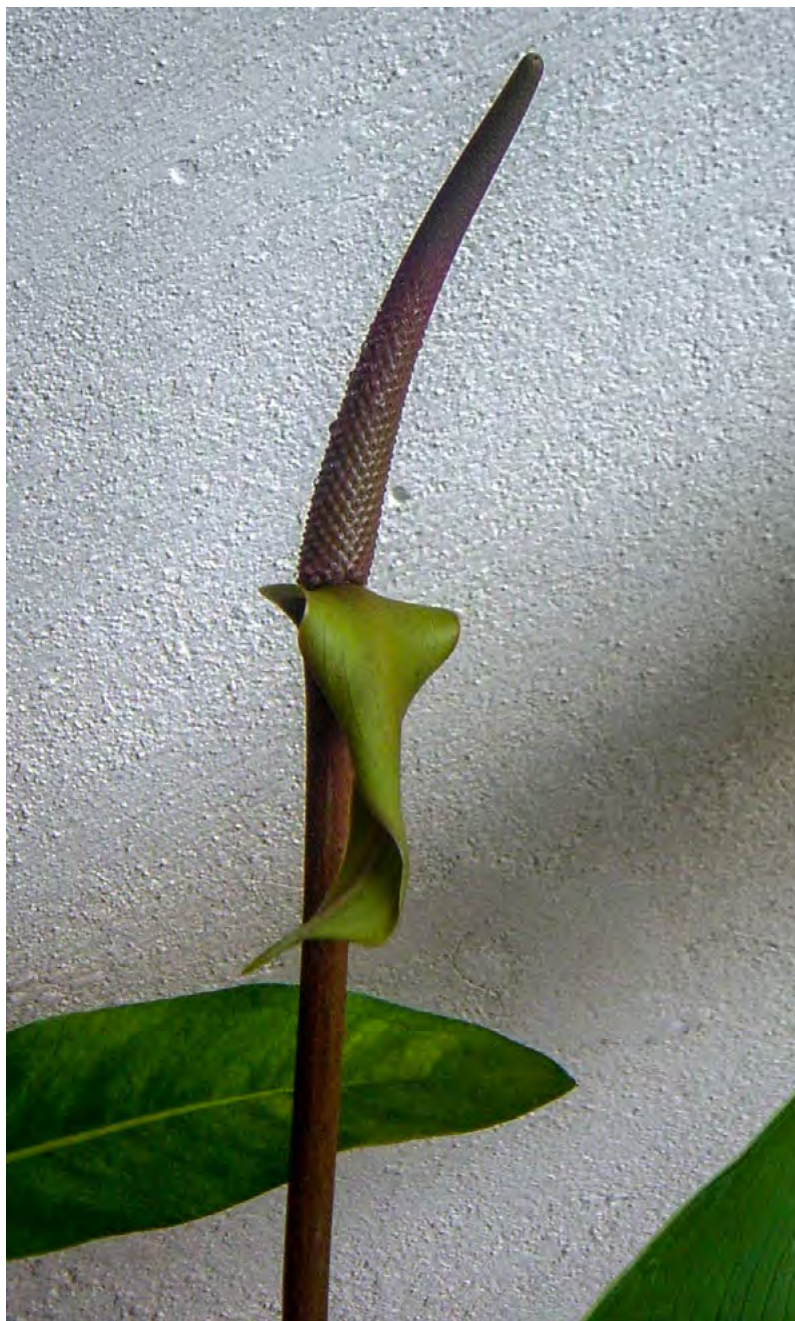
Figure 37. Anthurium ixtenamense Croat, Vannini & Cast. Mont. Inflorescence showing purplish violet spadix and green spathe.