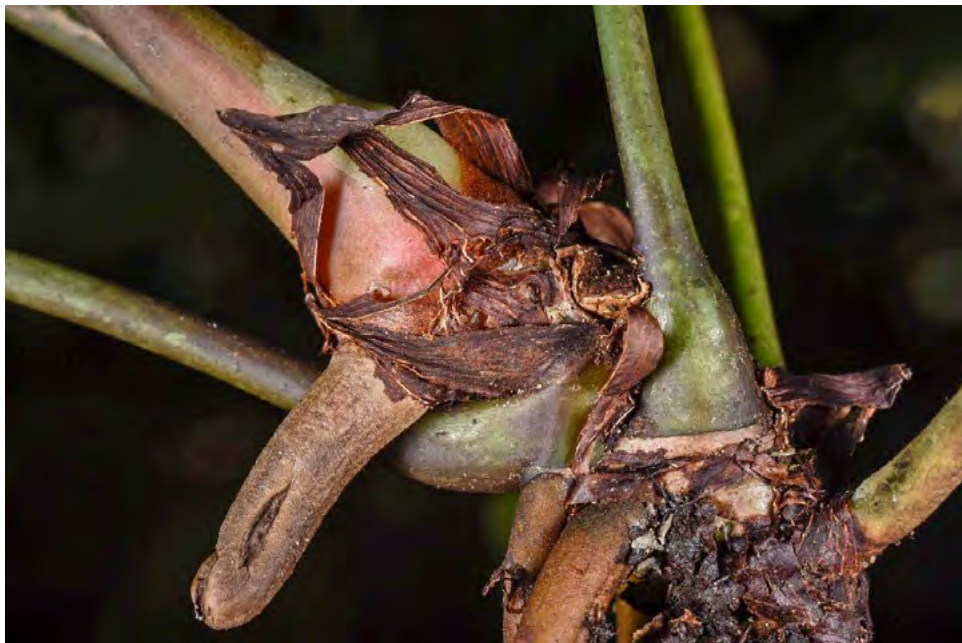
Figure 21. Anthurium fredmulleri Vannini, Croat & Cast. Mont. Stem apex and weathered fibrous cataphylls.