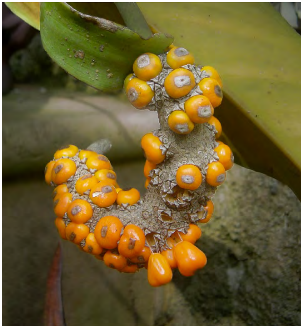
Figure 40. Anthurium ixtenamense Croat, Vannini & Cast. Mont. Inflorescence.