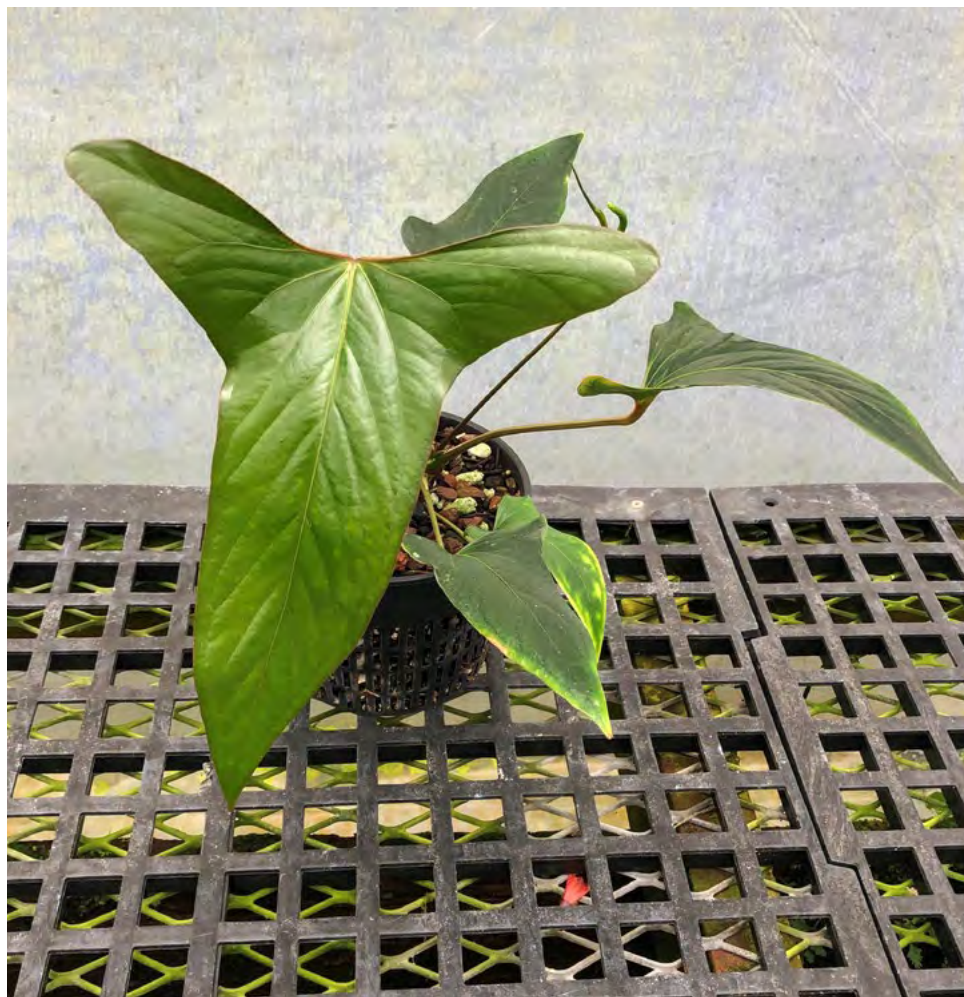
Figure 42. Anthurium ustupoense Croat & Vannini. Habit of potted plant.