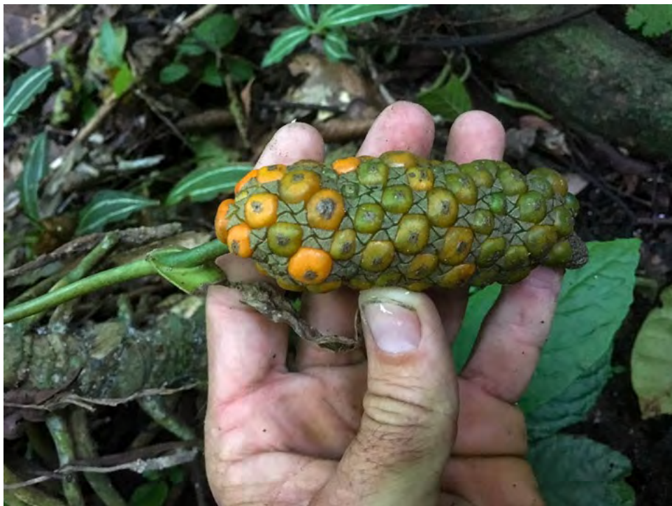
Figure 27. Anthurium fredmulleri Vannini, Croat & Cast. Mont. Inflorescence with nearly ripe berries.