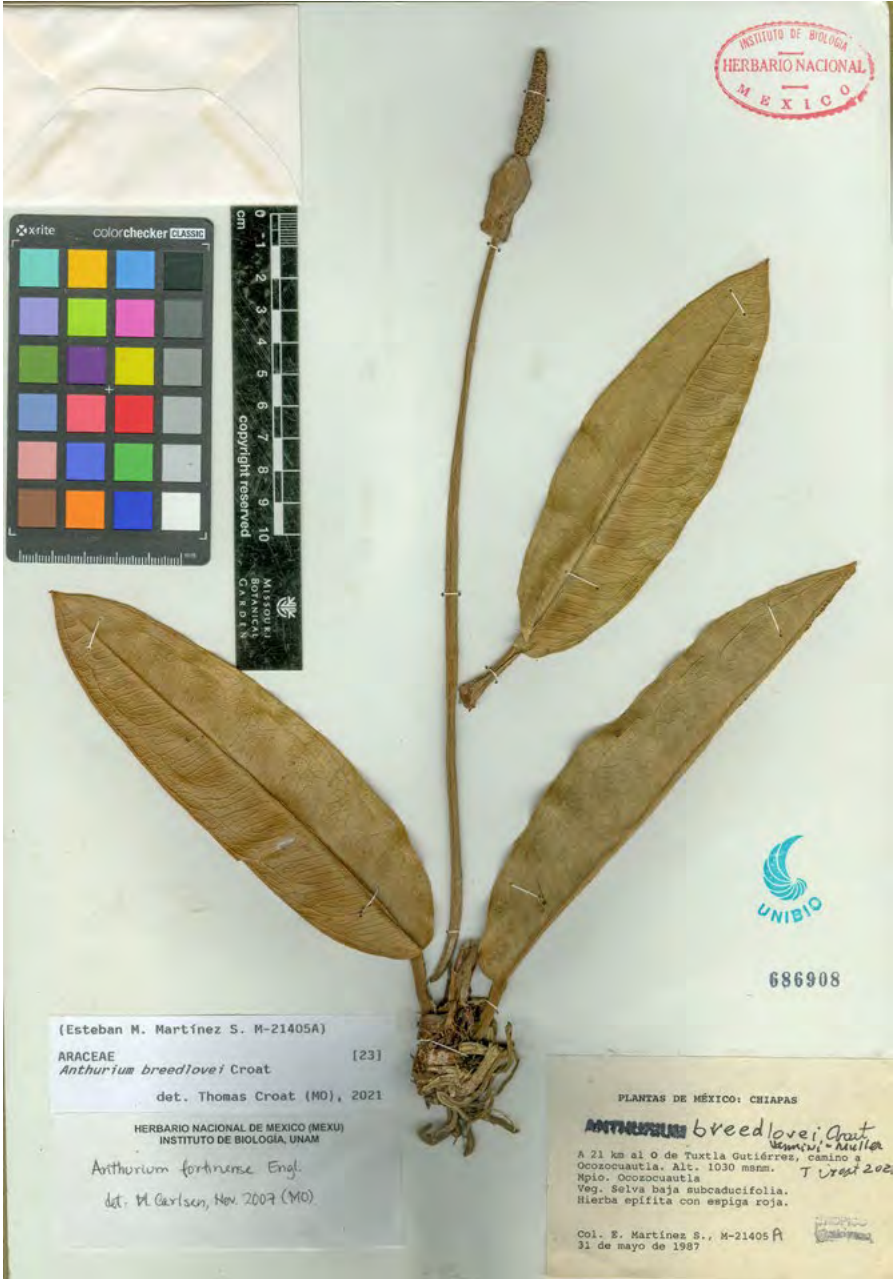
Figure 8. Anthurium breedlovei Croat, Vannini & Fred Mull. Herbarium specimen showing entire plant with leaf blade, abaxial surface, with apex folded over, revealing adaxial surface.