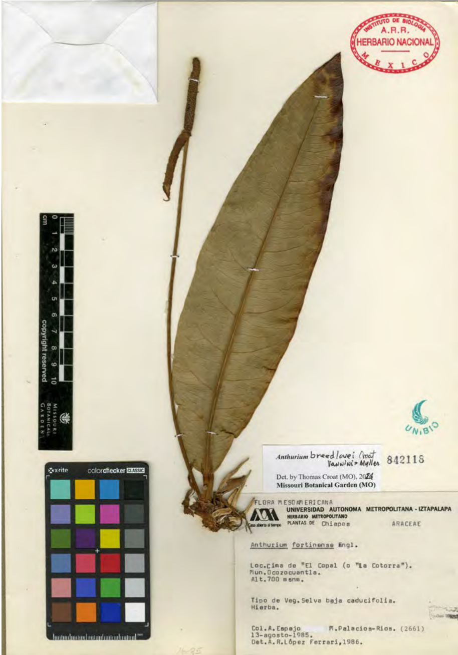
Figure 9. Anthurium breedlovei Croat, Vannini & Fred Mull. Herbarium specimen showing entire plant with leaf blade, abaxial surface and inflorescence.