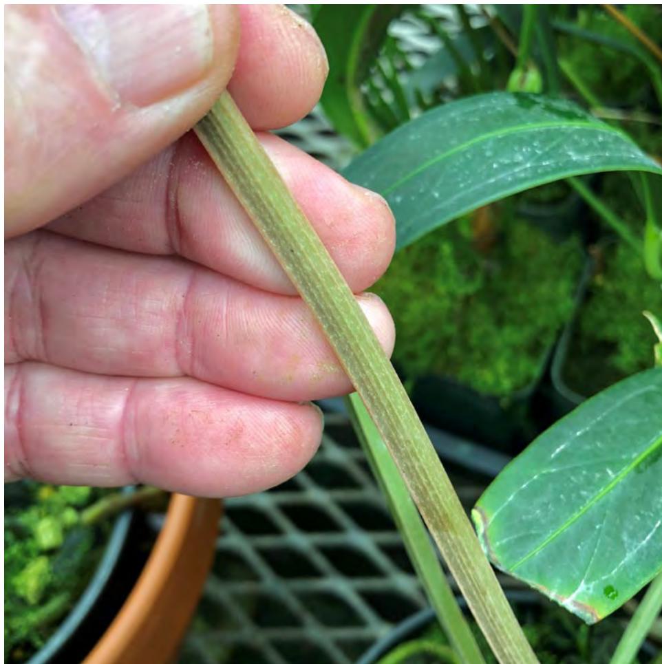
Figure 36. Anthurium ixtenamense Croat, Vannini & Cast. Mont. Showing ribbing on petioles.