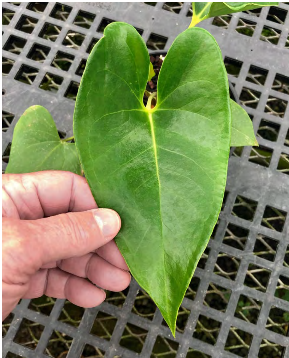
Figure 13. Anthurium diabloense Vannini, Croat & Cast. Mont. Leaf blade, adaxial surface.