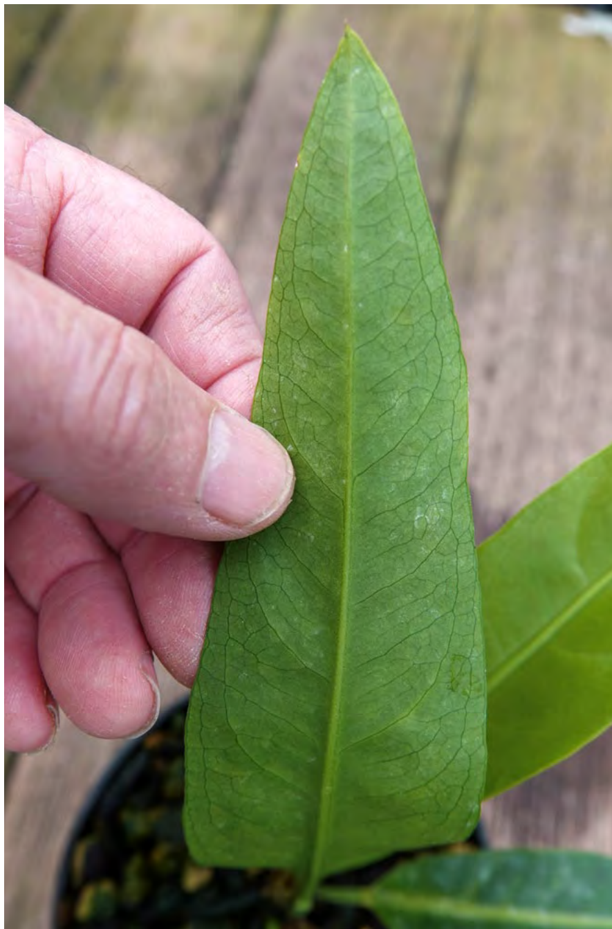
Figure 3. Anthurium breedlovei Croat, Vannini & Fred Mull. Leaf blade,