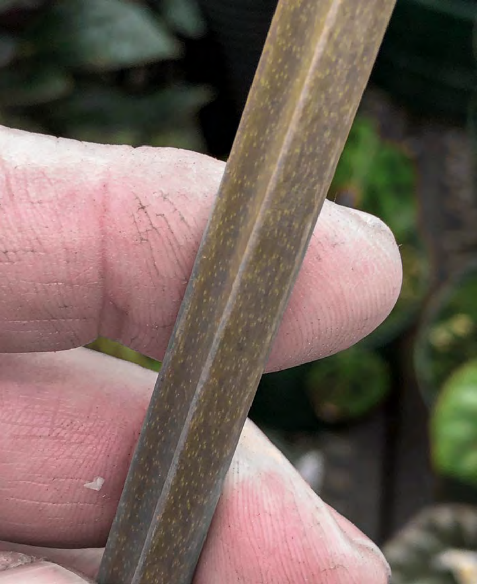
Figure 35. Anthurium ixtenamense Croat, Vannini & Cast. Mont. Showing petiole cross-sectional shape.