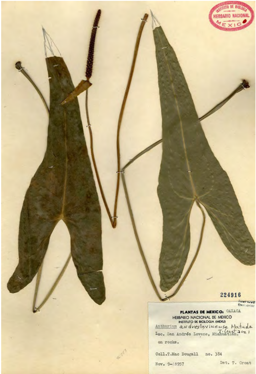
Figure 46. Anthurium andrelovinense Matuda. Herbarium specimen (M. Dougall 384). On left leaf blade, adaxial surface, on right leaf blade, abaxial surface.