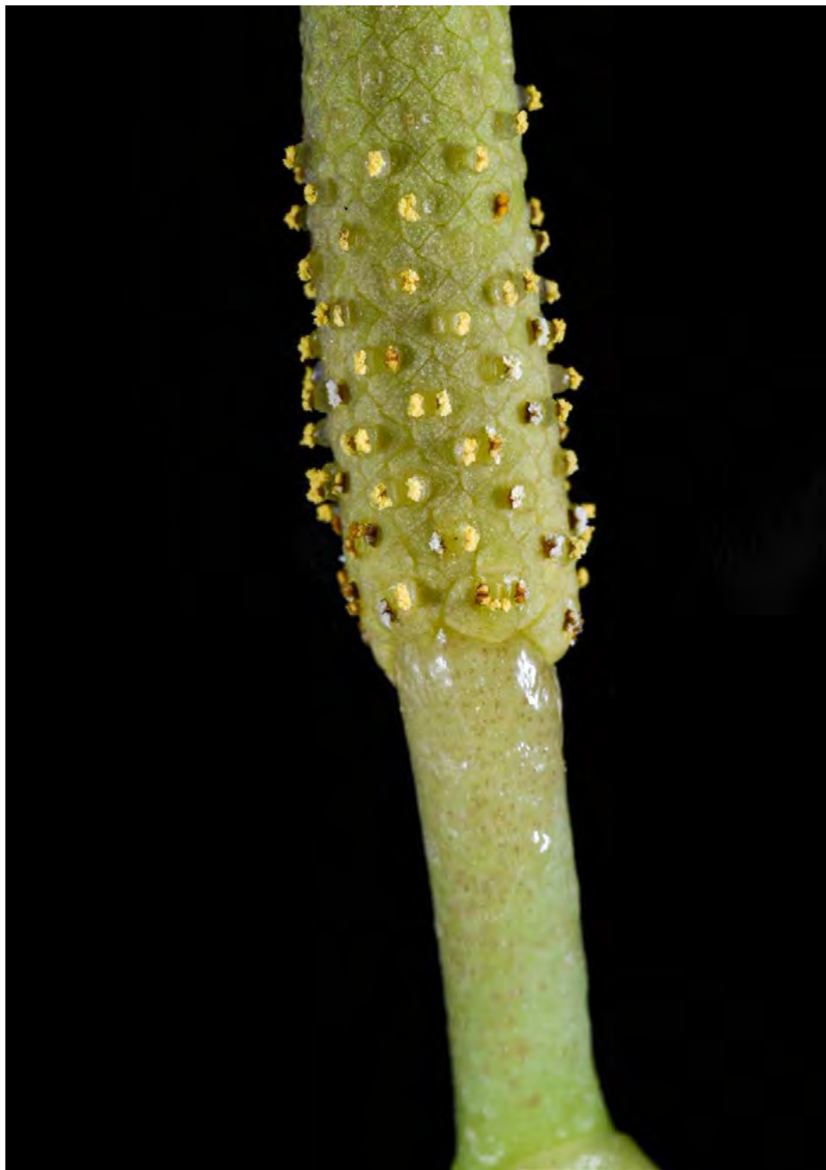
Figure 26. Anthurium fredmulleri Vannini, Croat & Cast. Mont. Newly opening inflorescence at anthesis with close-up of stamens.