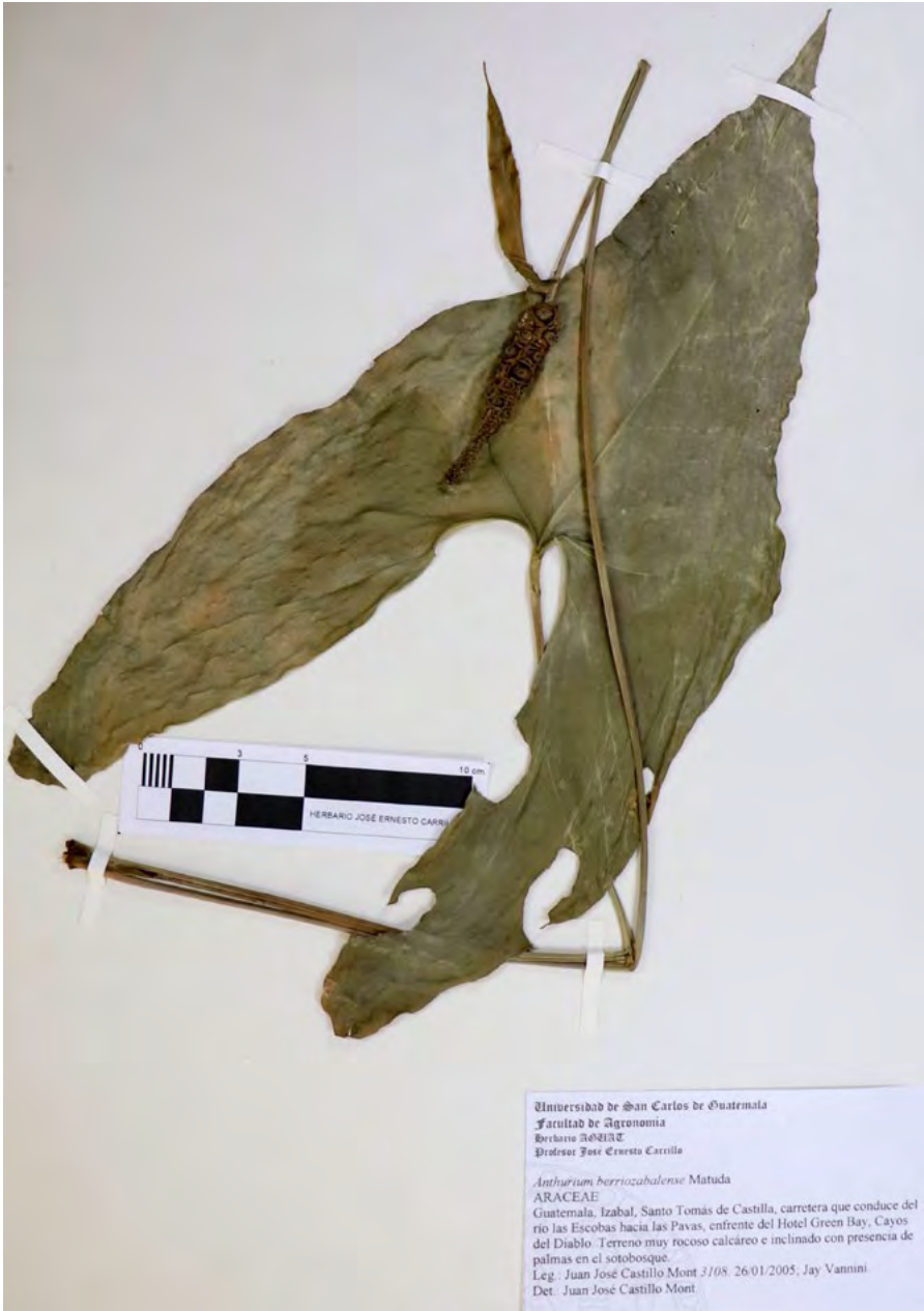
Figure 17. Anthurium diabloense Vannini, Croat & Cast. Mont. Herbarium specimen showing leaf blade, adaxial surface with petiole and inflorescence.