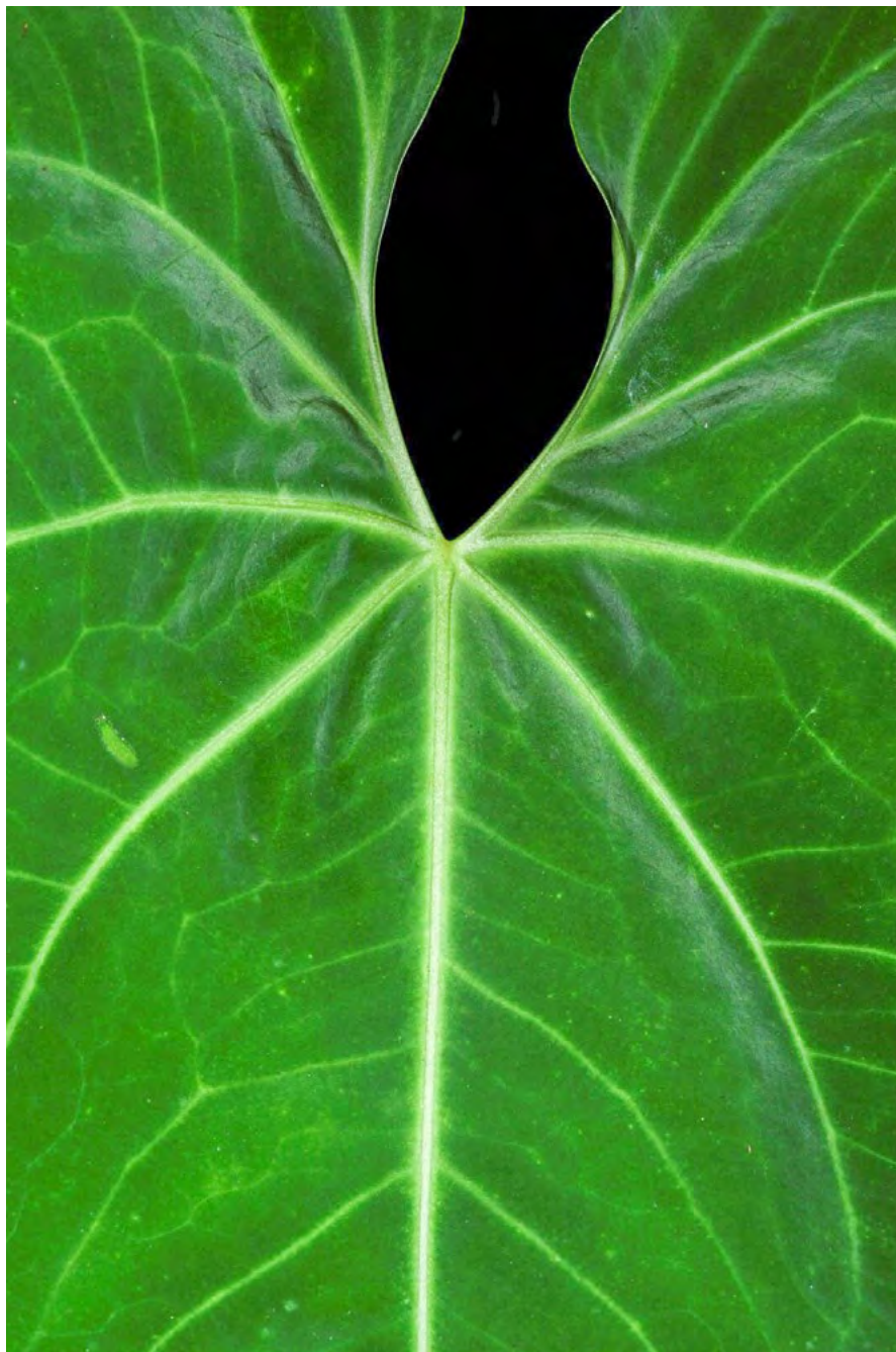
Figure 19. Anthurium fredmulleri Vannini, Croat & Cast. Mont. Adult leaf blade, adaxial surface.