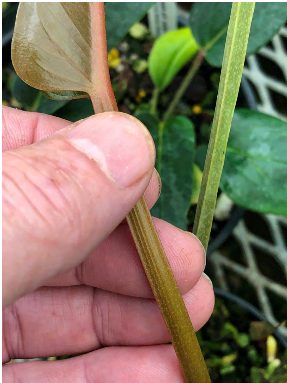
Figure 44. Anthurium ustupoense Croat & Vannini. Petiole showing ribbed sides and abaxial rib.