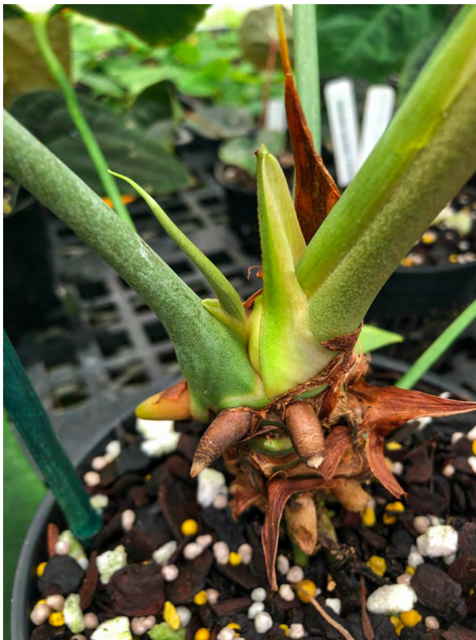
Figure 23. Anthurium fredmulleri Vannini, Croat & Cast. Mont. Stem with pre-anthesis inflorescence, roots, and cataphylls.