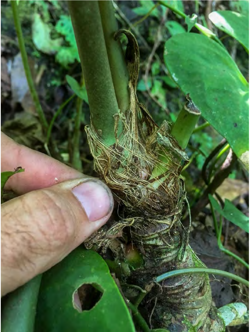
Figure 22. Anthurium fredmulleri Vannini, Croat & Cast. Mont. Inflorescence with nearly ripe berries.