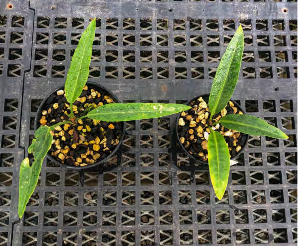
Figure 6. Anthurium breedlovei Croat, Vannini & Fred Mull. Juvenile plant (cultivated by J. Vannini).