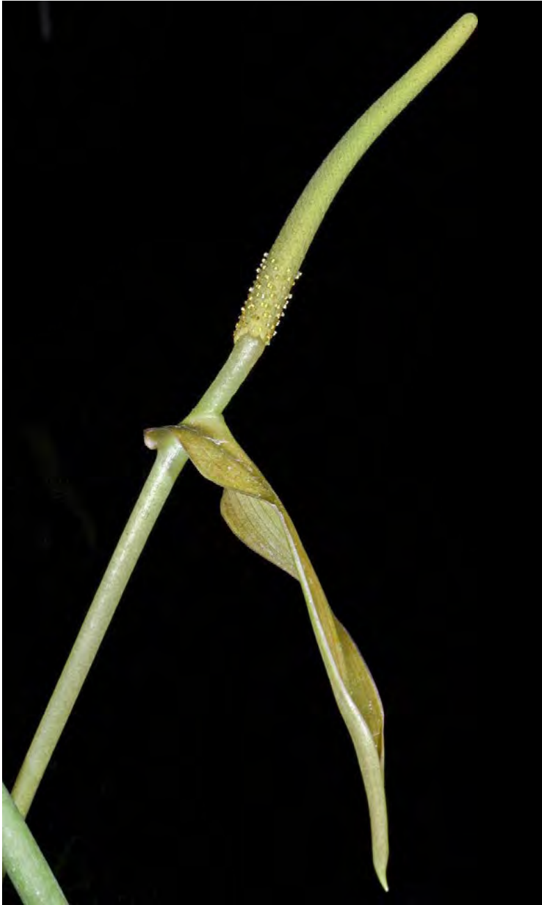
Figure 24. Anthurium fredmulleri Vannini, Croat & Cast. Mont. Newly opening inflorescence at anthesis, side view.