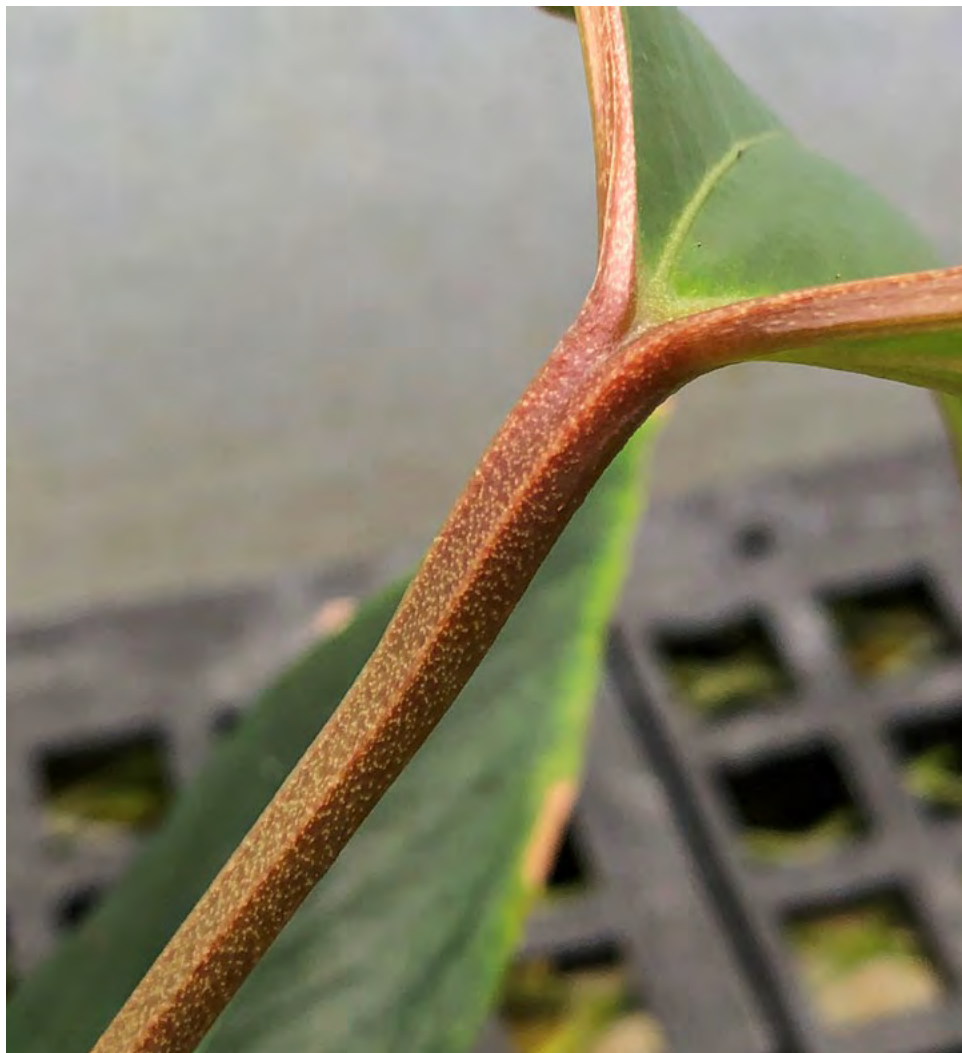
Figure 43. Anthurium ustupoense Croat & Vannini. Petiole showing flattened adaxial surface.