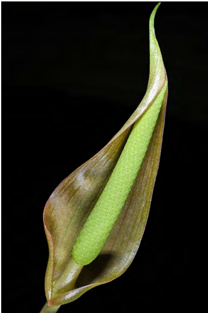
Figure 25. Anthurium fredmulleri Vannini, Croat & Cast. Mont. Newly opening inflorescence.