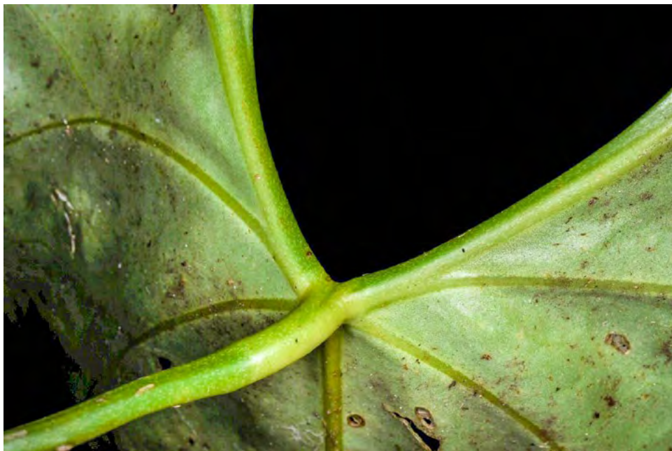
Figure 20. Anthurium fredmulleri Vannini, Croat & Cast. Mont. Adult leaf blade, abaxial surface with geniculum.