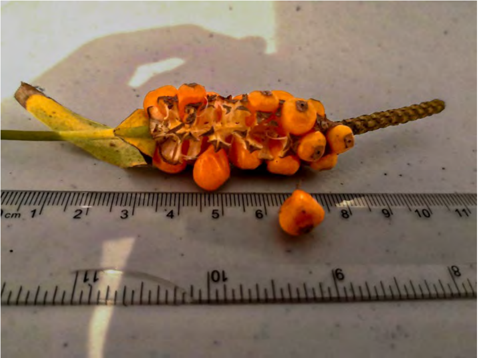
Figure 14. Anthurium diabloense Vannini, Croat & Cast. Mont. Fruits.