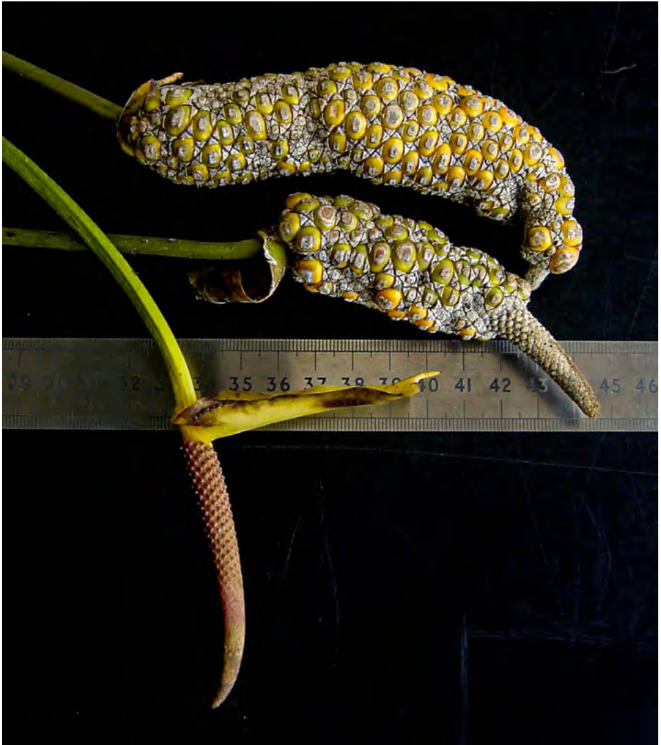
Figure 39. Anthurium ixtenamense Croat, Vannini & Cast. Mont. Two infructescences and one inflorescence.