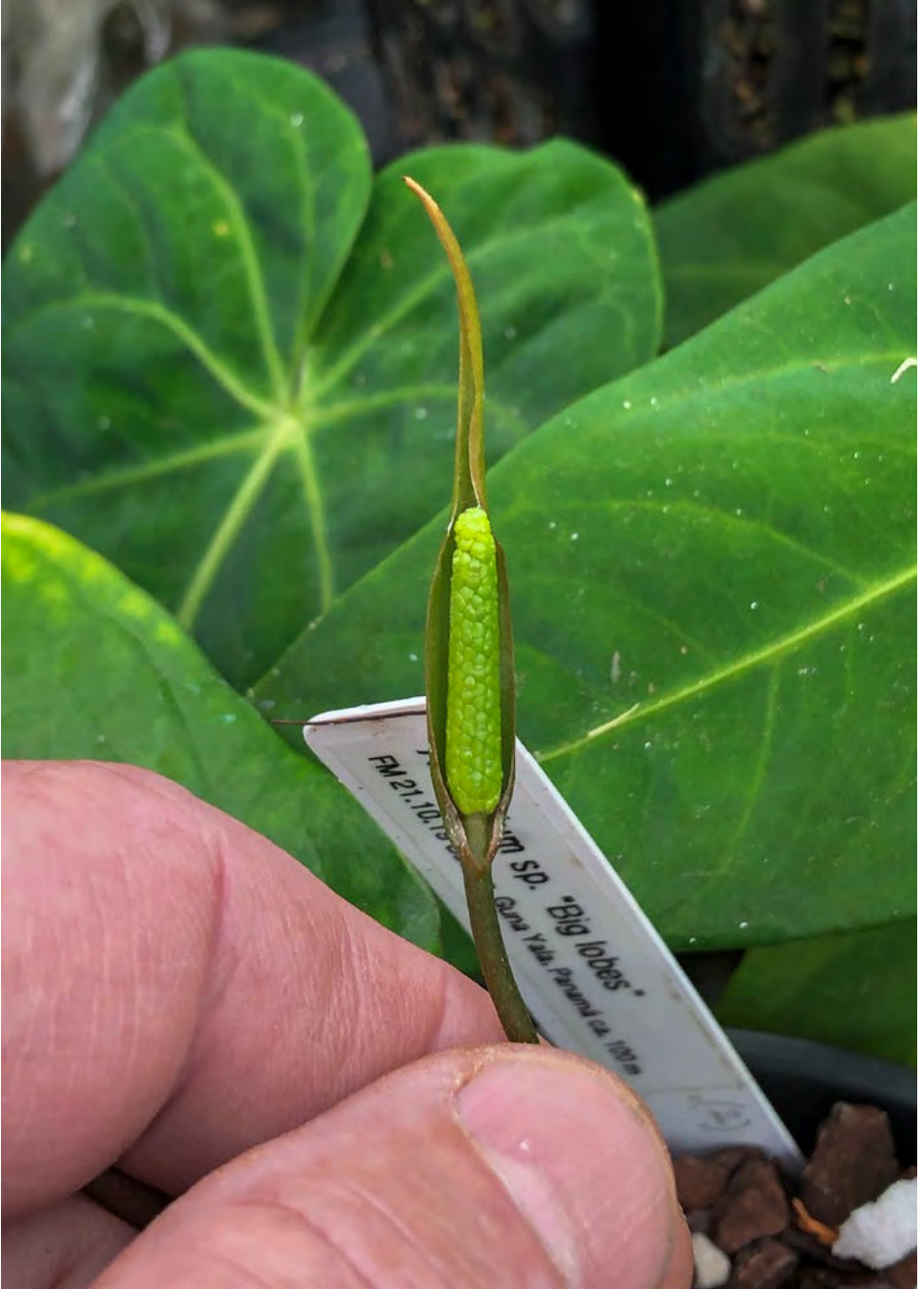
Figure 45. Anthurium ustupoense Croat & Vannini. Showing inflorescences with spathe constricted above newly opening inflorescence.