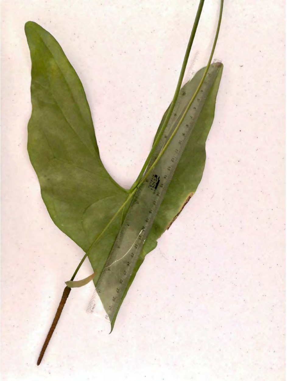
Figure 16. Anthurium diabloense Vannini, Croat & Cast. Mont. Flattened leaf with inflorescence.