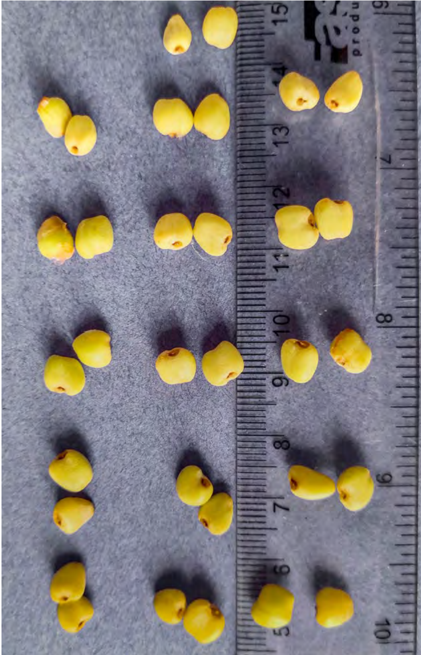
Figure 15. Anthurium diabloense Vannini, Croat & Cast. Mont. Seeds.