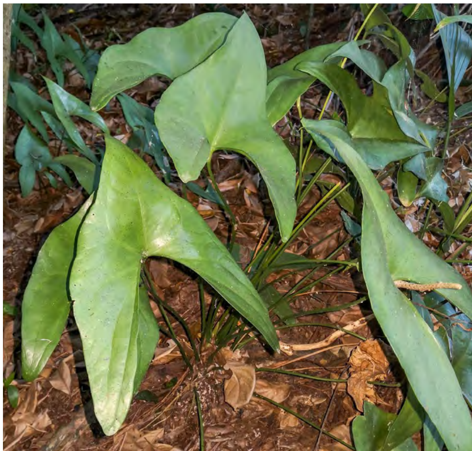
Figure 10. Anthurium diabloense Vannini, Croat & Cast. Mont. Plant in habitat.