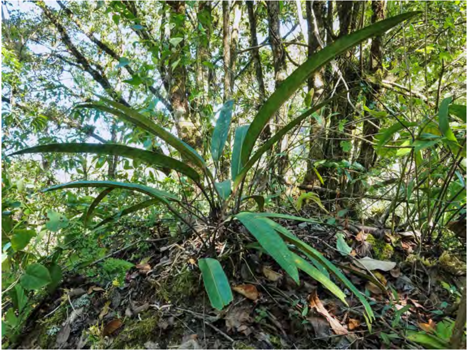
Figure 29. Anthurium ixtenamense Croat, Vannini & Cast. Mont. Habit.