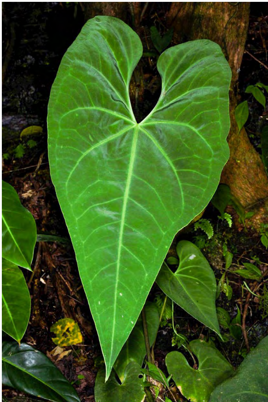
Figure 18. Anthurium fredmulleri Vannini, Croat & Cast. Mont. Adult leaf blade, adaxial surface.