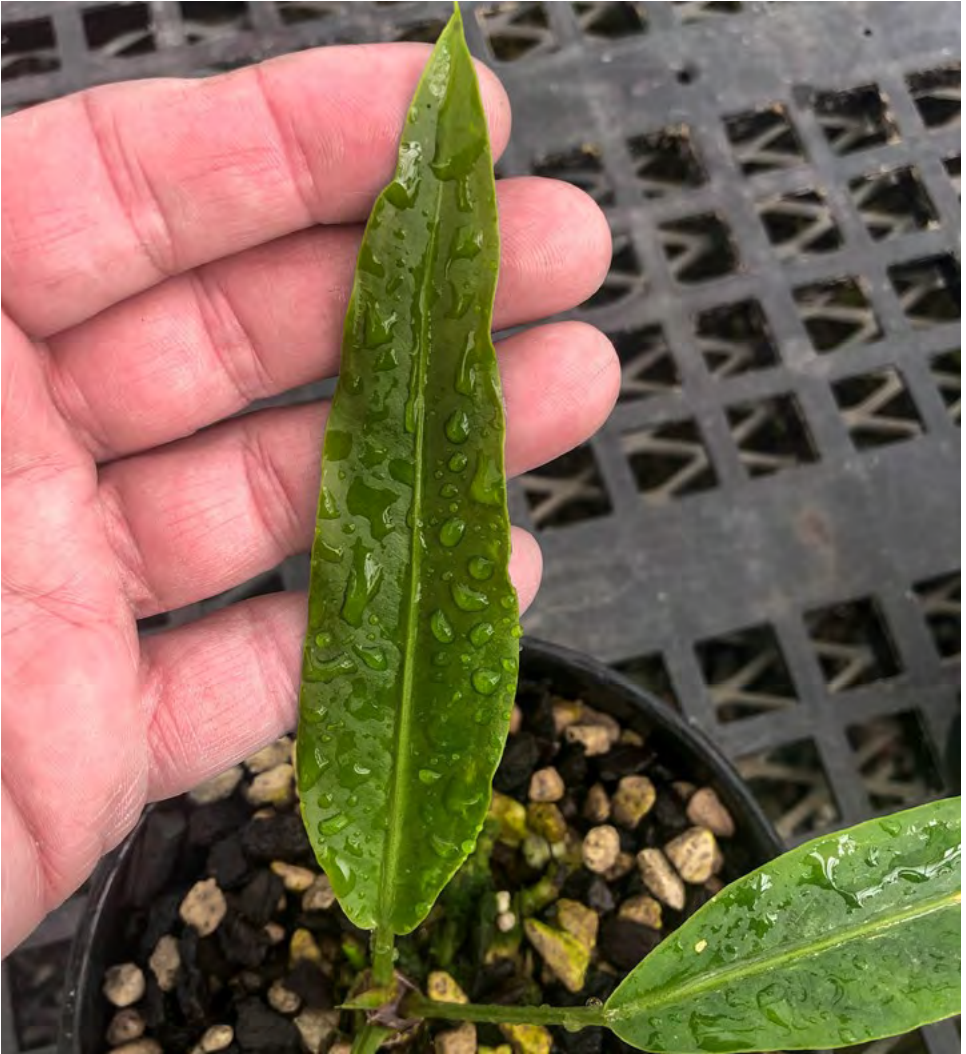
Figure 5. Anthurium breedlovei Vannini & Fred Mull. Stems and petioles.