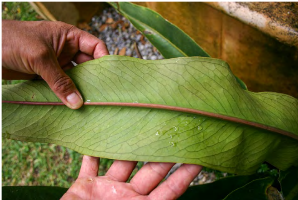
Figure 33. Anthurium ixtenamense Croat, Vannini & Cast. Mont. Abaxial leaf surface.