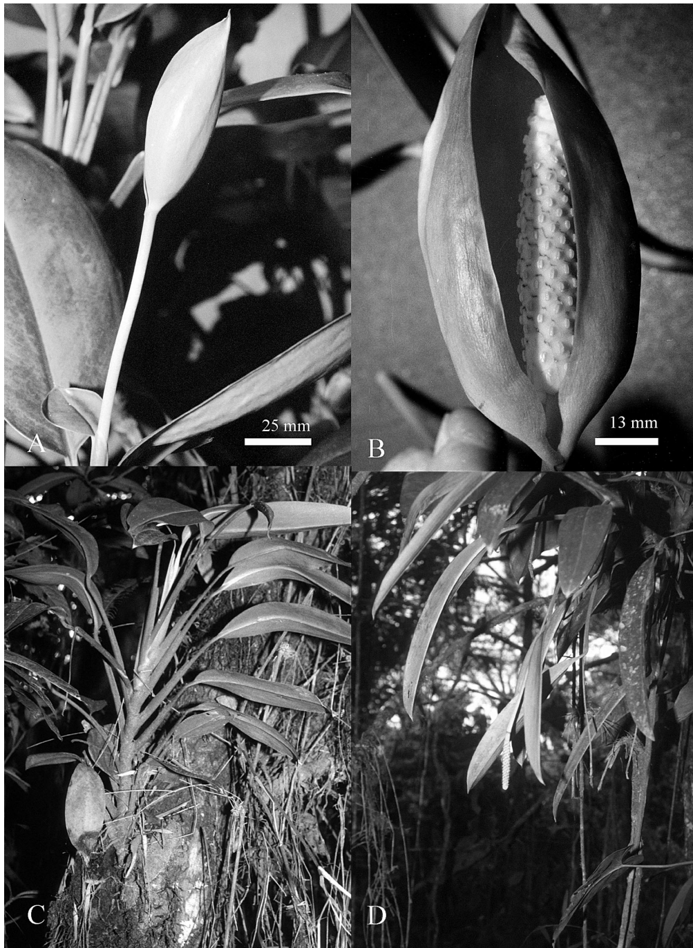
Figure 7. A, B. Stenospermatum killipii Croat & A. Gomez ( Plowman & Schunke 7402 ). —A. Erect inflorescence showing straight peduncle and elliptic spathe. —B. Close-up of inflorescence with open spathe exposing spadix. C, D. Stenospermatum dictyoneurum Croat & Acebey ( Croat et al. 84270 ). Habit.