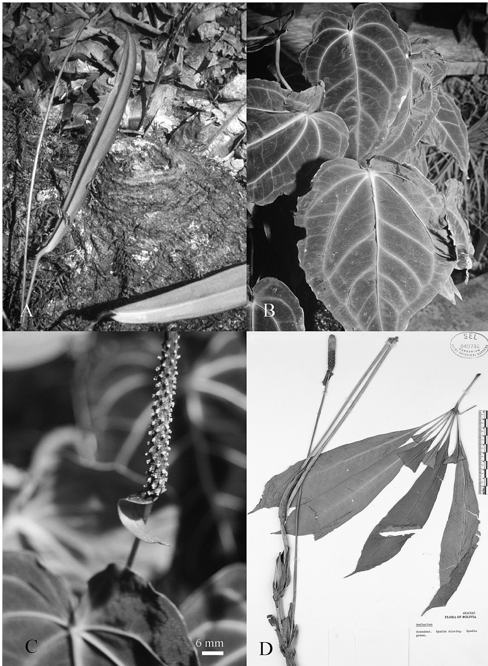
Figure 2. —A. Anthurium beckii Croat & Acebey (Croat et al. 84387). Habit. B, C. Anthurium besseae Croat (Croat 71836). —B. Habit. —C. Close-up of leaf and inflorescence. —D. Anthurium kunthii var. cylindricum Croat (Besse et al. 1790). Herbarium specimen.