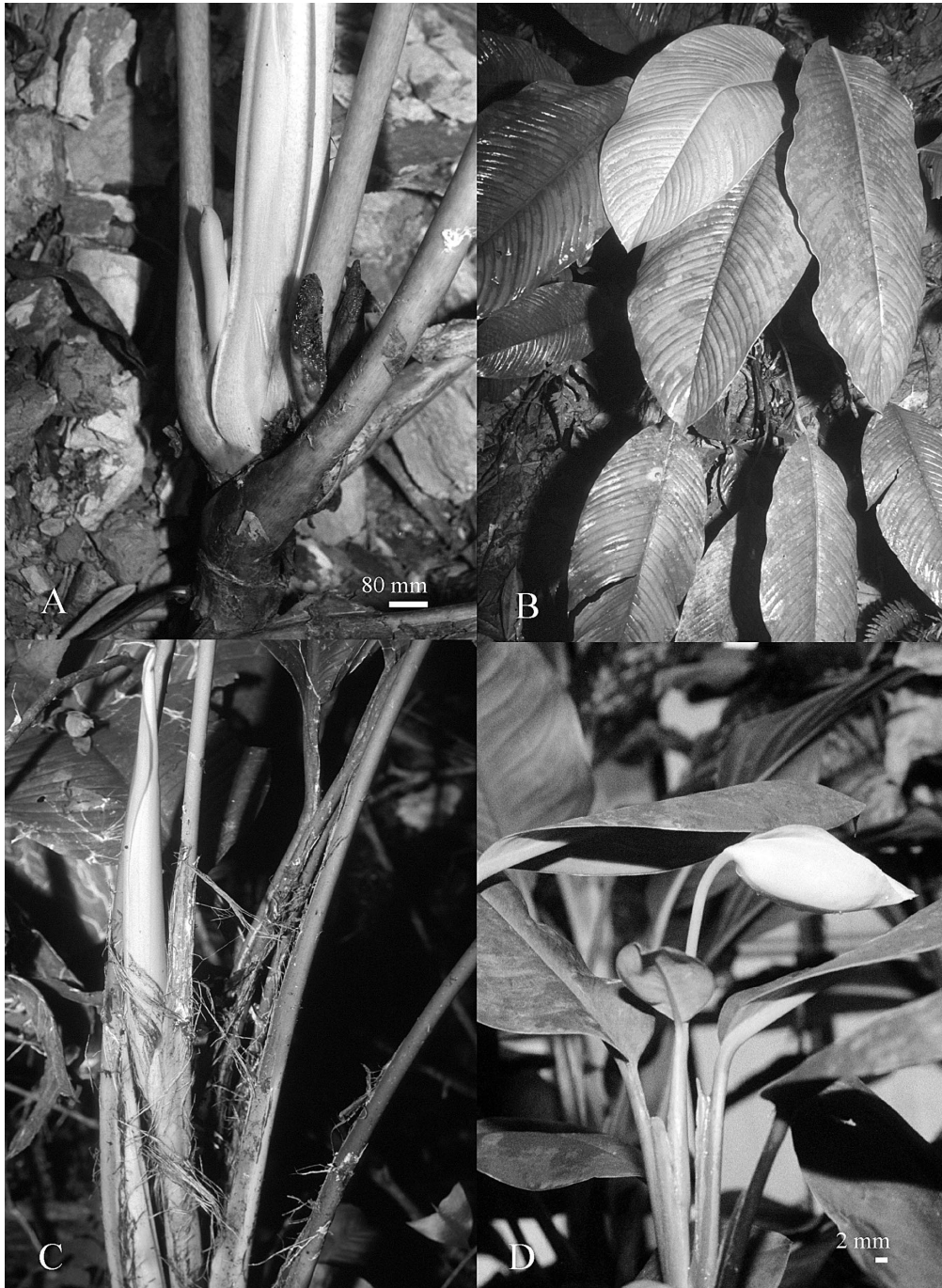
Figure 6. —A. Philodendron kroemeri Croat & Acebey (Croat & Acebey 84820). Close-up of stem, petiole bases, and inflorescences. B, C. Rhodospatha mukuntakia Croat (Croat et al. 84386). —B. Habit. —C. Close-up of petioles with fibrous sheath and an unopened inflorescence. —D. Stenospermation killipii Croat & A. Gomez (Plowman & Schunke 7402). Potted plant showing erect habit with somewhat cernuous inflorescence.