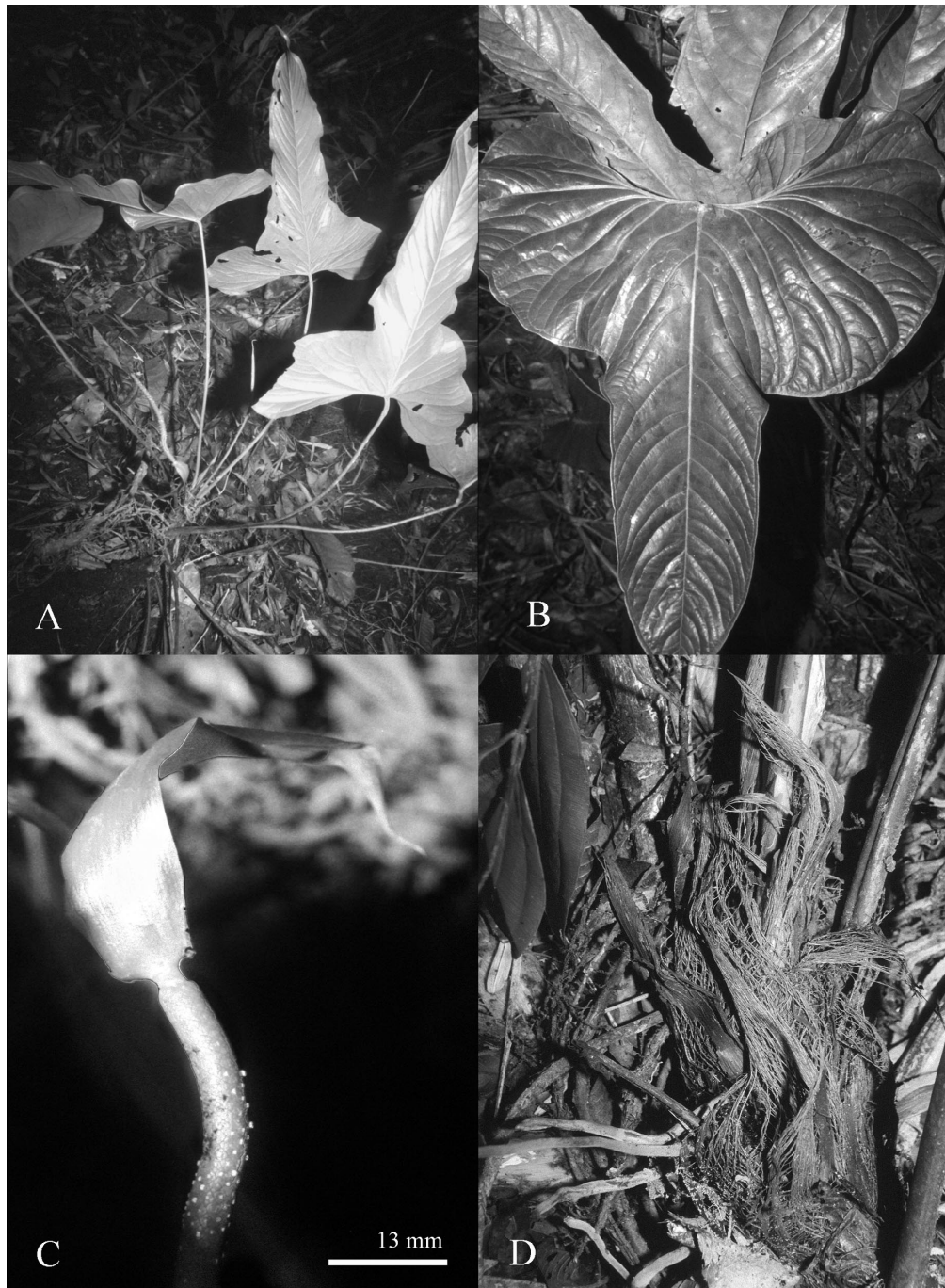
Figure 1. A–D. Anthurium acebeyae Croat ( Croat et al. 84274). —A. Habit. —B. Leaf blade adaxial surface. —C. Close-up of inflorescence. —D. Stem with cataphylls and petiole bases.