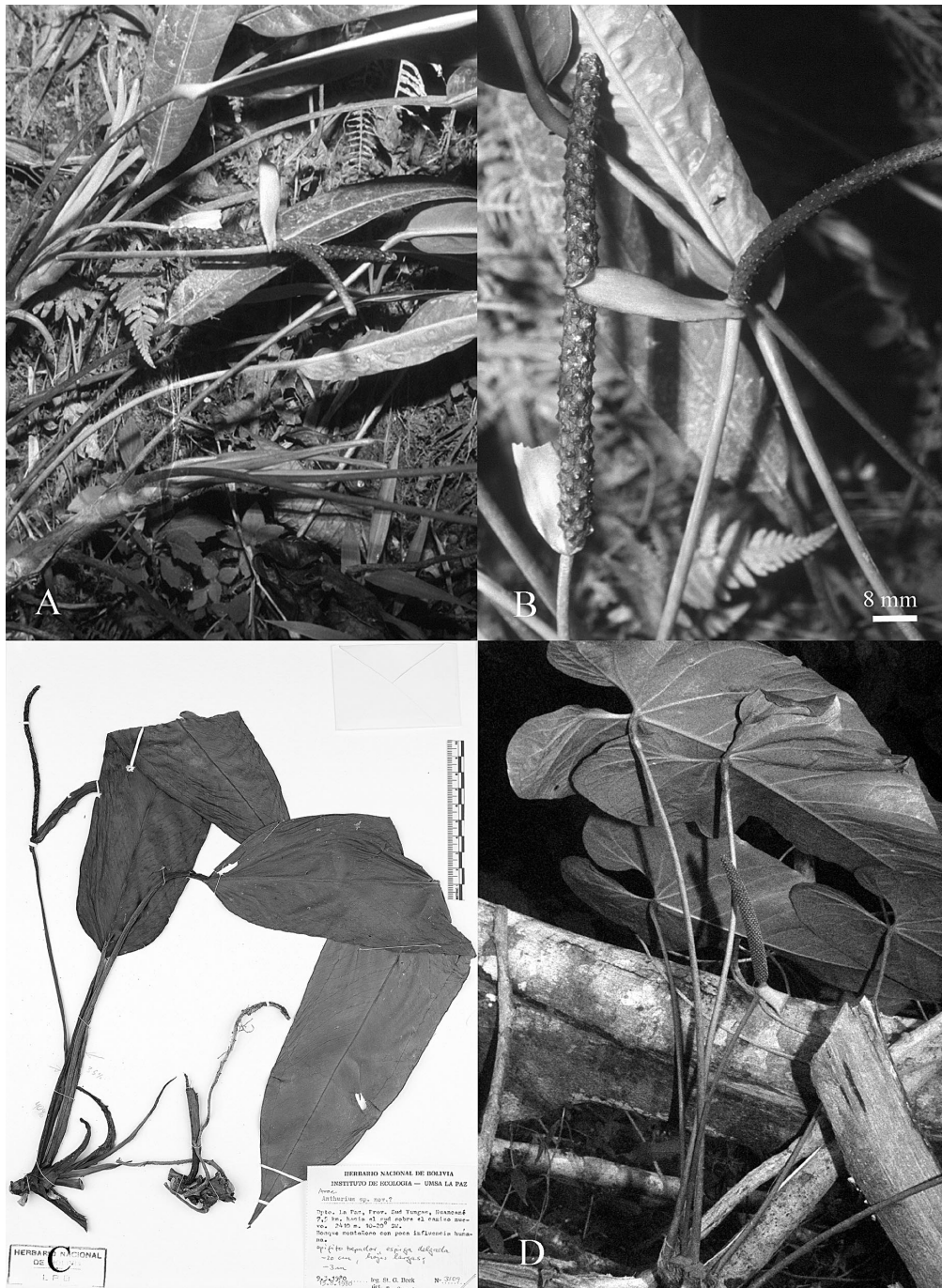
Figure 3. A, B. Anthurium ottobuchtienii Croat & Acebey (Croat et al. 84733). —A. Habit. —B. Close-up showing inflorescence at anthesis and young infructescence. —C. Anthurium stephanii Croat & Acebey (Beck 3109). Herbarium specimen. —D. Anthurium yungasense Croat & Acebey (Croat et al. 84264). Habit.