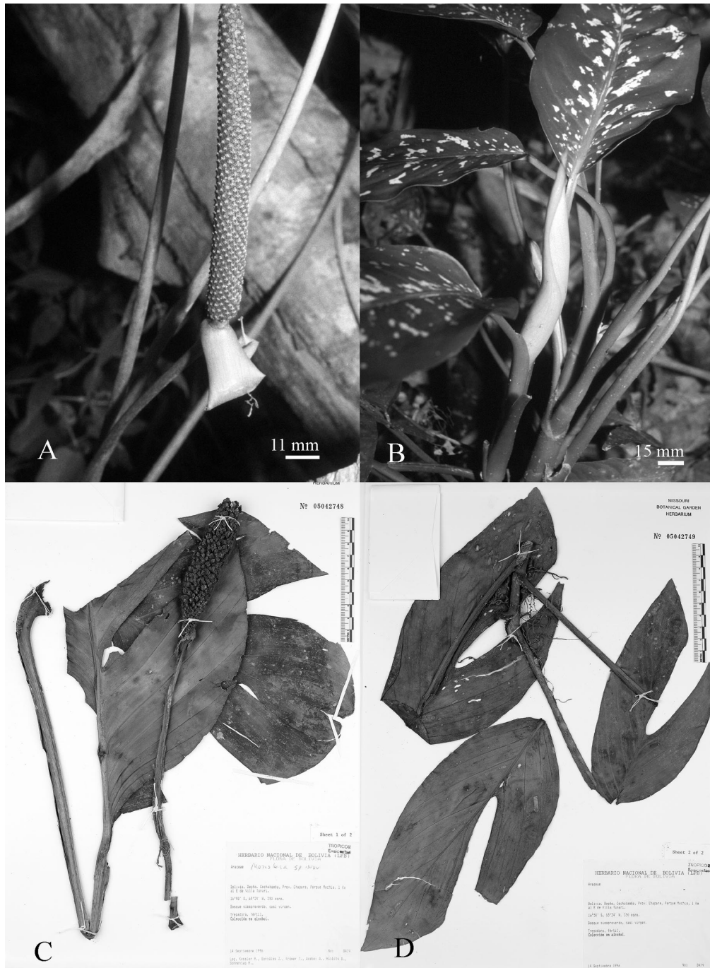
Figure 4. —A. Anthurium yungasense Croat & Acebey (Croat & Acebey 84264). Close-up of inflorescence. —B. Dieffenbachia williamsii Croat (Croat et al. 84385). Side view of whole plant showing stem, leaf, and inflorescence. C, D. Monstera kessleri Croat (Kessler 8479). —C. Type specimen with adult leaves, sheet 1. —D. Type specimen with pre-adult leaves, sheet 2.