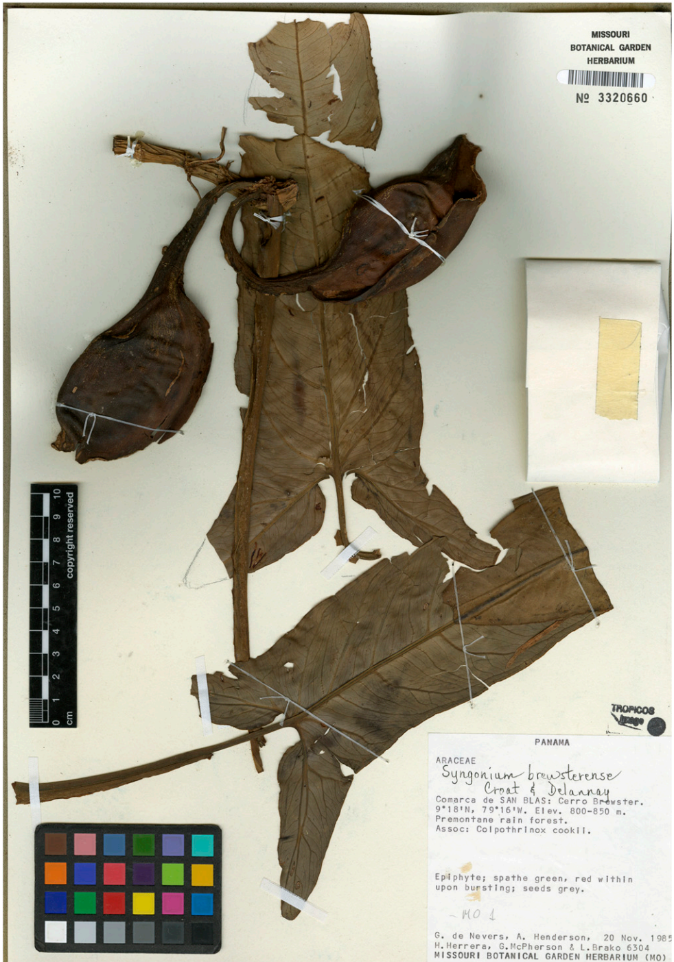
Figure 20. Syngonium brewsterense Croat & Delannay (de Nevers et al. 6304, MO-3320660). Herbarium specimen showing stem, petioles, leaf blades, mostly abaxial surface with adaxial surface folded at the tip, and infructescences.

Etymology. The species is named for the type locality in the Parque Nacional Bastimento in Bocas del Toro Province.