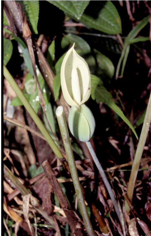
Figure 13. Caladium steudnerifolium Engl. (Croat 87985). Close-up of peduncle and inflorescence with light green spathe tube outside.

The holotype, Lehmann 1704 , now appears to be lost, so a neotype is designated here to serve in its place. There has been confusion regarding the proper spelling of the specific epithet, with both Caladium steudnerifolium and C. steudneriifolium having been used over time. Since the species is named after the genus Stuednera K. Koch and not Stuedneria , the proper spelling is C. steudnerifolium .