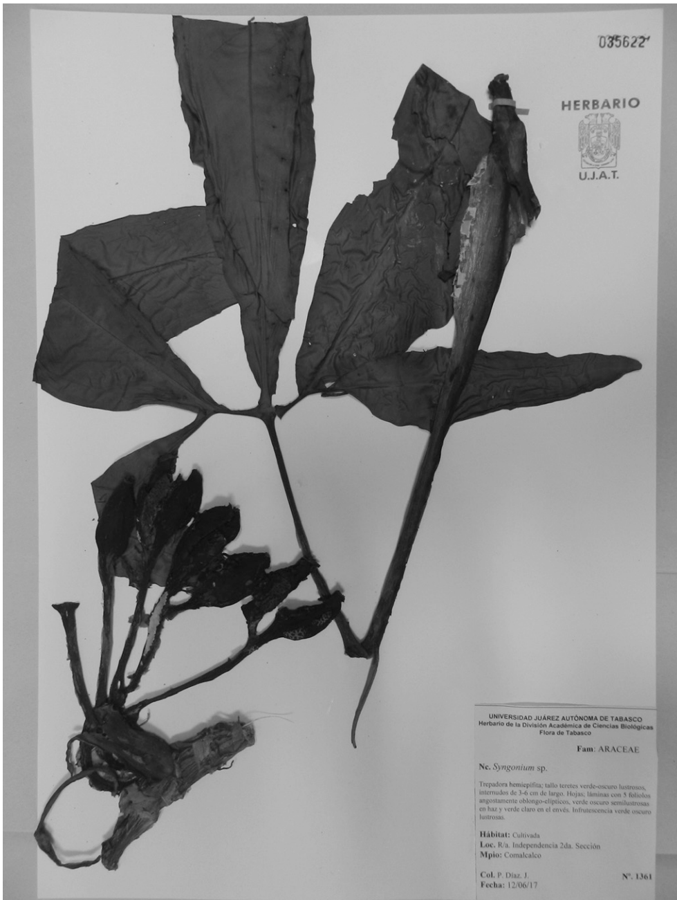
Figure 26. Syngonium tacotalpense Díaz-Jiménez & Croat ( P. Díaz Jiménez 1361 , UJAT). Herbarium specimen showing stem, petiole, leaf blades, mostly adaxial surface with abaxial surface folded under, and infructescences.

ca. 38 km NE of Babahoya, 01°39'S, 79°22'W, 200–400 m, 18 May 1994, B. Ståhl & J. Knudsen 1042 (S). Pichincha [Tsáchilas] : Bosque Protectora “Las Perlas,” along Río Cucharacha, vic. of Km. 40 on Sta. Domingo–Esmeraldas Hwy., ca. 3 km S of Concordia, 00°00'09"S, 79°22'53"W, 300 m, 27 June 1998, T. B. Croat et al. 82118 (MO, QCNE).