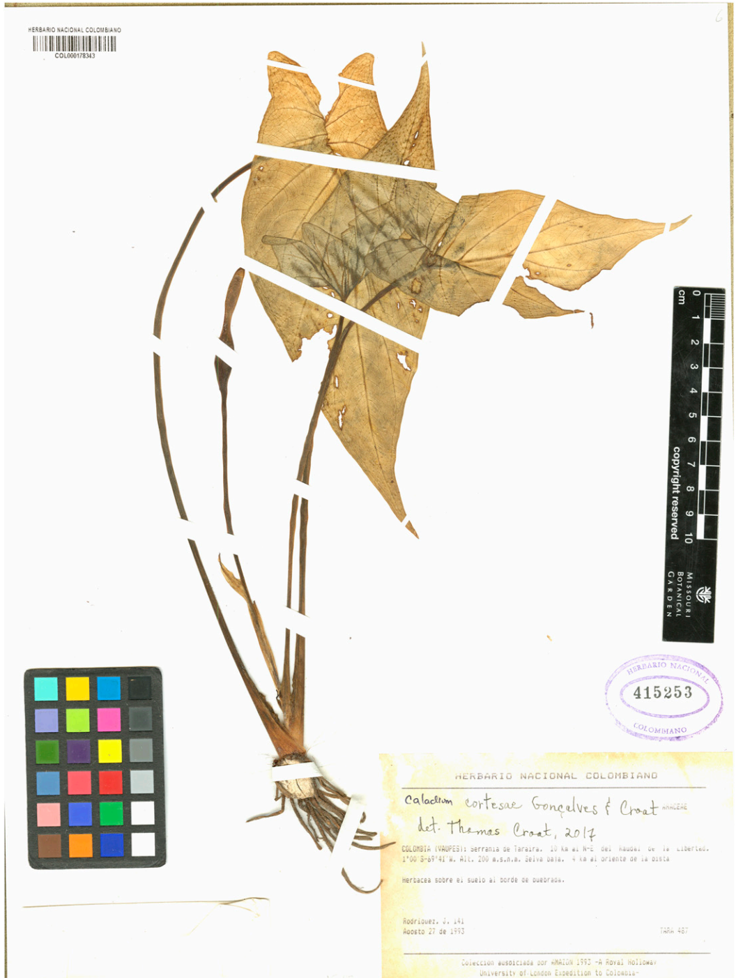
Figure 1. Caladium cortesiae Croat & E. G. Gonç. (Rodríguez 141, COL-415253). Herbarium specimen showing tuberos stem, roots, petioles, leaf blades, mostly adaxial surface with abaxial surface on folded posterior lobes, and inflorescence.

surface. LEAVES 1 to 5, erect to erect-spreading; petioles 35–57 cm, 2–4 mm diam., glabrous, semi-glossy, medium green, weakly to moderately darker