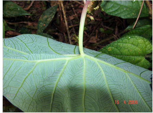
Figure 12. Caladium steudnerifolium Engl. (Croatt 97098). View of leaf blade, abaxial surface.

bosque húmedo del Río Cataniapo entre cominidad de las Pavas y Puente Cataniapo, 06°25'N, 67°25'W, 35 m, 14 Apr. 1987, A. Castillo 2383 (MO); along rd. betw. Puerto Ayacucho & Sanariapo, ca. 1 km S of airport rd. near Río Cataniapo & around huge boulders (granitic lajas), 100 m, 14 Aug. 1982, T. B. Croat 55069 (MO). Apure: Hato "El Polver," 79 km S of Elorza, sabanas de banco adyacentes al caño Cicuture (Afluente del alto Río Cinaruco), 06°38'N, 69°37'W, 80 m, 28 Apr. 1987, G. Aymard et al. 5655 (MO); Dito. Romulo Gallegos, 21 Nov. 1990, G. de Martino 206a (MO); zona húmeda bajios y lagunas, creciendo en el suelo, La Cochina-La Morita, Hato El Frio, llanos Inundables de Apure, 07°43'02"N, 68°54'33"W, 25 June 1997, A. Rial 39 (CAR, MO). Bolívar: vic. of Icabarú, S side of Río Icabarú along rd. to Los Caribes, disturbed area, 04°19'N, 61°44'W, 600 m, 25 July 1982, T. B. Croat 54080 (CM, MO).