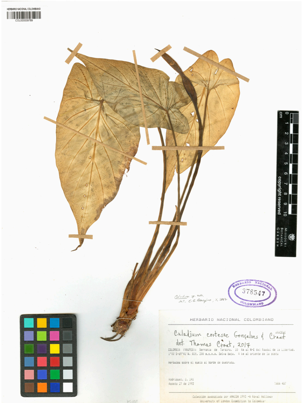
Figure 2. Caladium cortese Croat & E. G. Gonç. (Rodríguez 141, COL-378547). Herbarium specimen showing tuberous stem, roots, petioles, leaf blades, abaxial surfaces, and inflorescence.

weakly obtusely C-shaped; blades narrowly ovate-elliptic, peltate, with petiole attached 2–3.5 cm from base, weakly acuminate at apex, broadest below middle,