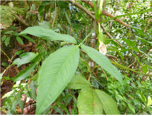
Figure 18. Syngonium bastimentoense O. Ortiz & Croat (Ortiz et al. 1719). Live plant showing stem, petiole, leaf blade, adaxial surface, and inflorescence.