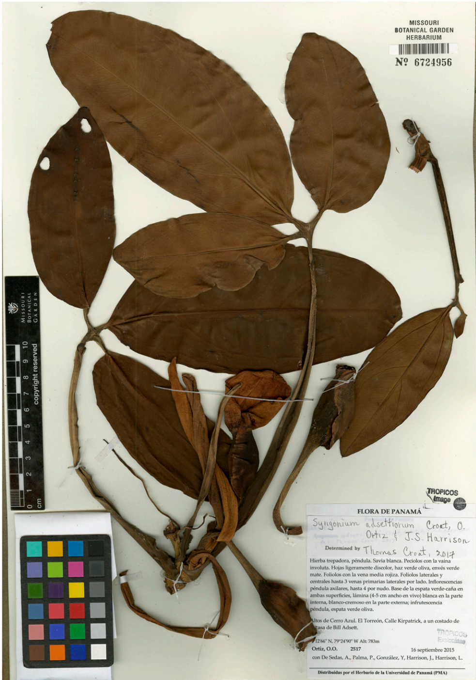
Figure 15. Syngonium adsettiorum Croat, O. Ortiz & J. S. Harrison (Ortiz et al. 2517, MO-6724956). Herbarium specimen showing stem, petioles, leaf blades, adaxial and abaxial surfaces, and infructescence.

Discussion. Caladium stevensonii is characterized by its tuberous stems, short internodes, moderately long-petiolate leaves, terete petioles, broadly ovate-cordate, grayish green-drying blades obtuse at apex with a thin