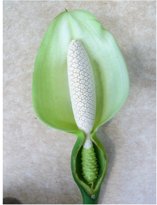
Figure 28. Syngonium tacotalpense Díaz-Jiménez & Croat (P. Díaz Jiménez 1361). Close-up of opened inflorescence showing spathe tube, green on both surfaces, greenish spathe blade, green pistillate spadix, and white sterile and fertile staminate spadix.

Epiphytic to epipetric; internodes short, to ca. 1 cm diam., thicker than broad toward apex, drying closely and sharply ribbed, yellow-brown, uppermost nodes minutely and irregularly ridged. LEAVES with petioles 14–24 cm, sheathed to within 1.5–3.5 cm from base of blade; sheath spreading, 1.8–2 cm wide midway, free-ending at apex, weakly undulate along margins, free portion subterete, drying closely and minute acute-ridged; blades trisect; medial segment ovate, 14.3–20.3 × 6.9–11.7 cm, 1.6–2.1 times longer than wide, slightly inequilateral, one side 6–10 mm wider, acute to narrowly rounded and short-apiculate at apex, rounded to rounded-truncate at base, scarcely to not at all confluent onto lateral segments; lateral segments much smaller, 7.7–12.2 cm long, 2.7–4.9 cm wide, directed at a 115°–155° angle from midrib, oblong to oblong-elliptic, slightly inequilateral, one side 2–8 mm wider, rounded at apex, inner margin acute and weakly confluent onto medial lobes (confluent portion 1–2 mm wide), outer margin acute to weakly auriculate (but not forming a lobe). INFLORESCENCES one per axil, up to 3 borne in uppermost leaf axils; prophylls 9–13.2 cm, 2-ribbed; peduncle 4–6.5 cm, drying dark brown, 3–6 mm wide; spathe stiffly erect, 13–14.5 × 6 cm