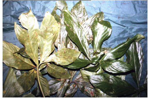
Figure 23. Syngonium litense Croat (Croat et al. 83814). View of leaf blades, adaxial and abaxial surfaces.

Discussion. Syngonium churchillii is a member of section Cordatium Croat and is characterized by its trisect, brownish drying leaves with acuminate leaflets, these attenuated at the base and with the lateral lobes bearing a typically narrow elongate posterior lobe that is parallel to the petiole, and by its up to three inflorescences per axil with the spathe tube maroon inside.