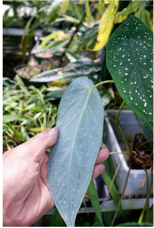
Figure 5. Caladium palaciosii Croat & L. P. Hannon (not collected). View of leaf blades, abaxial and partial adaxial surfaces.

above, light grayish green below; major veins, secondary veins, and collective veins concolorous on upper surface, concolorous or weakly to moderately darker than lower surface; midrib narrowly or broadly obtusely sunken above, round-raised or convex and obtusely angular below; basal veins 3 to 4 (on each side), the first free to the base, the rest coalesced into a prominent posterior rib (one on each side, from petiolar plexus almost to margin at base of blade, arising at 180^\circ , as per midrib; primary lateral veins 2 to 3 pairs, arising at ca. 15^\circ – 30^\circ , occasionally 40^\circ – 45^\circ , straight to weakly arcuate, weakly etched-sunken or obtusely sunken on upper surface, convex and obtusely angular on lower surface; secondary veins entirely or in part weakly etched on upper surface, raised and weakly darker on lower surface; tertiary veins in part visible on lower surface, weakly darker than surface; collective veins 3, arising from base, \pm straight, 3–5 mm from margin, etched-sunken on upper surface, raised on lower surface. INFLORESCENCES 1 to 2 per axil, erect-spreading; peduncle 20.5–22 cm, 3–5 mm diam., slightly more than 1/2 to more than 3/4 as long as petiole, broadest at base, \pm cylindrical, thicker than broad, glossy, medium green, weakly darker purplish-lineate in narrow transverse bands; spathe 5–7.8 cm,