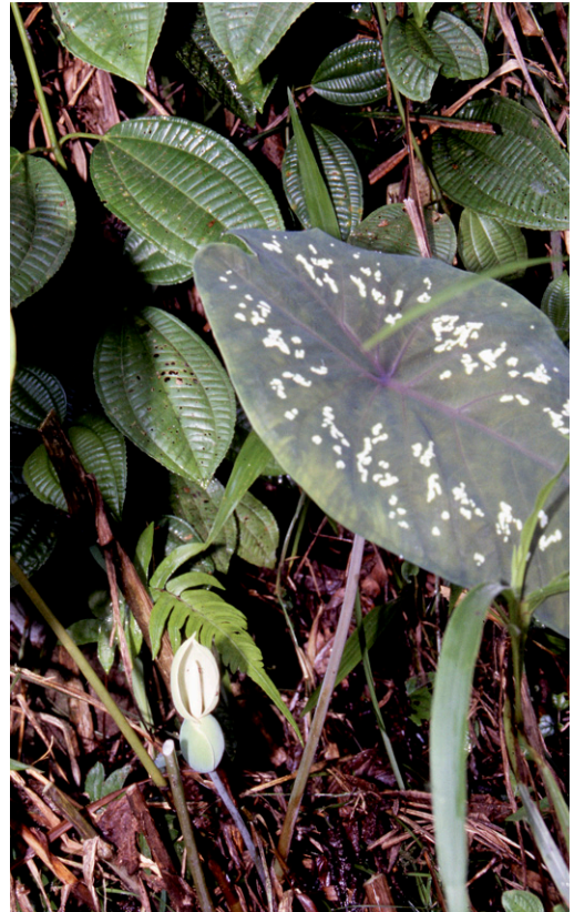
Figure 10. Caladium steudnerifolium Engl. (Croat 87985). Live plant showing petioles, white-maculate leaf blade, adaxial surface, and inflorescence.

Caladium picturatum has not been frequently collected in flower, and no fruiting spadices have been located. In Trinidad, the species has become a weed in cultivated fields (Hans Boos, pers. comm.).