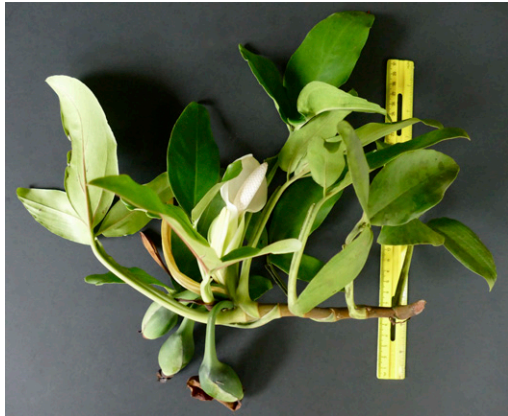
Figure 16. Syngonium adsettiorum Croat, O. Ortiz & J. S. Harrison (Ortiz et al. 2517). Live plant showing stem, petioles, leaf blades, adaxial and abaxial surfaces, one inflorescence, and three infructescences.

peltate leaf blades that dry yellowish brown or yellowish green, as well as inflorescences with much longer peduncles.