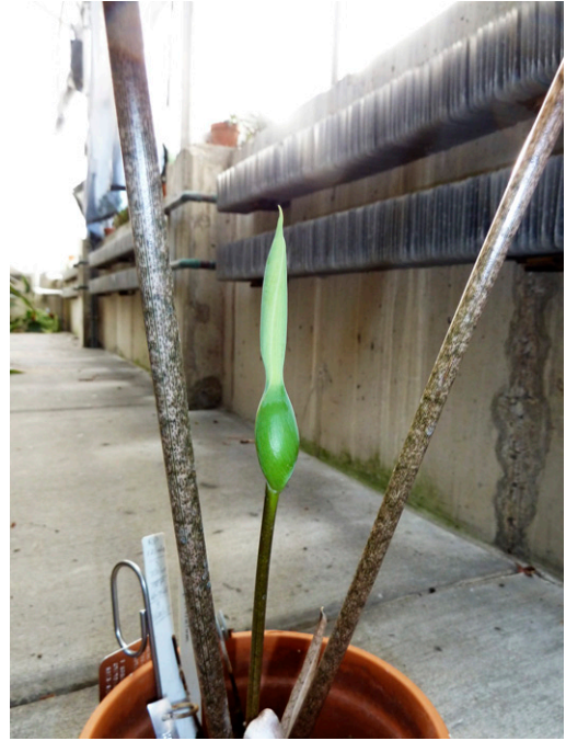
Figure 9. Caladium picturatum K. Koch & C. D. Bouché (Croat 54080b). View of plant base showing purple-maculate petioles and inflorescence with green spathe tube outside.

Paratypes. ECUADOR. Zamora-Chinchipec: Campamento Miazí, along Río Nangaritzá, at base of vertical limestone bluffs, 04°16'S, 78°40'W, 900 m, 17 Feb. 1994, H. van der Werff, B. Gray, E. Freire & M. Tirado 13179 (MO); Cordillera del Cóndor region, along upper Río Nangaritzá betw. Las Orquídeas & Shaime, 04°15'29"S, 78°39'21"W, 900 m, 5 Nov. 2006, H. van der Werff, B. Gray & W. Quizhpe 21938 (F, HUA); Río Nangaritzá, ca. 45 min. upriver, by boat, from end of rd. at Las Orquídeas, at base of cliffs, 1200–2000 m (est.), 04°16'42.5"S, 78°38'55.2"W, 19 Jan. 2004 (originally collected by M. Sizemore 04-001 ), T. B. Croat & L. P. Hannon 90274 (HUA, MO, PMA, QCNE, SEL); cultivated at Munich Botanical Garden, Bogner 3006 (M); Río Nangaritzá up river from Cabañas Yankuam, 04°15'35"S, 78°39'23"W, 852 m, 17 Sep. 2007, T. B. Croat & G. Ferry 98736 (MO); Miazí, Detrás Campamento Militar, 04°16'00"S, 78°42'00"W, 900–1000 m, 21 Oct. 1991, W. Palacios, I. Vargas, C. Galarza & J. Romero 8583 (MO). PERU. Amazonas: Quebrada El Almendro, lowland rainforest, along creek & on sandstone, 05°14'40"S, 78°21'24"W, 430 m, 8 Mar. 1998, H. van der Werff, B. Gray, R. Vásquez & R. Rojas 14532 (MO); Bagua, Dpto. Imaza, comunidad Aguaruna de Wanás (Km. 92 Carretera Bagua–Imacita),