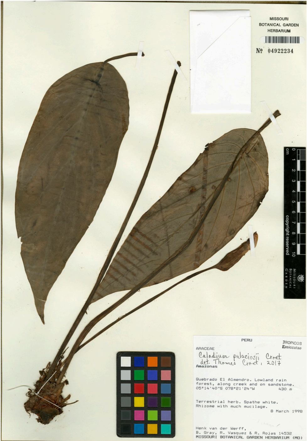
Figure 3. Caladium palaciosii Croat & L. P. Hannon ( van der Werff et al. 14532, MO-4922234). Herbarium specimen showing tuberous stem, petioles, leaf blades, adaxial and abaxial surfaces, and infructescence.

side midway, thinly coriaceous, glabrous, prominently bicolorous; upper surface flat (not quilted), velvety-matte to semiglossy, entirely dark blackish green or