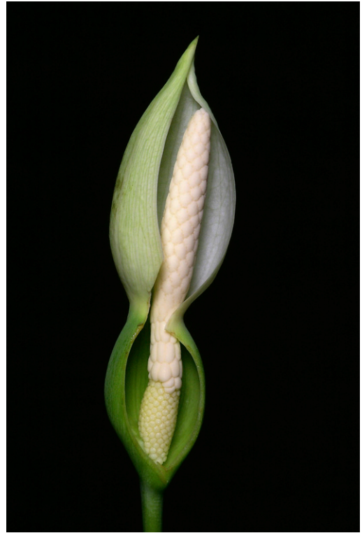
Figure 7. Caladium palaciosii Croat & L. P. Hannon (Croat 90274). Close-up of opened inflorescence with medium green spathe tube inside, pistillate portion of cream-colored spadix, and white sterile and fertile staminate portions.

16 per locule when 1-locular, anatropous, biseriate, attached in basal 2/3 (of axis); funicle as long as ovule; stylar region ca. 0.3 mm, slightly broader than ovary apex, the margins \pm coherent with adjacent styles, free in apical and basal 1 to 2 whorls; stigma whitish, ca. 0.6 mm diam., disklike, wider than long, almost as wide as style; sterile male flowers in 5 whorls, ca. 1 mm, 1–1.2 mm diam. (viewed from above) in basal whorl and weakly to moderately elongated in direction of axis, 2–3 mm, 1–1.5 mm diam. in apical whorls (viewed from above) and prominently elongated in direction of axis, subprismatic to prismatic, densely arranged.