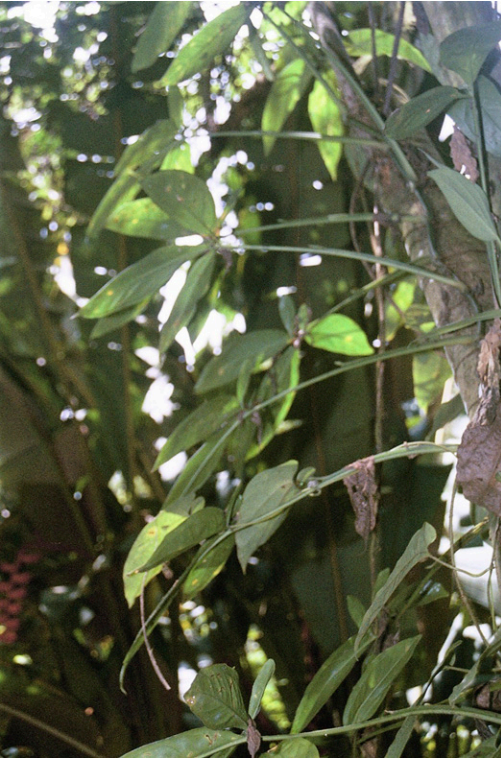
Figure 22. Syngonium litense Croat (Croat et al. 83814). Live plant showing climbing stem, petiole, and leaf blades.

spathe blade absent, tube 5–6 cm; 2.3–3.2 cm diam., green outside, maroon inside, drying dark blackened, matte; spadix with sterile staminate portion ca. 1.5 cm, mostly eaten away. INFRUCTESCENCE to 6 cm, 2.5 cm diam.; seeds 1.5–2 mm, 1.6–1.5 mm diam.