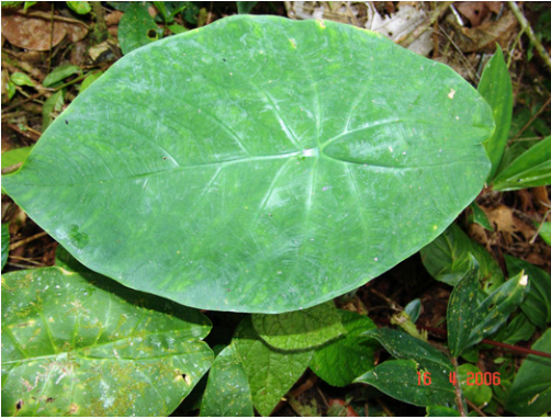
Figure 11. Caladium steudnerifolium Engl. (Croatt 97098). View of non-maculate leaf blade, adaxial surface.