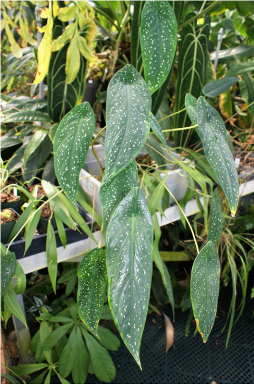
Figure 4. Caladium palaciosii Croat & L. P. Hannon (not collected). Greenhouse-grown plant showing petioles and whitish maculate leaf blades, adaxial surface.