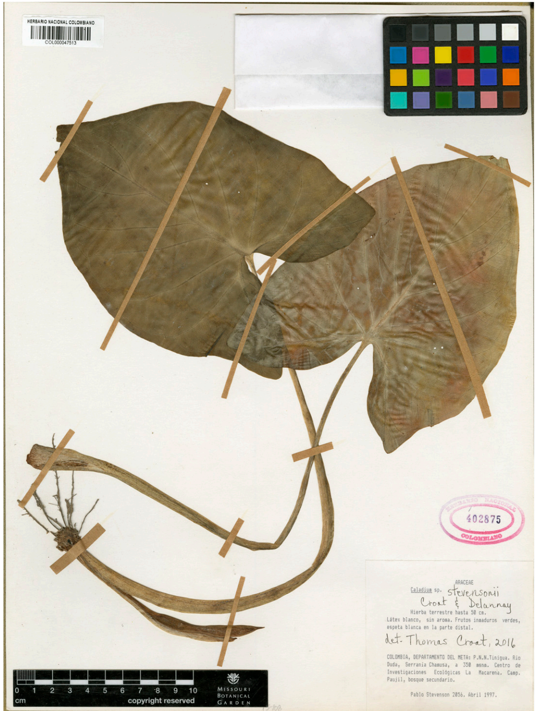
Figure 14. Caladium stevensonii Croat & Delannay (Stevenson 2056; COL-402875). Herbarium specimen showing tuberosus stem, petioles, leaf blades, adaxial and abaxial surfaces, and inflorescence.

Distribution and habitat. Caladium stevensonii is endemic to Colombia in the Meta Department at 350 m in a Tropical wet forest life zone.