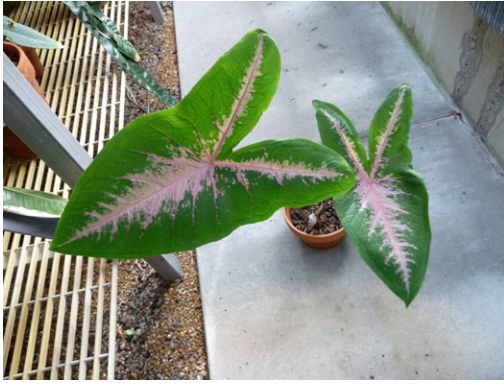
Figure 8. Caladium picturatum K. Koch & C. D. Bouché (Croat 54080b). Greenhouse-grown plant showing leaf blades, adaxial surface.

The subject of tuber versus rhizome has never been fully addressed in the morphology of Araceae, and the stem of Caladium palaciosii , although caulescent in appearance, could be described as an elongate tuber, according to Wilbert Hetterscheid (pers. comm.). However, the species grows continuously throughout the year, exhibiting no seasonal dormancy in habitat or cultivation. This species serves as yet another example of the problems of generic delimitation of Caladium and Xanthosoma , as discussed by Mayo and Bogner (1988). The style is conspicuously thickened and also laterally expanded beyond the diameter of the ovary apex, with the margins coherent with those of the adjacent pistils. This combination of a seemingly rhizomatous stem and discoid style could easily place the species in Xanthosoma sect. Xanthosoma , but C. palaciosii has the pollen shed in monads while the pollen is in tetrads in Xanthosoma , confirming that it should be placed in Caladium .