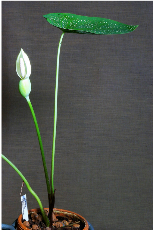
Figure 6. Caladium palaciosii Croat & L. P. Hannon (not collected). View of petiole, leaf blade, adaxial surface, and inflorescence with light green spathe tube outside.