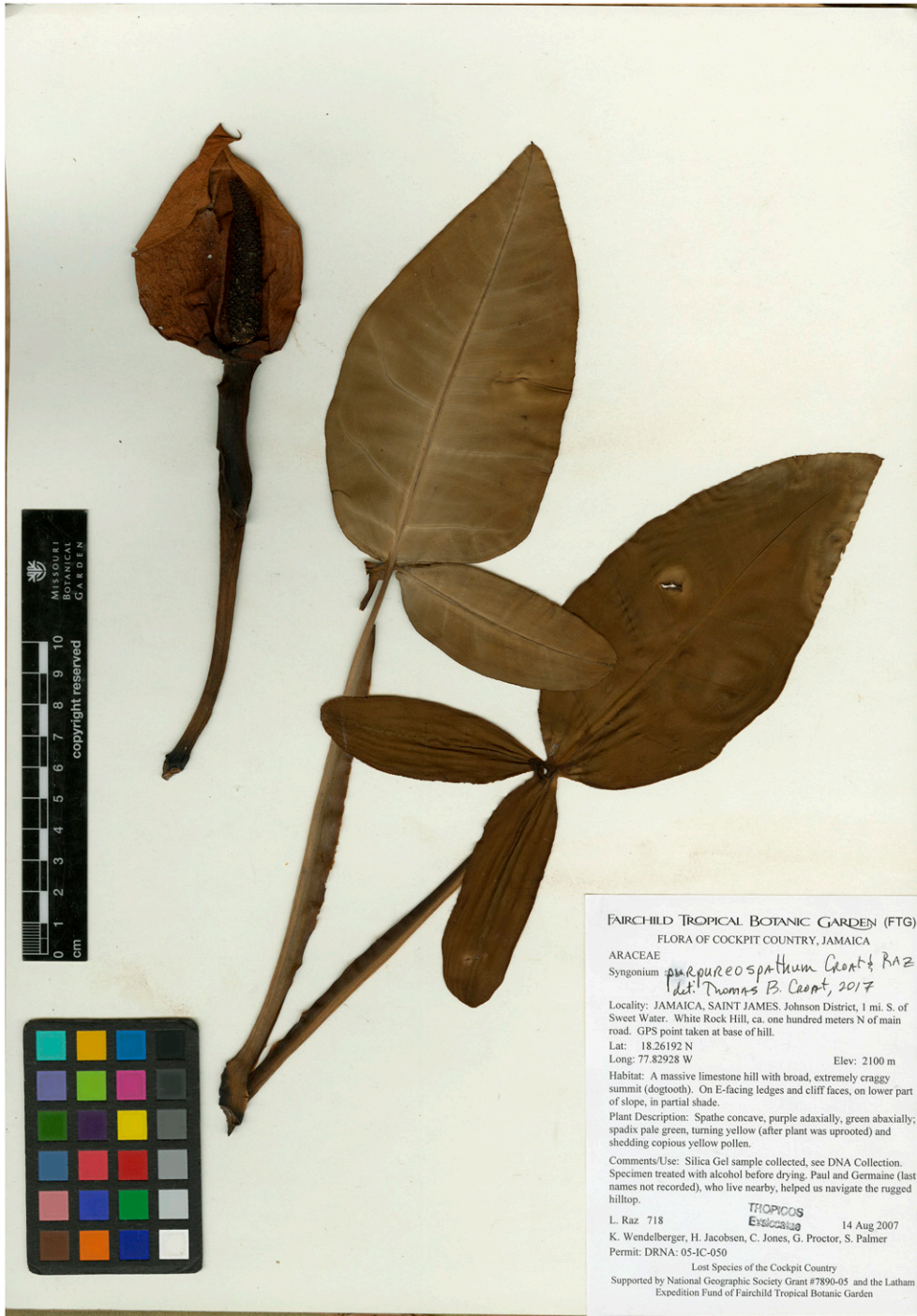
Figure 25. Syngonium purpureospathum Croat & Raz (Raz et al. 718, FTG). Herbarium specimen showing petioles, leaf blades, adaxial and abaxial surfaces, and inflorescence.

S. Lindström 027 (MO); Cerro Samana, SE of Potosí, SW of Caluma, S of Río Pita, vic. of village of Pita, betw. Pita & Escuela 18 de diciembre, 01°38'44"S, 79°19'58"W – 01°39'38"S, 79°39'38"W, 164–400 m, 18 Mar. 2006, T. B.