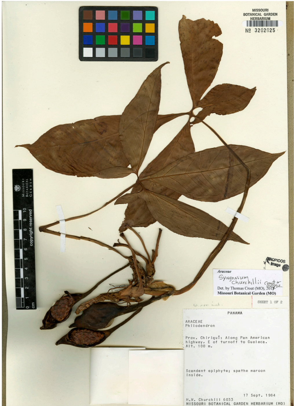
Figure 21. Syngonium churchillii Croat & O. Ortiz (Churchill 6033, MO-3202025). Herbarium specimen showing stem, petioles, leaf blades, adaxial and abaxial surfaces, and infructescences.

concolorous above, drying darker, 5-ribbed below; primary lateral veins 6 to 10 pairs, arising at a 50°–55° angle; primary collective vein 3–6 mm from margin;