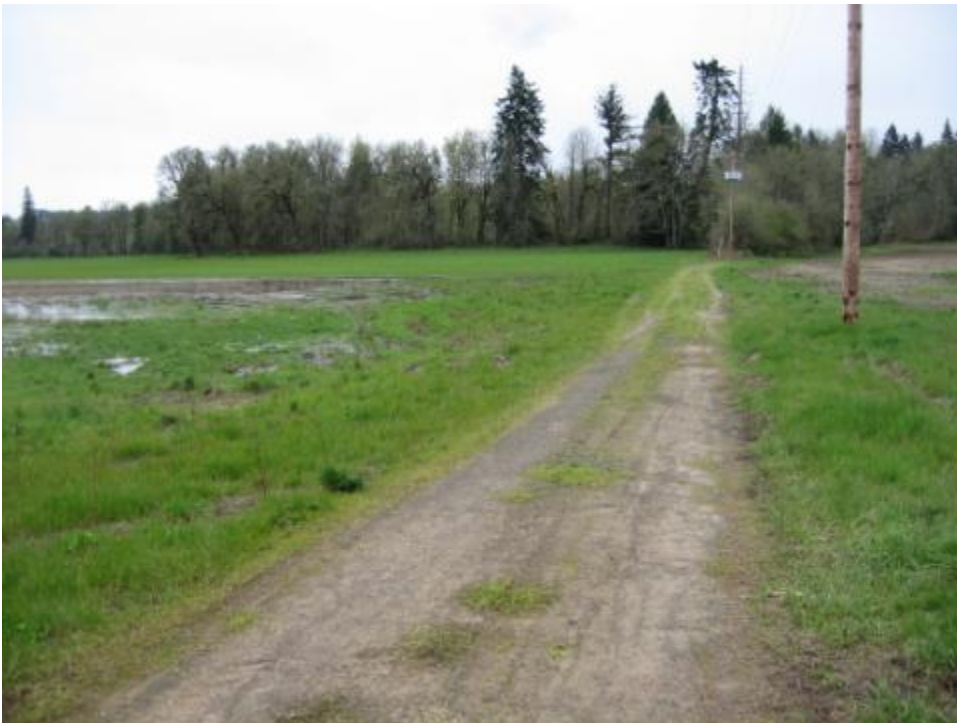
Photo Point 3- 3/2014- After seeding and planting and one growing season.