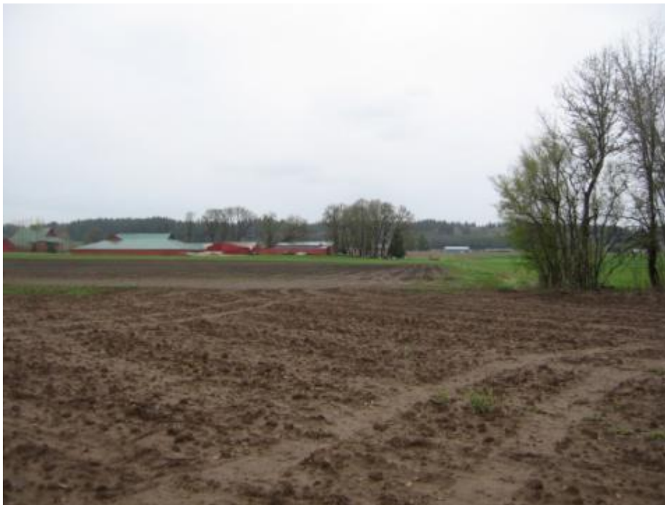
Photo Point 18- 3/2014- Northern portion of east field after clearing of ground and before construction.