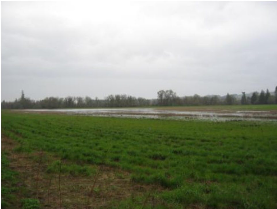
Photo Point 2- 3/2014- After seeding and planting and one growing season.