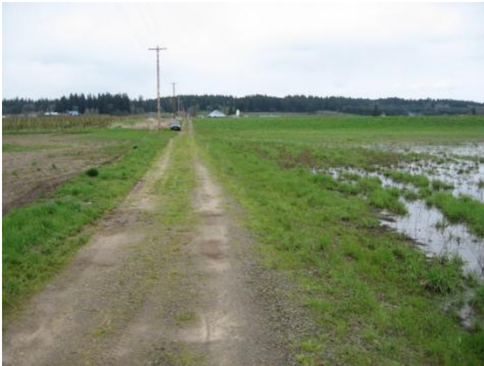
Photo Point 6- 3/2014- After seeding, planting, closure of water control structure and one growing season.