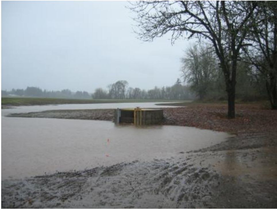
Photo Point 10- 12/2012- After seeding and before planting.