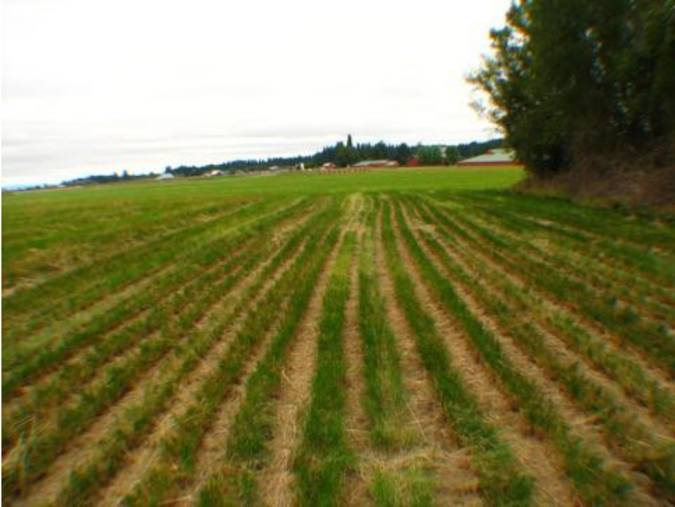
Photo Point 16- 8/2012- East field before initiation of project.