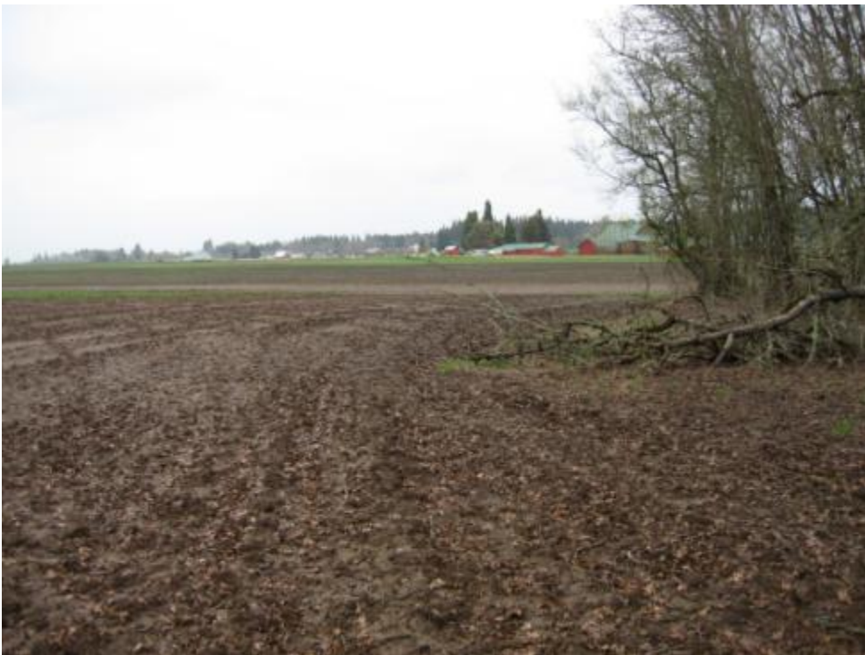
Photo Point 16- 3/2014- East field immediately after planting of woody shrubs.