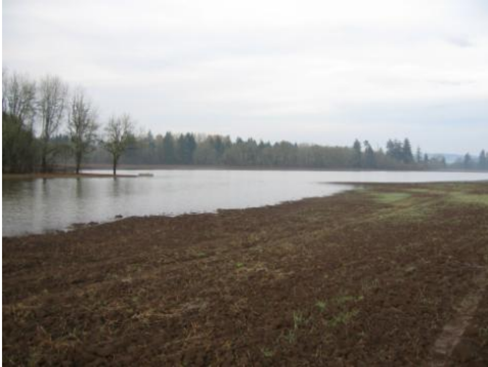
Photo Point 24- 8/2012- Looking towards west field after west field was seeded and water control structure closed.