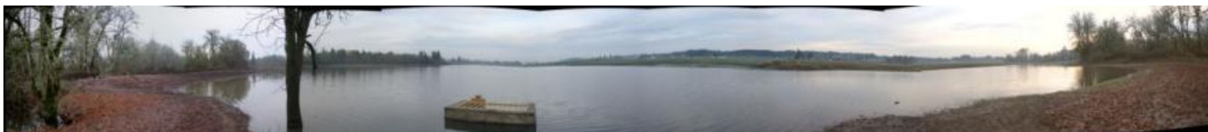
Photo Point 12- 12/2012- After seeding, before planting west field.