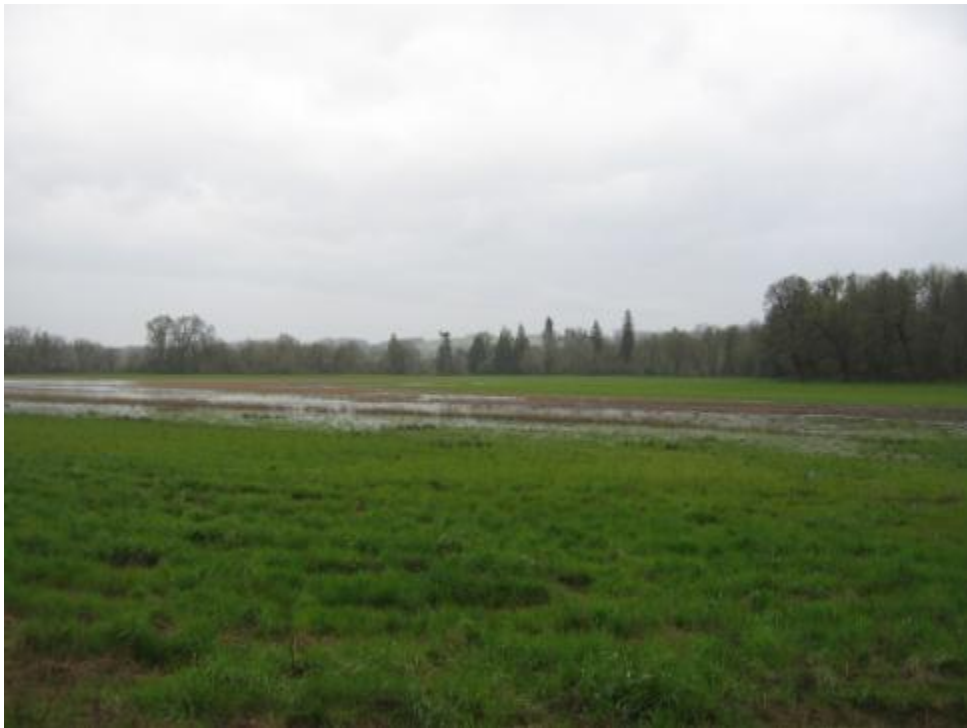
Photo Point 1- 3/2014- After seeding, planting, closure of water control structure and one growing season.