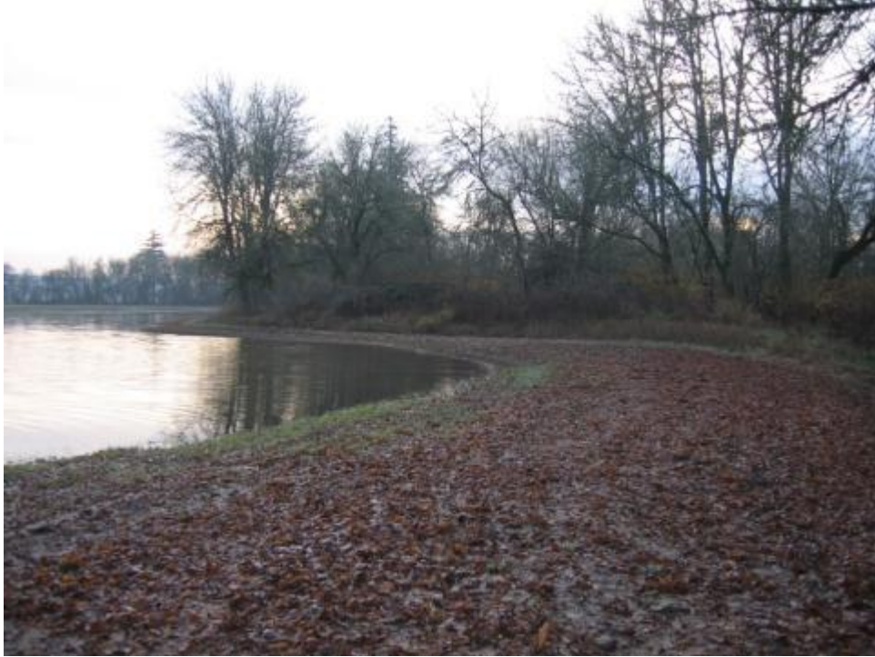
Photo Point 14- 12/2012- Before planting east field.