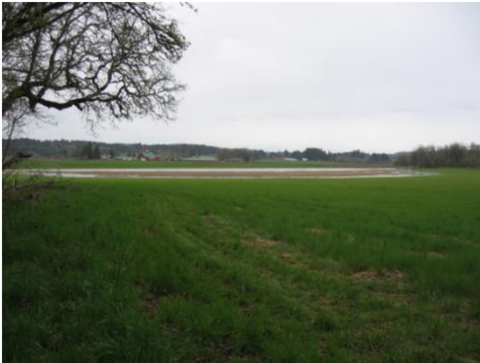
Photo Point 8- 3/2014- After seeding, planting and one growing season.