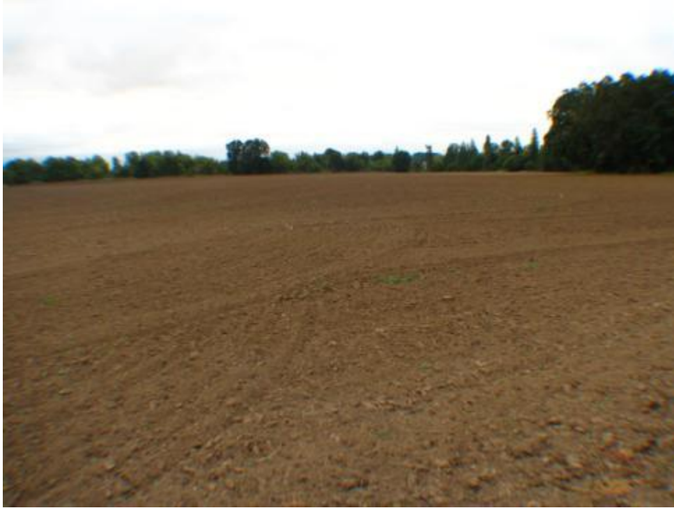
Photo Point 1- 9/2012 Before seeding, planting, and closure of water control structure