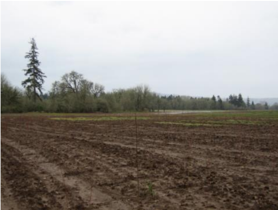
Photo Point 17- 3/2014- Southern portion of east field immediately after planting of woody shrubs.