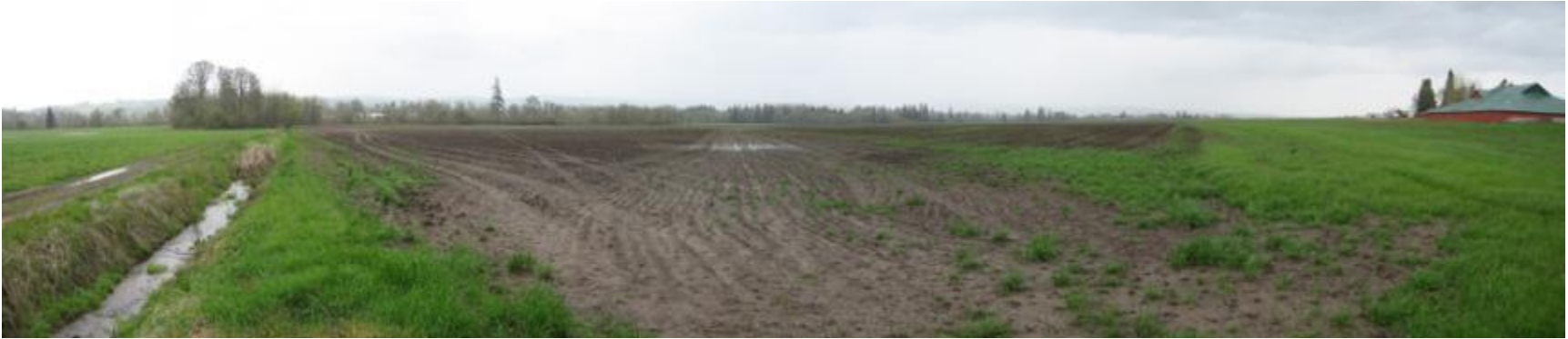
Photo Point 19- 3/2014- Northern portion of east field after clearing of ground and before construction. Photo taken from NE corner.