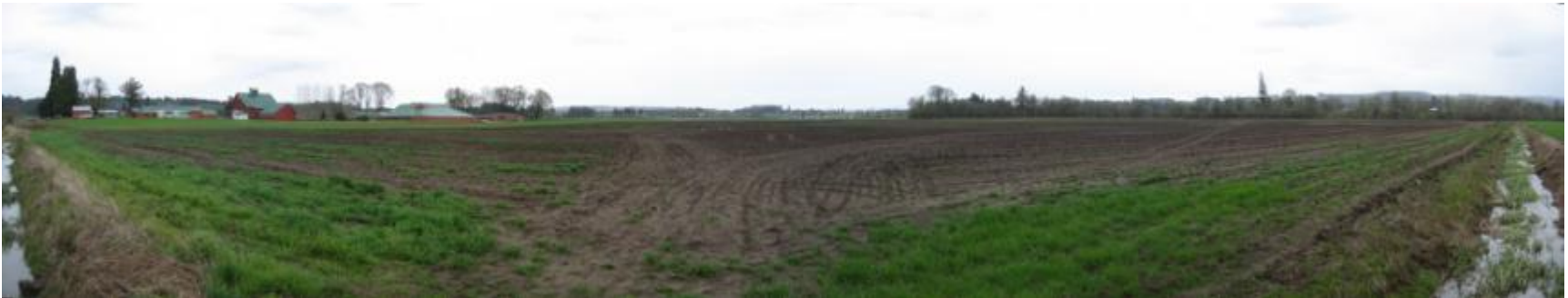
Photo Point 20- 3/2014- Northern portion of east field after clearing of ground and before construction. Photo taken from NW corner of project area.