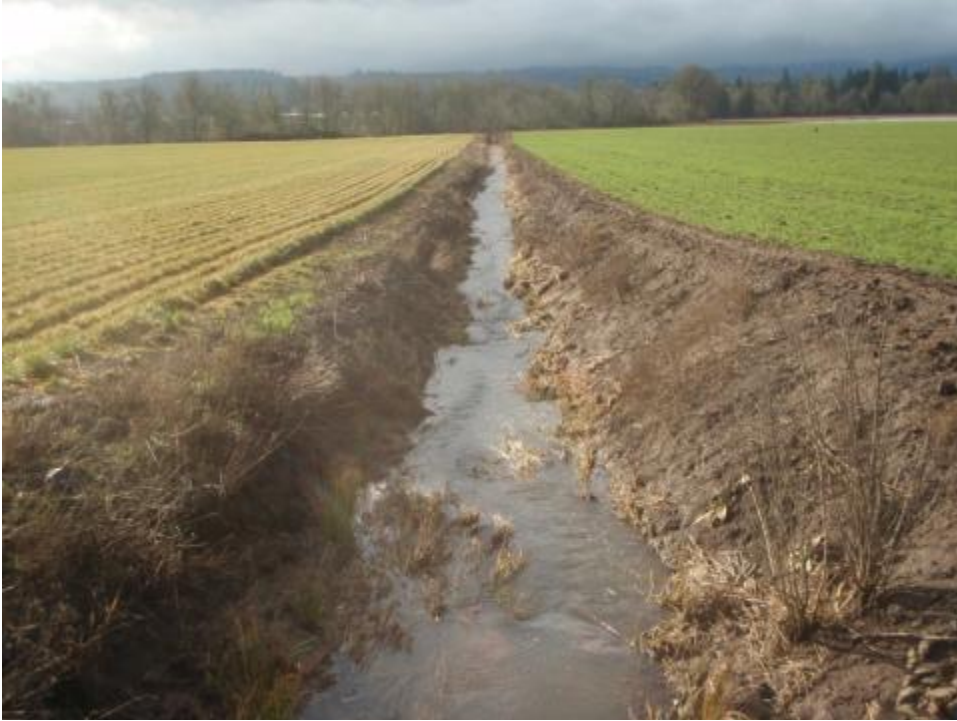
Photo Point 21- 8/2012- Northern portion of east field before initiation of project. Photo taken from culvert.