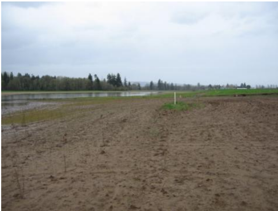
Photo Point 25- 3/2014- Looking towards west field after west field was seeded, both fields planted.