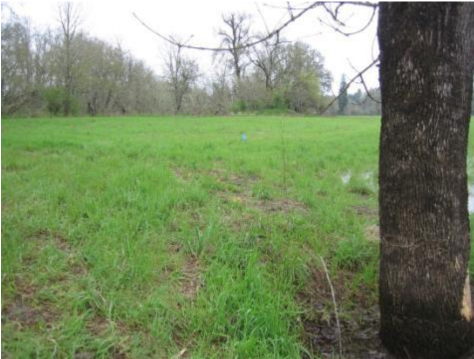
Photo Point 15- 3/2014- After seeding and planting west field and one growing season.