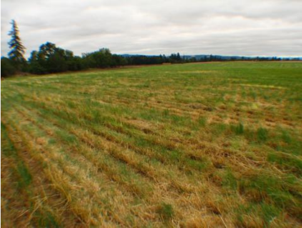
Photo Point 17- 8/2012- Southern portion of east field before initiation of project.