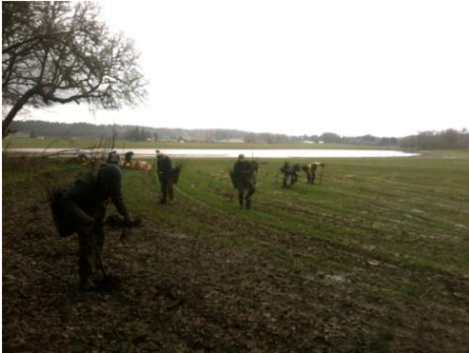
Photo Point 8- 4/2013- After seeding, during planting.