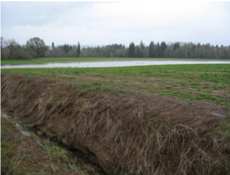
Photo Point 23- 8/2012- West field after seeding and planting. Photo taken from east side of ditch