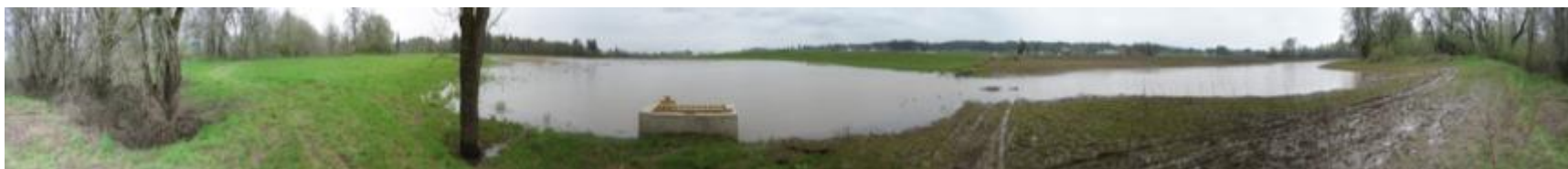
Photo Point 12- 3/2014- After seeding and planting west field and after planting southern part of east field.