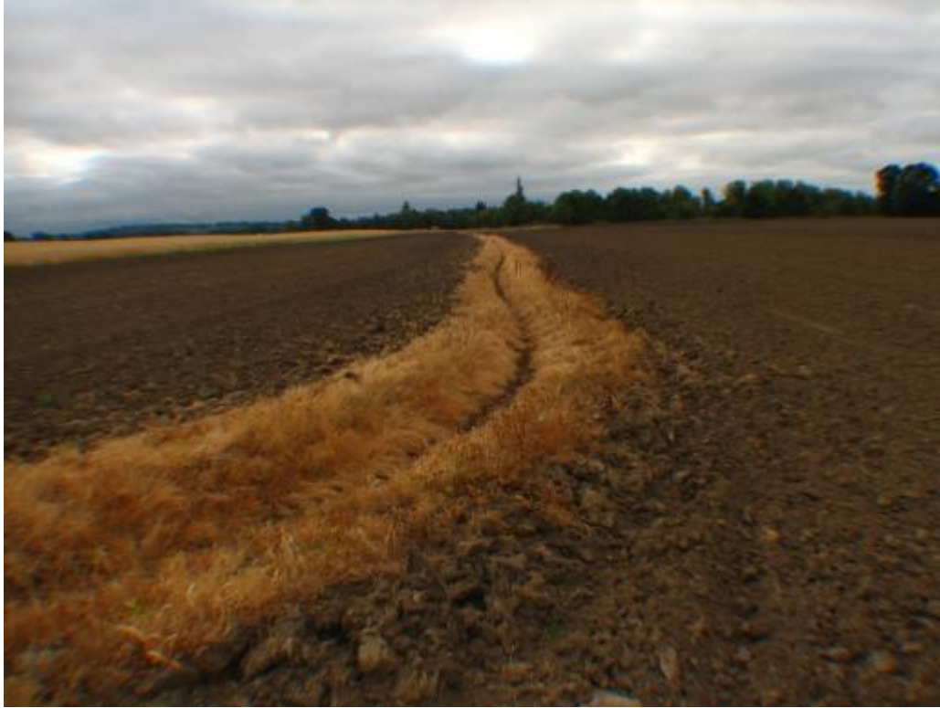
Photo Point 4- 8/2012 Before seeding, planting, and installation of water control structure