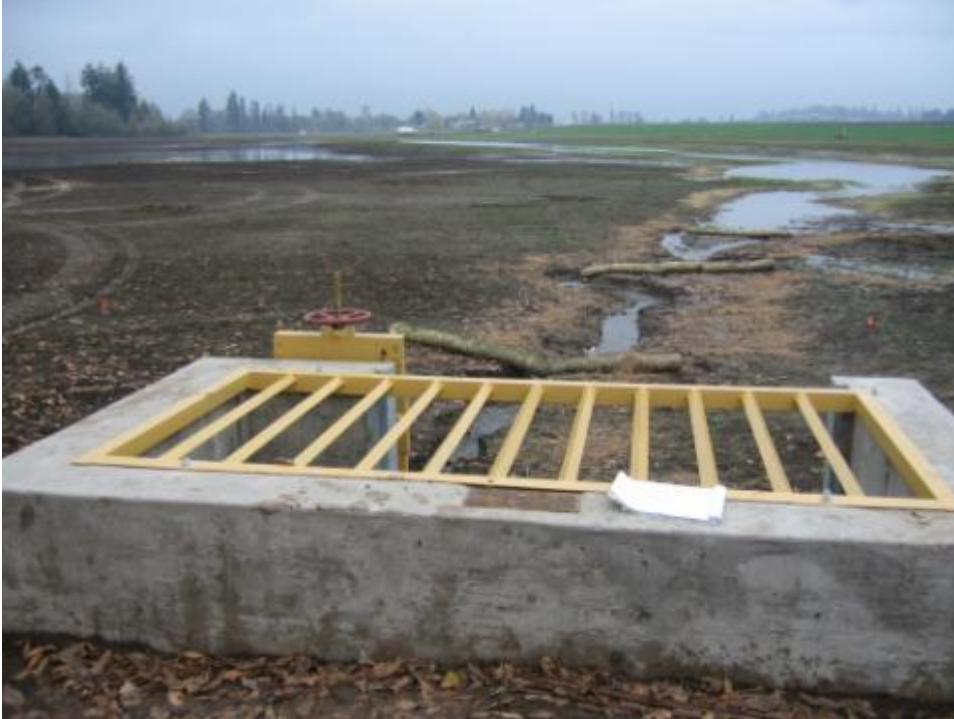
Photo Point 11- 11/2012- After seeding and before planting.