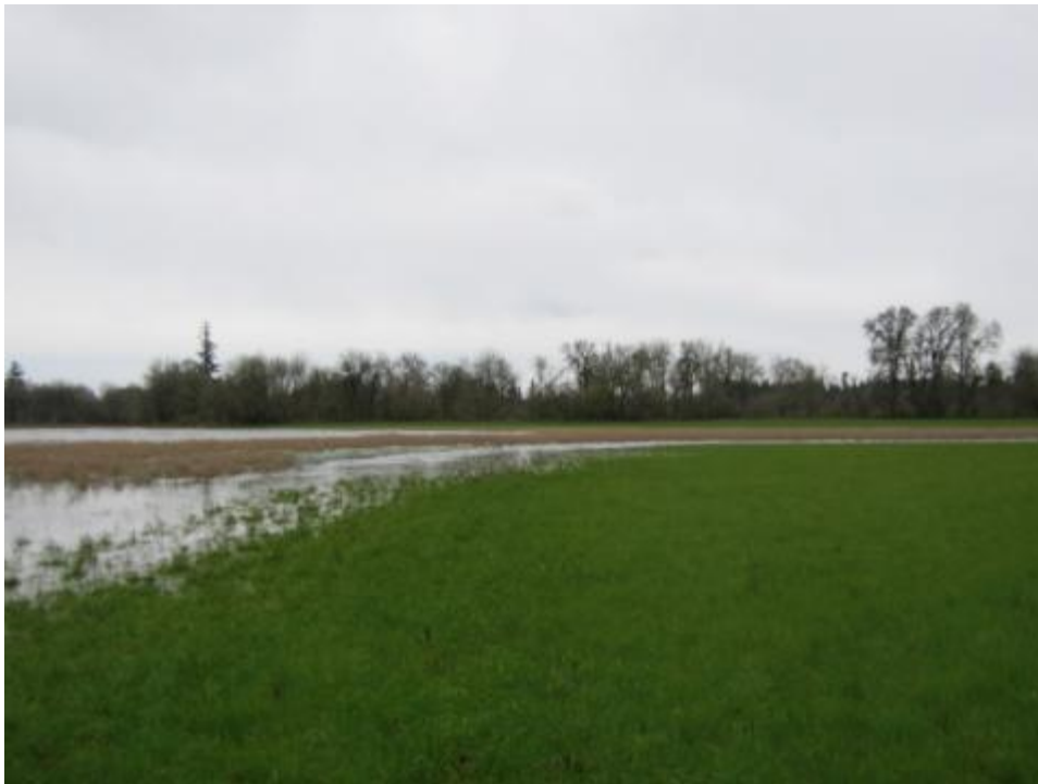
Photo Point 7- 3/2014- After seeding, planting, closure of water control structure and one growing season.