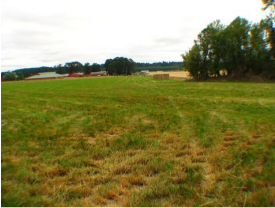
Photo Point 18- 8/2012- Northern portion of east field before initiation of project.