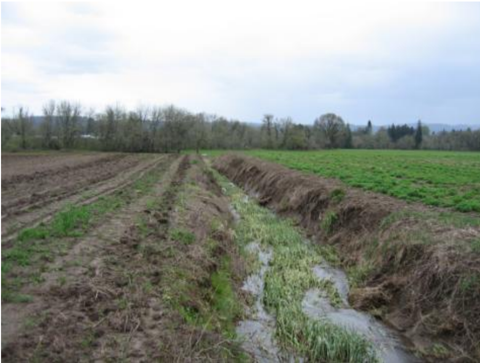
Photo Point 22- 3/2014- Central/western portion of east field after clearing of ground and before construction.