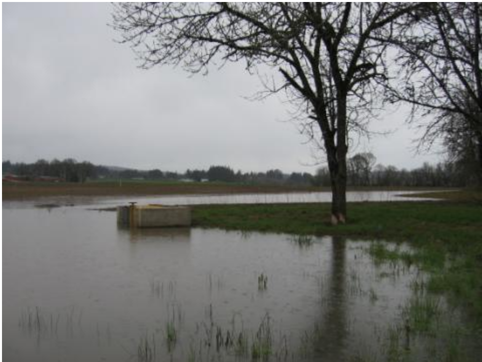
Photo Point 10- 3/2014- After seeding and planting and one growing season.