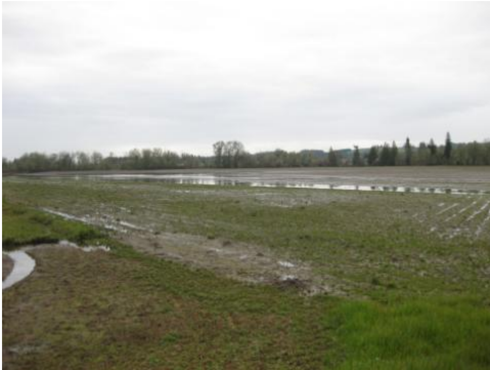
Photo Point 26- 12/2012- West field after seeding and before planting