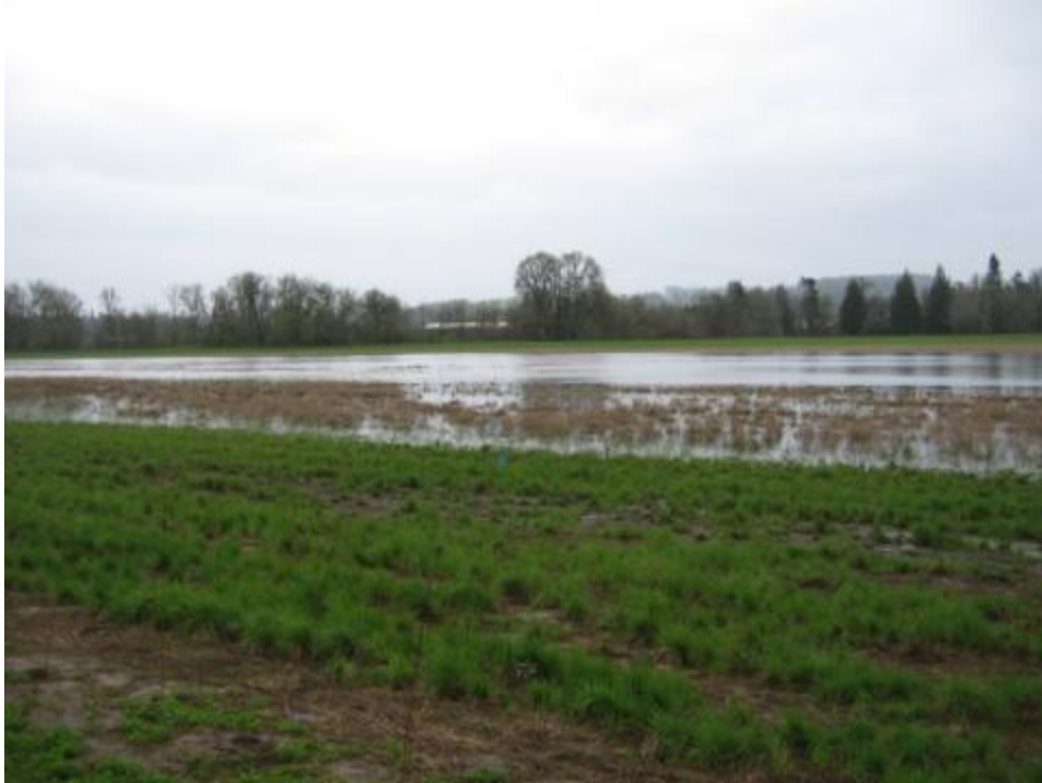
Photo Point 26- 3/2014- West field after seeding, planting, and one growing season.