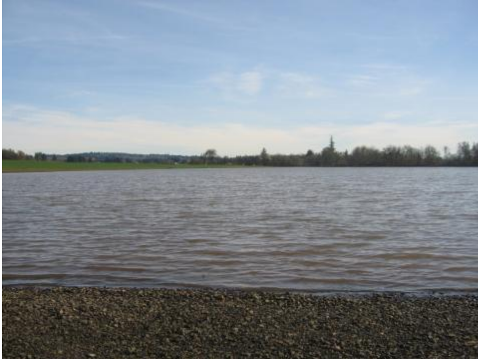
Photo Point 5- 11/2012- Immediately after seeding, before planting.