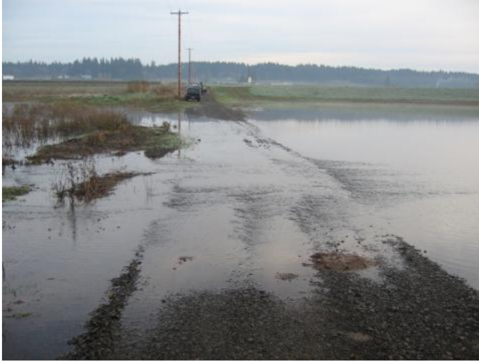
Photo Point 6- 11/2012- Immediately after seeding, before planting.