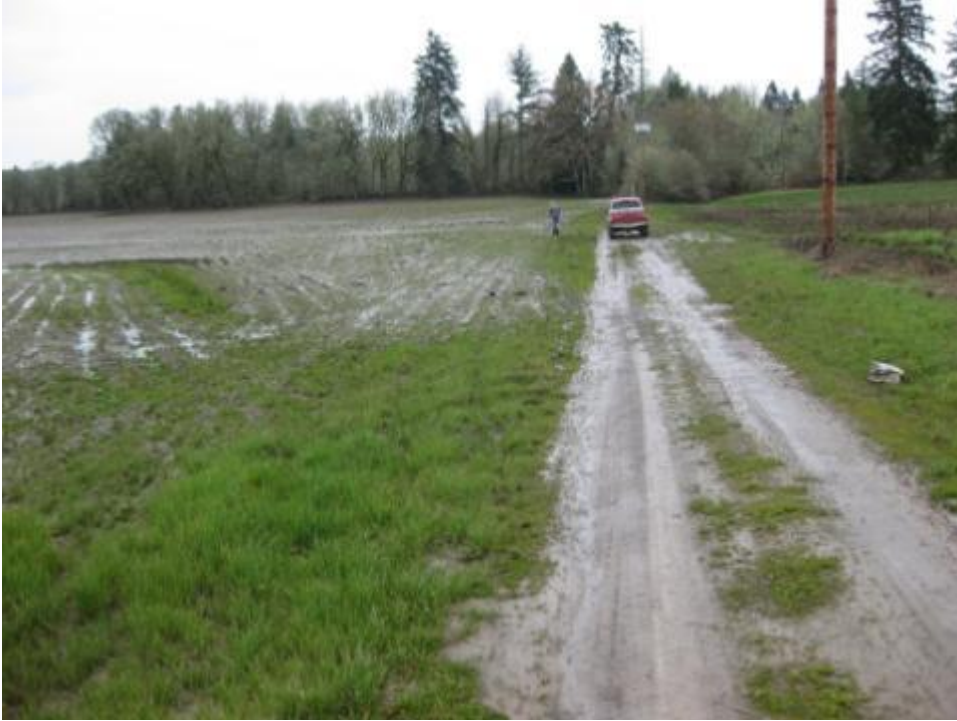
Photo Point 3- 11/2012- Immediately after seeding, before planting.