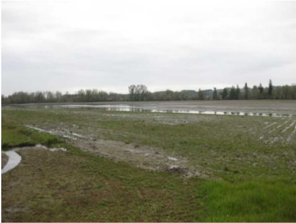
Photo Point 2- 11/2012- Immediately after seeding, before planting.