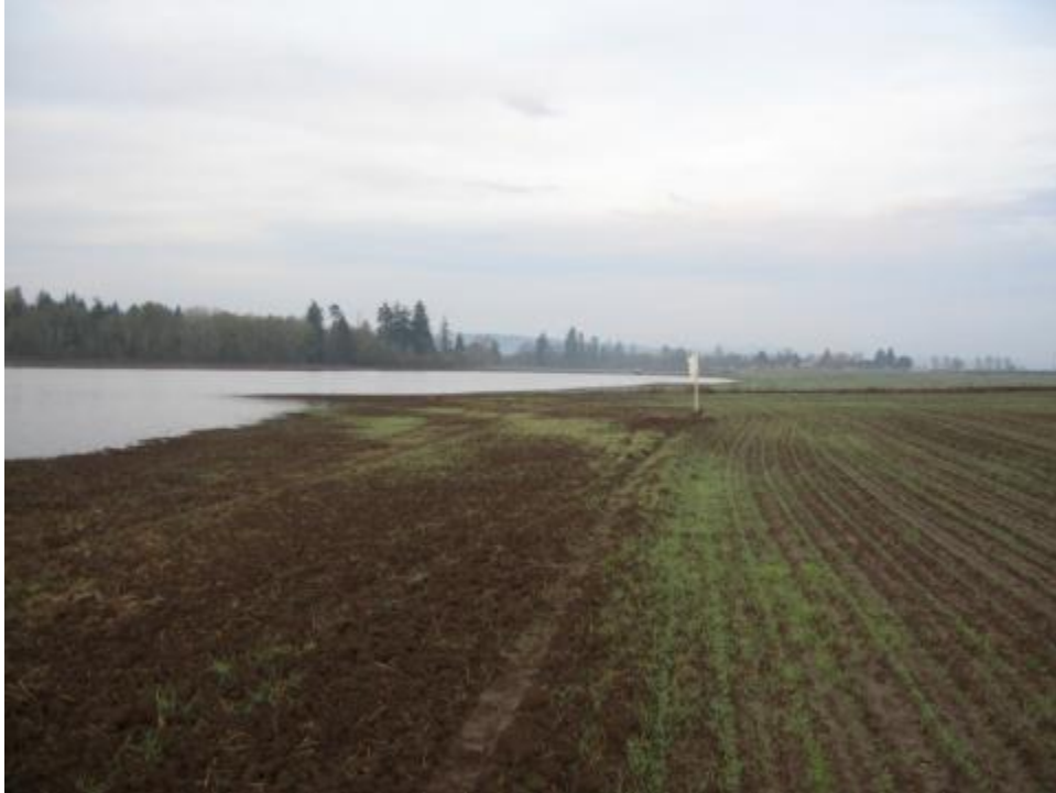
Photo Point 25- 8/2012- Looking towards west field after west field was seeded and water control structure closed.