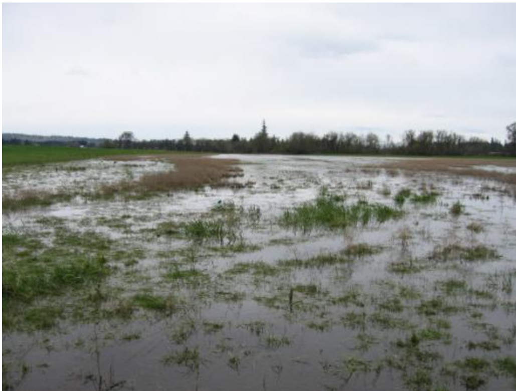
Photo Point 4- 3/2014- After seeding, planting, closure of water control structure and one growing season.