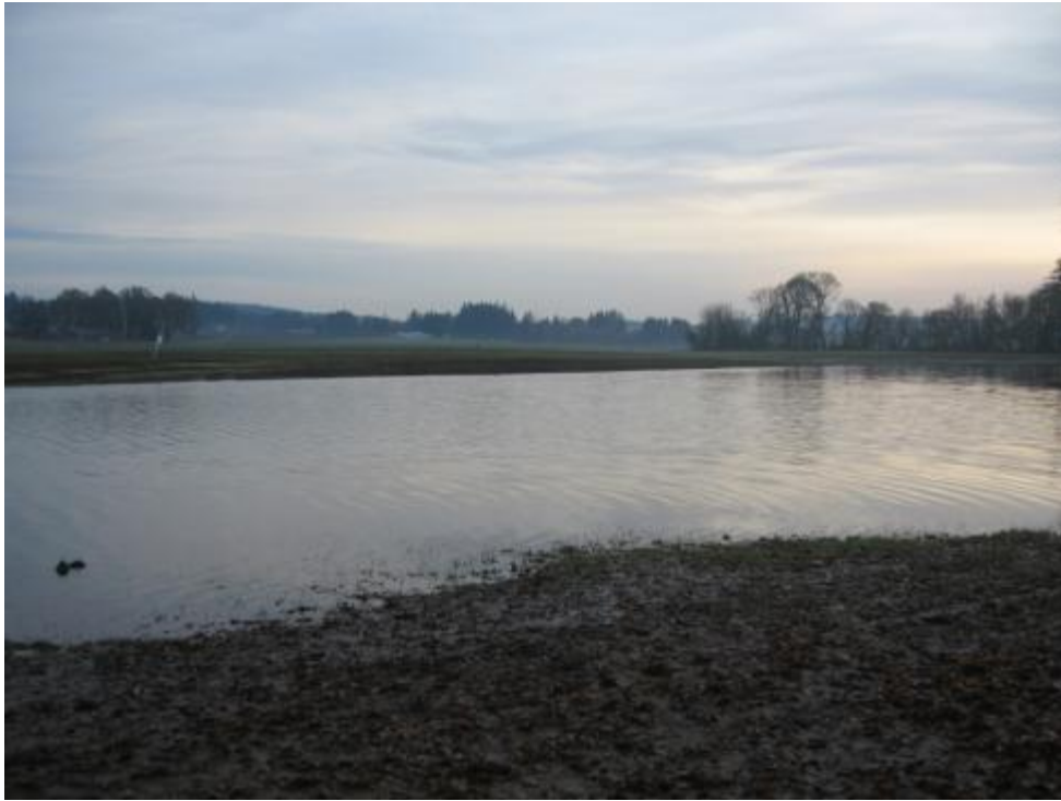
Photo Point 13- 12/2012- Before planting east field.