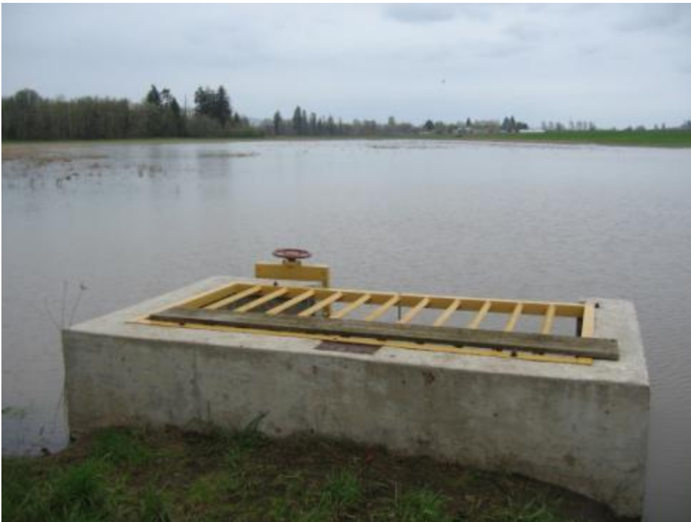
Photo Point 11- 11/2012- After seeding, planting and one growing season.