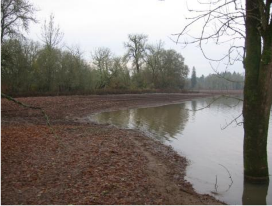
Photo Point 15- 12/2012- After seeding and before planting west field.