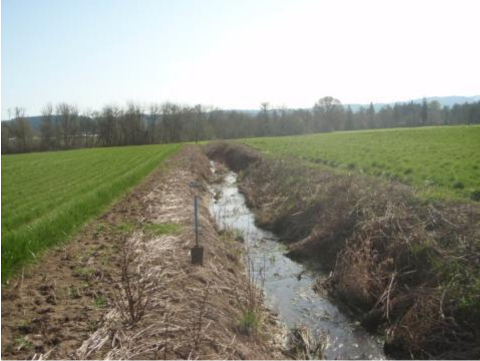
Photo Point 22- 8/2012- Central/western portion of east field before initiation of project.