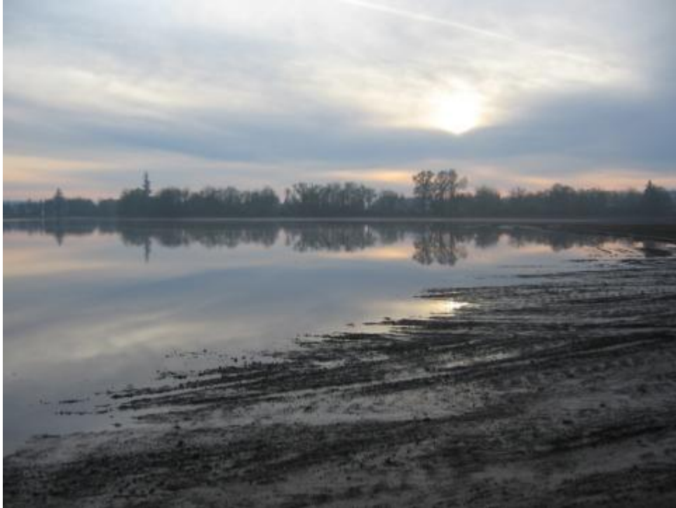
Photo Point 7- 11/2012- Immediately after seeding, before planting.