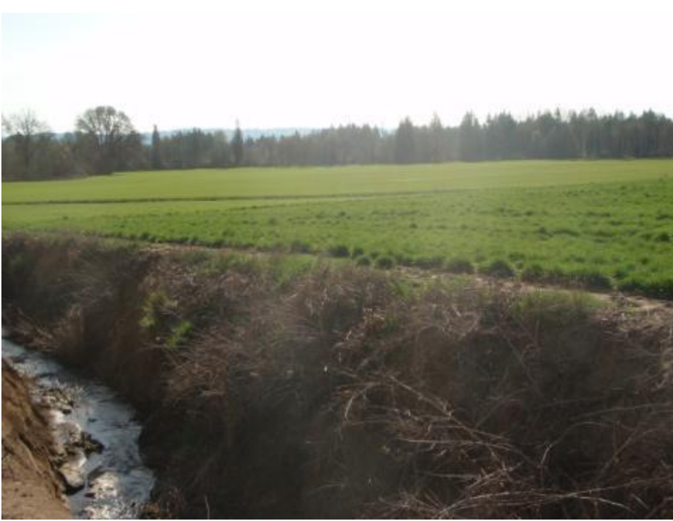
Photo Point 23- 8/2012- West field before initiation of project. Photo taken from east side of ditch.