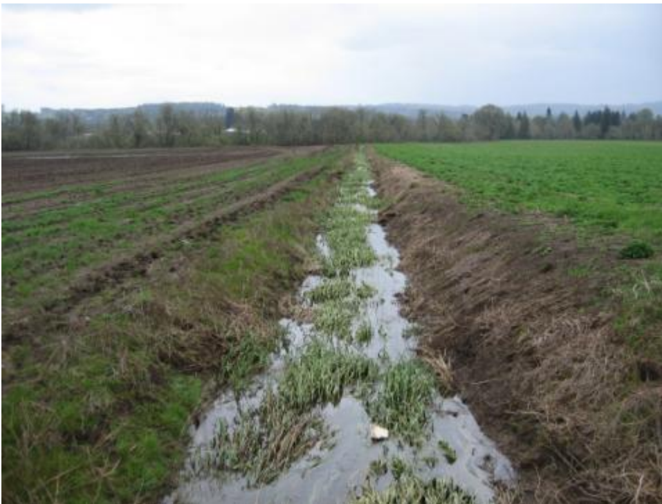
Photo Point 21- 3/2014- Northern portion of east field after clearing of ground and before construction. Photo taken from NW corner on culvert.