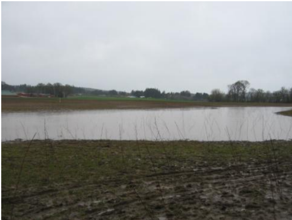
Photo Point 13- 3/2014- After planting southern part of east field.