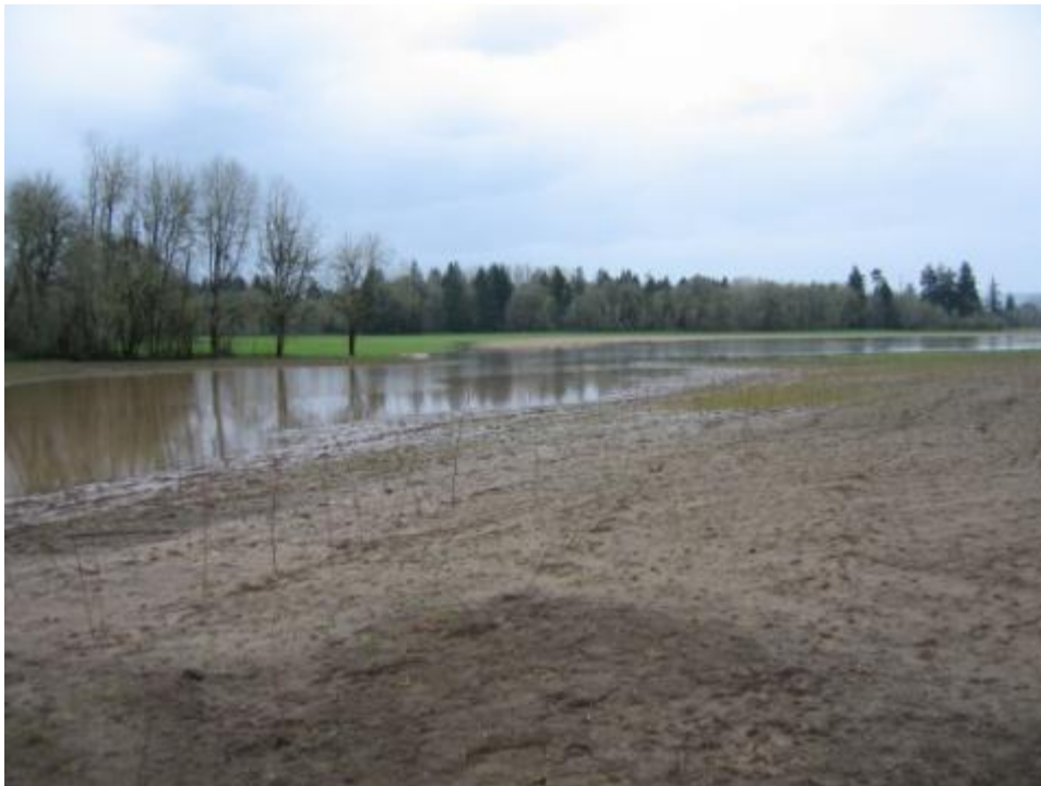
Photo Point 24- 8/2012- Looking towards west field after west field was seeded, both fields planted.