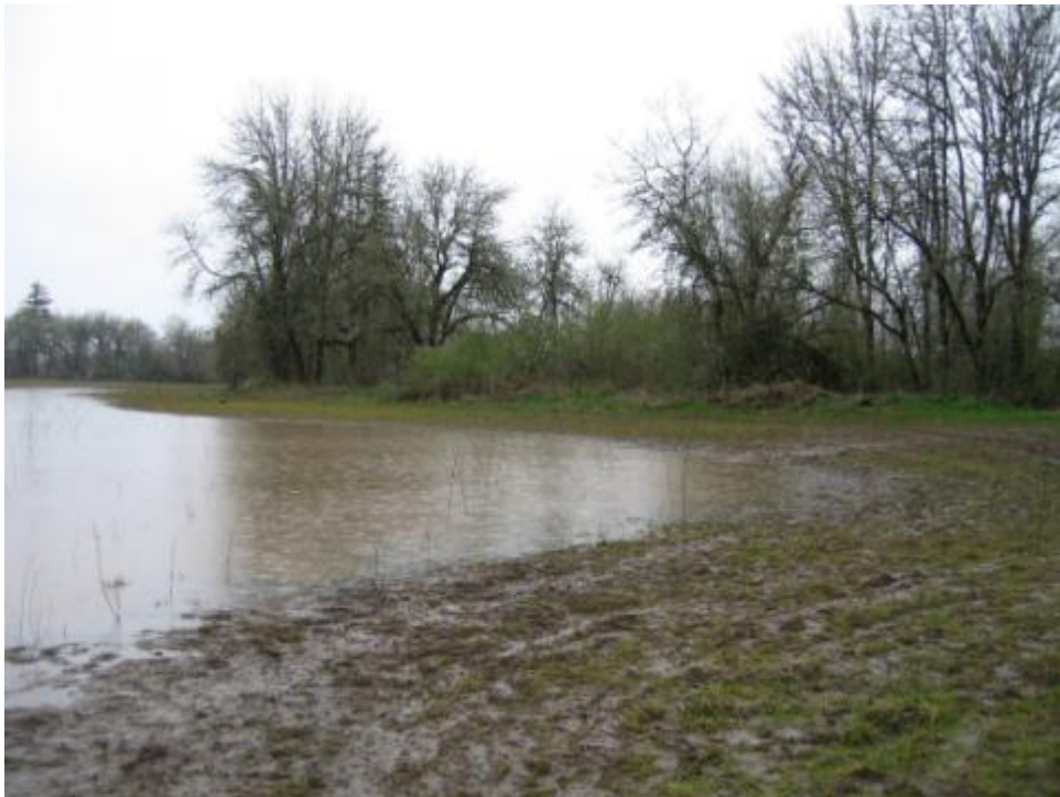
Photo Point 14- 3/2014- After planting southern part of east field.