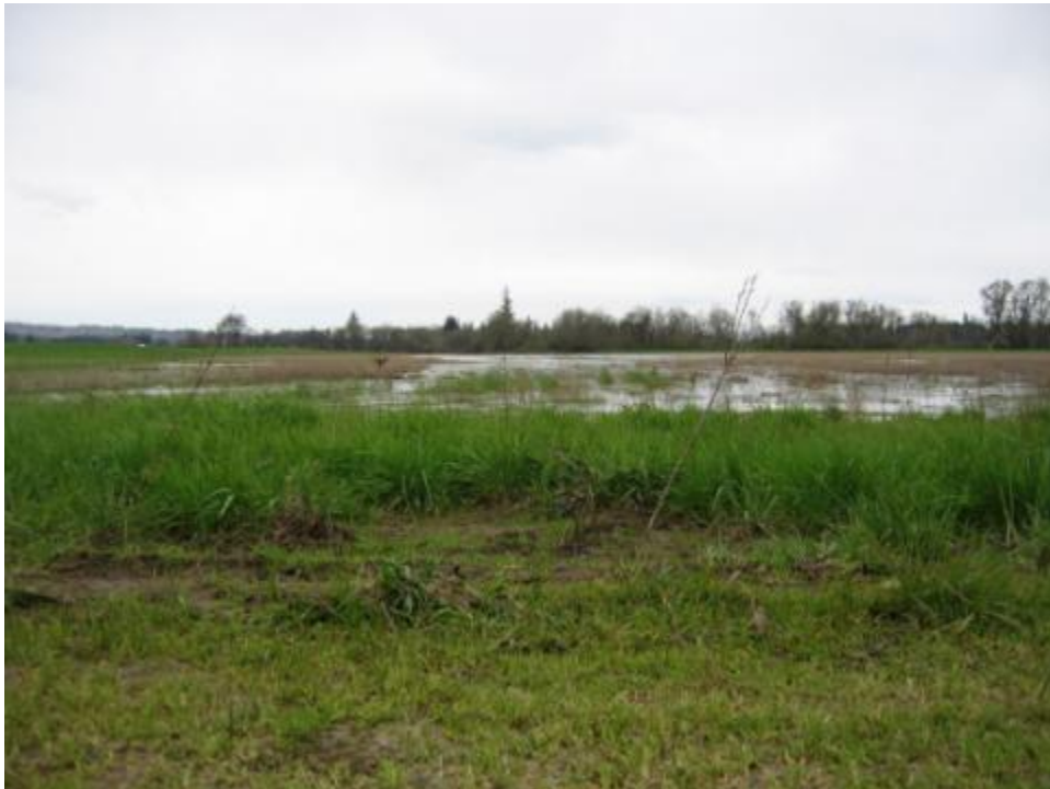
Photo Point 5- 3/2014- After seeding, planting, closure of water control structure and one growing season.