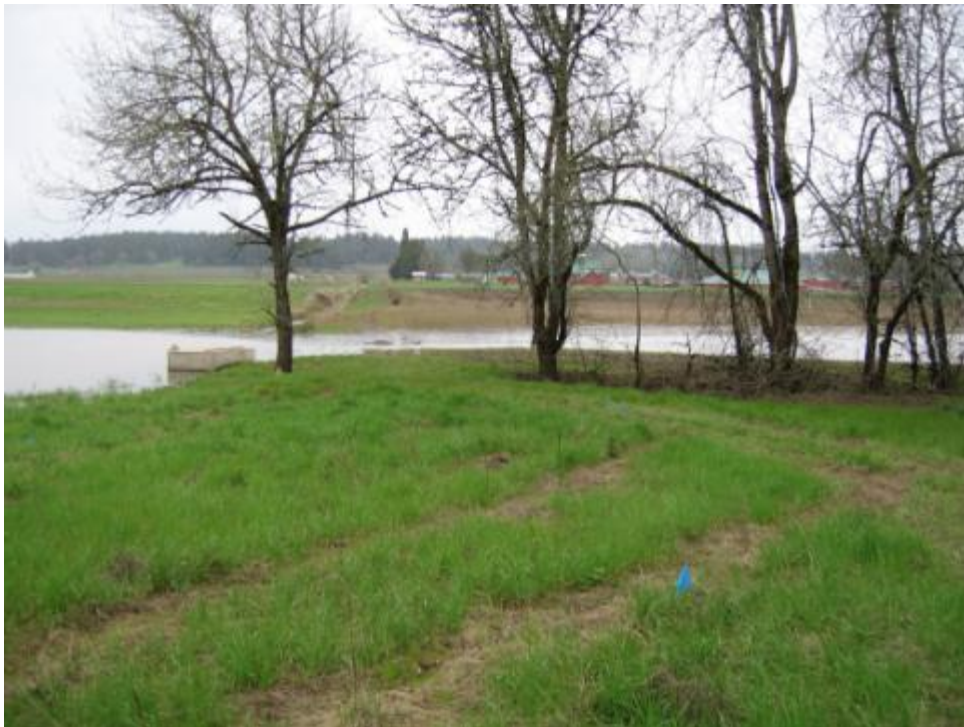
Photo Point 9- 3/2014- After seeding and planting and one growing season.