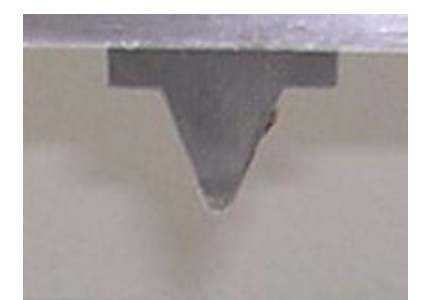
Figure 2. The shearing tooth mounted onto a Tenderometer.

Early work with the Tenderometer showed that it had a strong relationship with the Warner Bratzler and the two devices could provide equivalent results with almost 80% accuracy. Furthermore, these studies also showed that the Tenderometer could be used to predict consumer tenderness scores with approximately 70% accuracy although this level of accuracy was reduced if the meat was either very tough or very tender. Based on these very promising trials, the Tenderometer was adopted as the industry standard measurement tool for meat tenderness. Work with consumers and the Tenderometer demonstrated clearly that a shear force (Kgf) of 11 or above was perceived by consumers as being extremely tough. Shear force values of 8 to 11 were measured as acceptable, while values of less than 8 were scored as tender. Using these data, a tenderness specification was developed which required that 95% of all bites, or 1 cm x 1cm samples, should have a shear force value of less than 11Kgf, and overall all samples should have an average shear force of 8 Kgf. Extensive testing of this specification in both New Zealand and the UK demonstrated that this was an acceptable standard to ensure consumer confidence in the NZ product. These data are presented in the histogram format shown below.