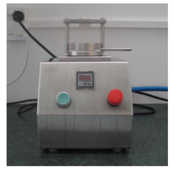
Figure 1. The G1 tenderometer

In the early 1970's MIRINZ (Meat Industry Research Institute of New Zealand) developed the first 'Tenderometer' This device was developed in an effort to provide a quicker, cheaper and more reliable tool to measure cooked meat tenderness - one that could be used in both a research and a commercial environment. The device