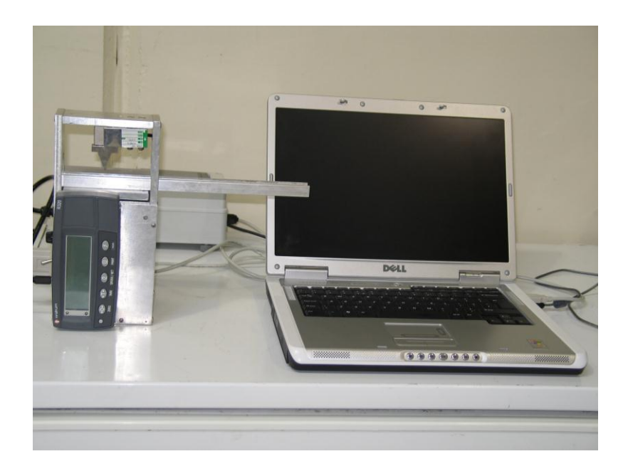
Figure 5. The G2 Tenderometer connected to a laptop PC for automatic data capture

The unit has been tested extensively and final modifications are complete. The next stage is to re-case the unit in a plastic moulded case which will allow it be easily cleaned and will ensure the unit is water-proof.