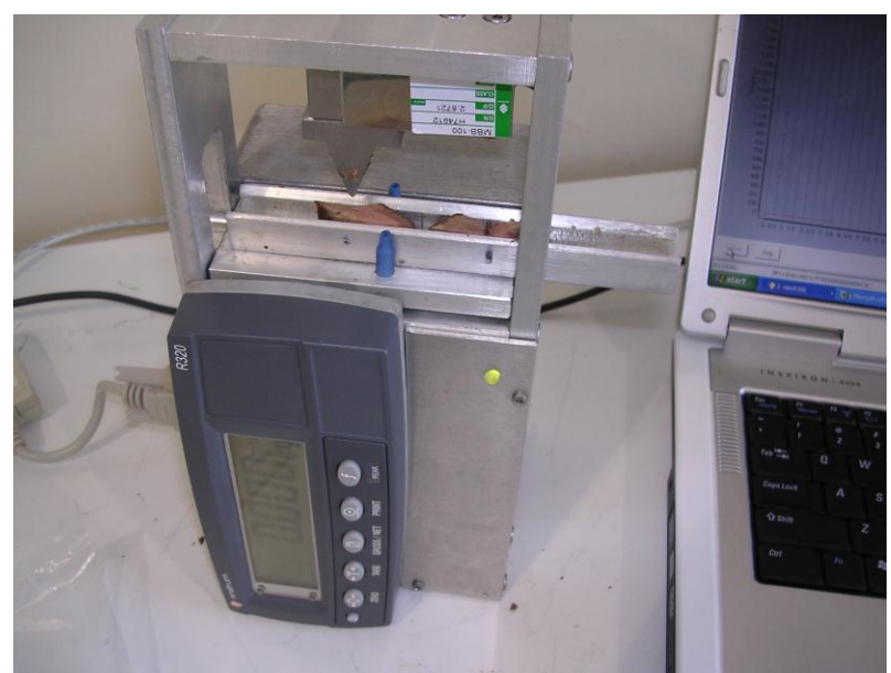
Figure 6. View of G2 Tenderometer from above. This photograph clearly shows the raised platform with the presentation tray moving the samples up to the shearing tooth.

Comparison between G1 and G2 tenderometers.