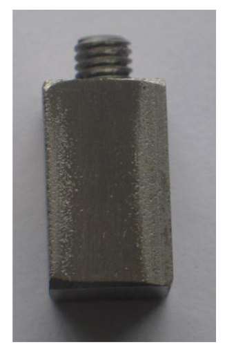
Figure 8. The compression head for G2 tenderometer texture measurement

Recently, a trial was undertaken using the compression head shown in Figure 8 on the G2 tenderometer to measure meat samples that had been through different rates of post-mortem pH fall and aged for different periods of time. The meat samples were also given to the trained sensory panelists to score the attributes described above. The preliminary analysis of these data is complete and initial findings are that the compression measurement on the G2 can be used to predict initial juiciness with 62%