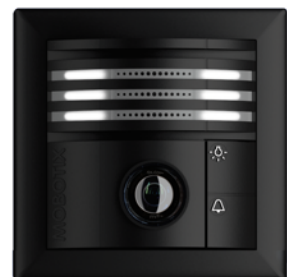
Comparable standard colors (not exactly the MX colors): White: RAL 9016, Silver: RAL 9006, Dark Gray: DB 703, Black: RAL 9005