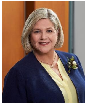
Andrea Horwath Mayor

A handwritten signature in blue ink that reads "Andrea Horwath".