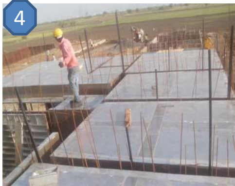
4 Ground Floor Wall, Slab Panel Erection