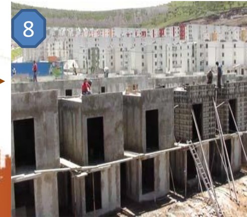
8 Two Floor Completed