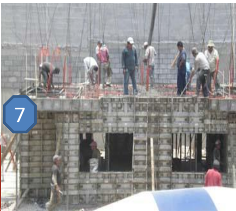
7 First Floor Wall Panel Erection