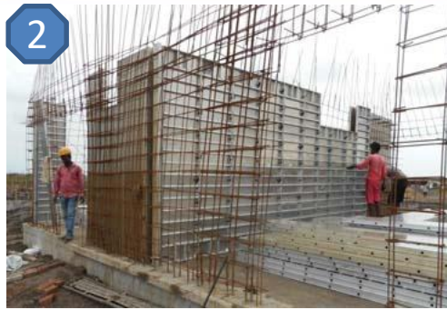
2 Ground Floor Wall Panel Erection