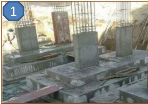
1 Up to plinth level Conventional Method