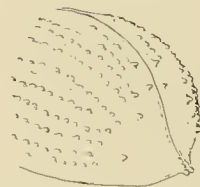
Fig. 3. Hylocurus incomptus dorsolateral aspect of male elytral declivity.

This species is allied to femineus Wood, but it is readily distinguished by absence of sexual dimorphism on the frons, by the much more finely sculptured elytral disc and declivity, and by the steeper elytral declivity.