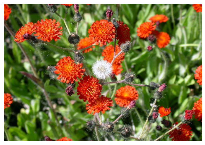
FIGURE 4. Orange hawkweed flowers.

Livestock, deer and elk consume hawkweed foliage and buds. Research has shown that the hawkweeds have moderate to high nutritive values, and digestibility data suggest that species in the meadow hawkweed complex may be used by cattle and sheep, although questions about palatability and utilization still remain to be answered. However, under intensive grazing, hawkweeds displace nearly all other vegetation.