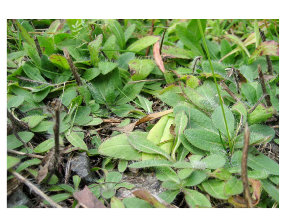
FIGURE 2. Dense rosettes of meadow hawkweed ( Hieracium caespitosum ).

Each hawkweed rosette generally produces 1 flowering stem (but can produce up to 30) that is 10 to 36 inches tall. Although the stems are often bare, they sometimes develop one to three small clasping leaves. Each stem is capable of producing between 5 and 30 flower heads. Like the leaves,