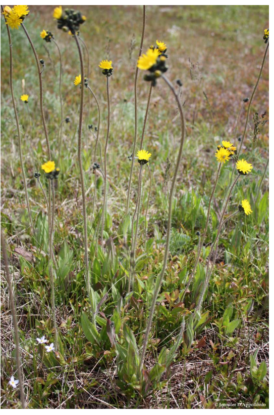
FIGURE 3. Meadow hawkweed ( Hieracium caespitosum ).

the stems are hairy and contain a milky sap (Figure 3).