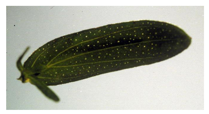
FIGURE 3. Glands on the leaf of St. Johnswort look like tiny perforations.

"perforatum" (Figure 3). These perforations can be seen when one holds the leaf up to a light source. Flowers, which turn from east to west as the sun crosses the sky, grow in an open, flat-topped, terminal group. Flowers are bright yellow with five sepals and five petals. Petals are typically twice as long as sepals and bear black glands along the margins. Stamens are numerous and arranged in three groups. An egg-shaped, three-valved capsule (Figure 2a) bursts at maturity and releases many seeds (Figure 2b). A gelatinous coating on the seeds becomes sticky when wetted and adheres to the fur, feathers, or clothing of passing animals or humans.