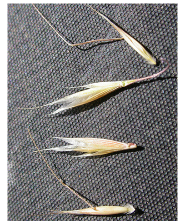
FIGURE 3. Seeds have bent awns.