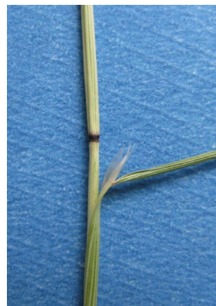
FIGURE 2. Reddish-black node and long, membranous ligule of ventenata.

Habitat: Ventenata mostly germinates in fall, but some germination can take place in spring. It is adapted to characteristic Mediterranean climates with cool, wet winters and hot, dry summers. Ventenata can invade rangeland, pastures, winter grain and hay fields, Conservation Reserve Program lands, and sagebrush steppe habitats (Figure 4). Field observations suggest it can grow in areas with moderate annual precipitation ranging from 14 to 44 inches and elevations ranging from 33 to 5,900 feet.