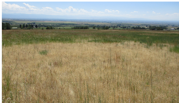
FIGURE 4. Ventenata can invade pastures, reducing forage production.