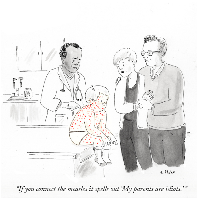
"If you connect the measles it spells out 'My parents are idiots.'"