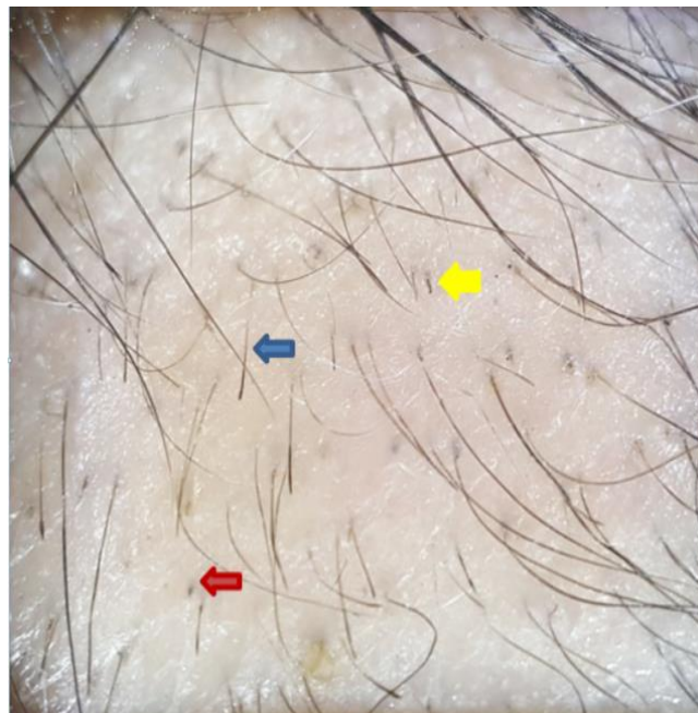
Figure 3. Blue arrow shows exclamation mark hairs, red arrow shows black dot, yellow arrow shows broken hairs.