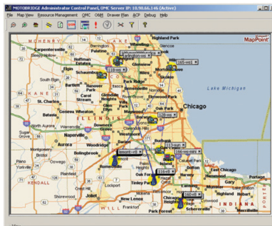
Administrator Control Panel provides a unique customer driven map with the location and status of each system component.

Administrator Control Panel (ACP) Client – provides up to 10 user level interfaces to the OMC to view and monitor the status of the entire MOTOBIDGE distributed network, as well as override any commands made at the dispatcher level. It can configure the system, provision users, assign user privileges (up to 9 levels) and PTT priority levels (up to 8), monitor network quality of service performance, enable fault management and alarming, centrally download new system software versions, and manage audio encryption keys.