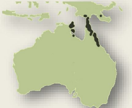
Distribution of Dillenia alata in Australia and New Guinea Map modified from Atlas of Living Australia

during the three-year voyage of the Pacific.