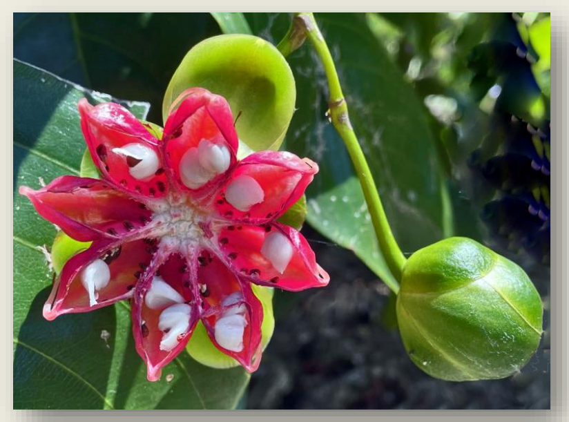
Fruit – shiny brown/black seeds and edible white arils of Red Beech.

Repairs to the hull took 48 days, and during this time the ship's crew were variously involved sourcing and cutting suitable replacement timbers, forging new nails and other iron components, and fishing and hunting turtles for sustenance. This was fortuitous for botanists Joseph Banks and Daniel Solander who collected more than 200 plant species and illustrated 190. It was the largest collection of plants made