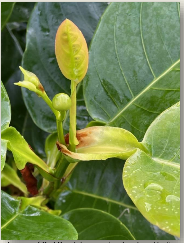
Leaves of Red Beech have curiously winged leaf stalks that enclose the stem.