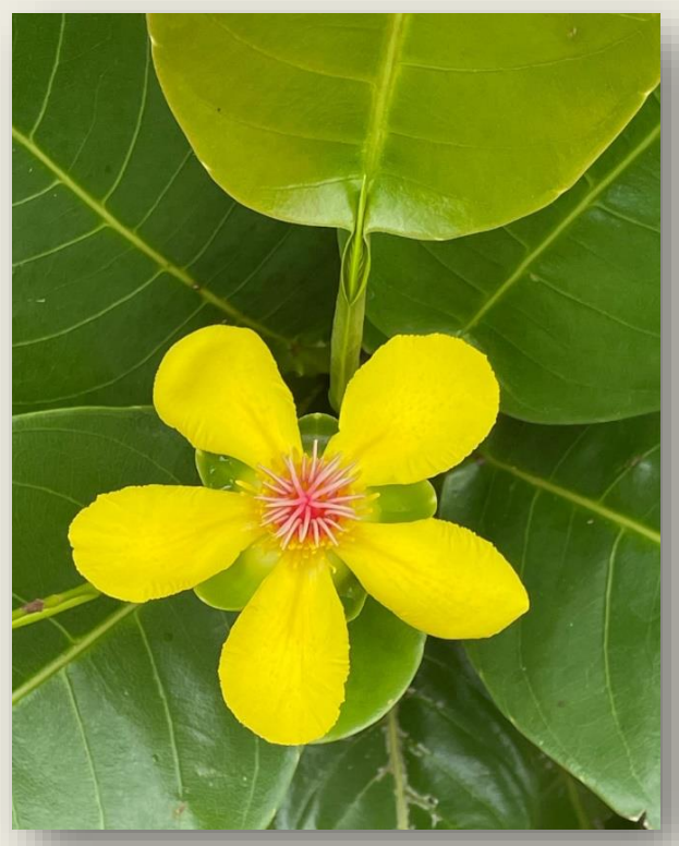
Dillenia alata – Red Beech

On 11<sup>th</sup> June, 1770, Lieutenant James Cook's ship, Endeavour, ran aground on an offshore coral reef north east of Cape Tribulation in far north Queensland. The crew eventually manage to float it free from the reef, but it was essential to find a safe harbour where