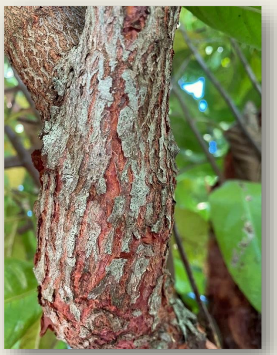
Red papery bark Dillenia alata – Red Beech.

Atlas of Living Australia: https://bie.ala.org.au/species/https://id.biodiversity.org.au/node/apni/2901433 Atlas of Living Australia: