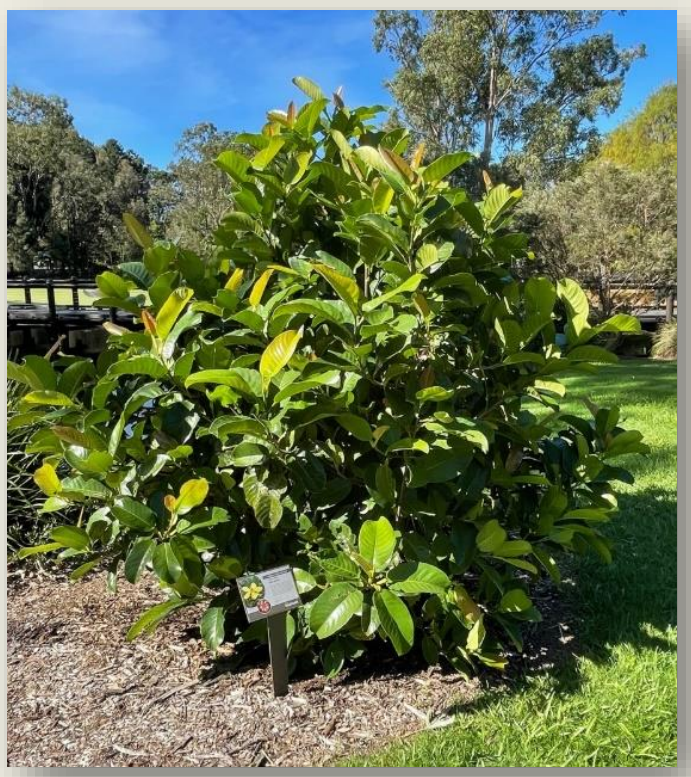
A young tree in the Gold Coast Botanic Gardens.

You may wonder why Dillenia alata seems so familiar until you realise that it is closely related to the very similar, golden-flowered Hibbertia species, both belong in the plant family Dilleniaceae; one difference being that there are almost 400 species of Hibbertia in Australia, but only one Dillenia – Dillenia alata . Mind you, there are about sixty species of Dillenia elsewhere in the world. In 1816, Swiss botanist Augustin Pyramus de Candolle formally described Dillenia alata , based on the original plant material collected by Joseph Banks at Cooktown.