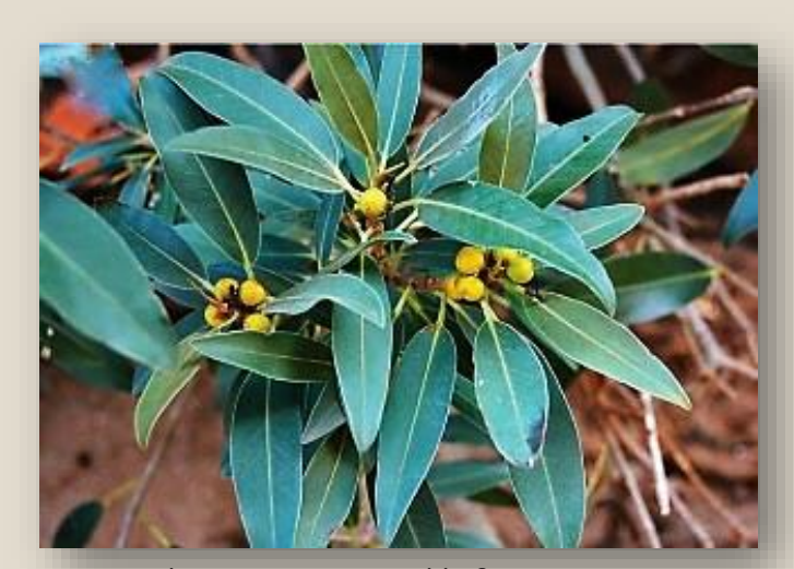
Ficus desertorum From Wilde & Barrett 2021

Desert Figs are of great importance to First Nations people of Central Australia, as a traditional source of food, for shelter and for spirituality. Nutritionally, they are rich in calcium and potassium. Even the dry fruit fallen to the ground was ground with water to form hard balls that could be