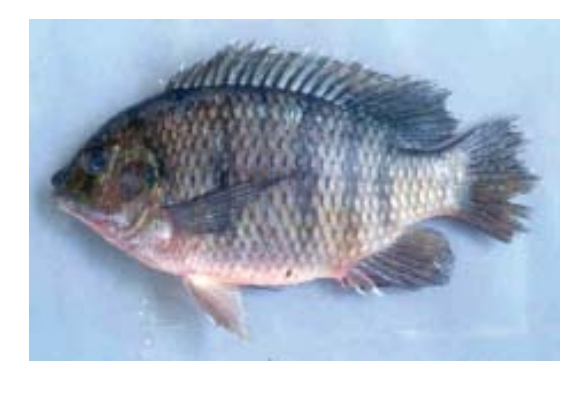
Oreochromis aureus <sup>b)</sup>

This species was introduced into Thailand in 1970 from Israel. It was not used for aquaculture as intended and there is no evidence of its having reached the Mekong Basin. It is however listed as established, a fact which is indicated by naturally breeding populations in reservoirs on Mekong tributaries in Northern Thailand. These populations are still in existence and the spread of the species further downstream cannot be excluded. O. aureus is a generalized feeder with a preference for detritus and decanted phytoplankton. It also eats small fish