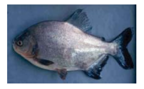
Colossoma macropomum <sup>c)</sup> (Pacu)

The pacu is a species of growing importance for aquaculture in the region. Its use is widespread in China, Indonesia and Central Thailand. The species is not popular in Northeast Thailand at present because its bony nature and taste are not appreciated and it has not been adopted for culture. However, it is cultured in the central region of the country, where it is found in regular markets and supermarkets. This indicates that it is potentially acceptable and may eventually be cultured in the Mekong Basin. As a large species whose native