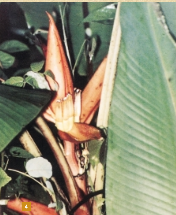
Figure 4. Musa aurantiaca (A. Rekha, IHR).

The confusion between M. ornata and M. rosacea is such that the present day distribution of neither species is clear. However, there is a new description of another M. rosacea (non. Jacquin), which was found recently in the higher altitude forests of Arunachal Pradesh, India, by Singh et al. 2001. The plant is described as being freely suckering, with new