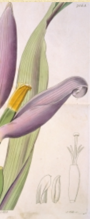
Figure 6. Musa rosacea as illustrated in Edward's Botanical Register, 1823.

In Brazil there has been in cultivation for decades or even centuries a species called Musa violacea , which is very similar to Musa