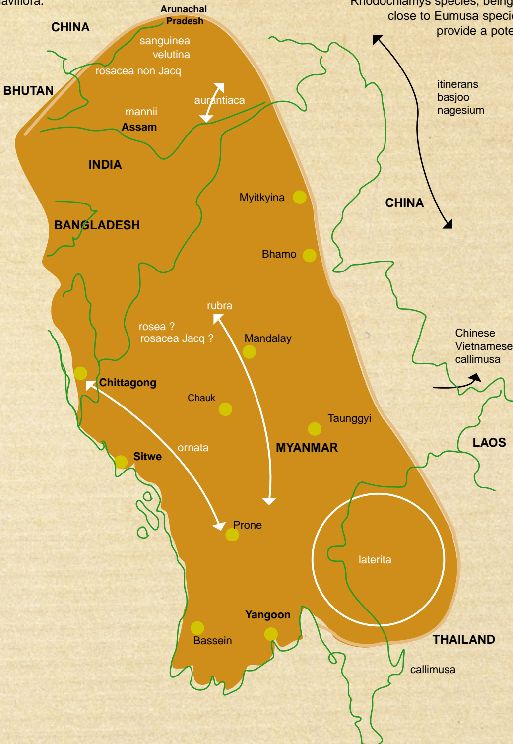
Figure 1. Possible distribution of species in the section Rhodochlamys .