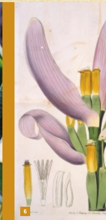
Figure 5. Musa rosacea Jacq. (M. Häkkinen).

original description of M. ornata in Flora Indica "This is probably M.rosacea Jacq.". It seems that Wallich, in editing Flora Indica after Roxburgh's death, made an honest mistake but the error was so commonly repeated that the synonymy of M. ornata and M. rosacea came to be accepted as fact. A further confusion dates back to 1805 when the names M. rosacea and "copper banana" (an AAB variety) were mixed.