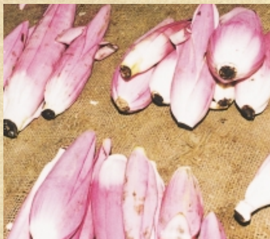
Figure 3. Male buds of M. rosacea (non Jacq.) for sale in India (S.Uma, NRCB).

With the exception of their use as ornamental plants in the horticultural and florist industries, there is a little recorded human use of species in this section. In some areas of Northeast India, the male buds are collected and eaten as a vegetable (Figure 3), but the fruit are seedy and unpalatable, and therefore not used for food.