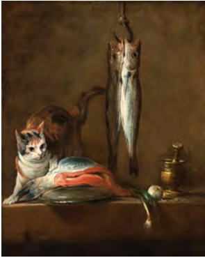
JEAN SIMEÓN CHARDIN Paris, 1699–1779 Still Life with a Cat and Fish and Still Life with a Cat and Rayfish , 1728

Oil on canvas. 79.5 x 63 cm each INV. 119 (1986.3) and 120 (1986.6)