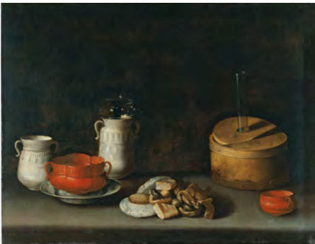
JUAN VAN DER HAMEN Y LEÓN Madrid, 1596–1631