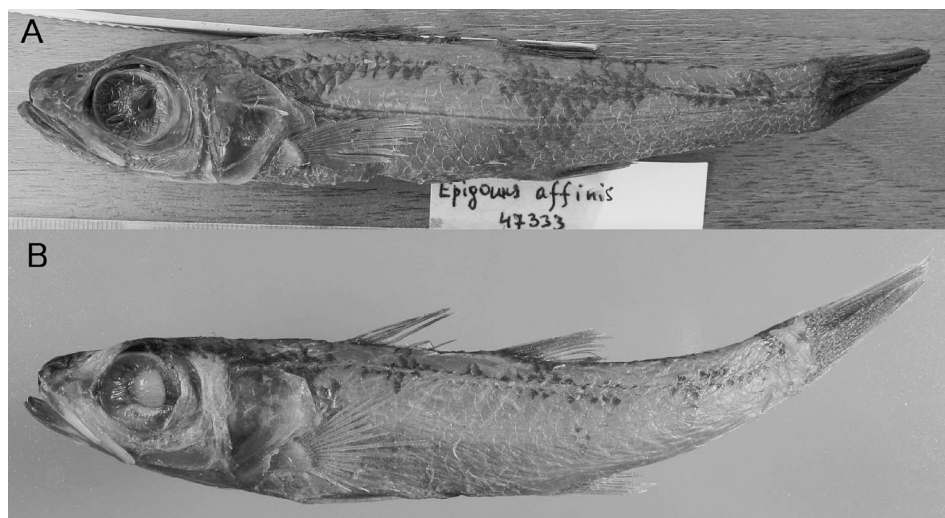
Fig. 1. Epigonus affinis Parin and Abramov, 1986. A, Holotype, ZIN 47333, 145.0 mm SL; B, additional specimen, HUMZ 100066, 108.5 mm SL.