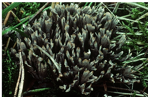
Thelephora palmata