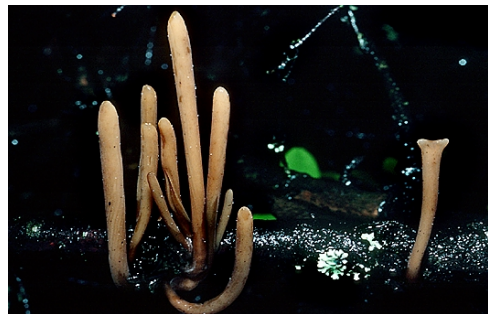
Macrotyphula fistulosa