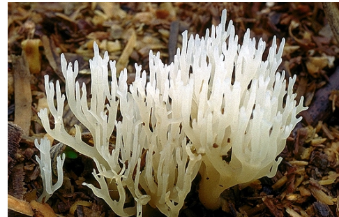
Lentaria epichnoa

Growing on soil; spores globose, subglobose to elliptical 9