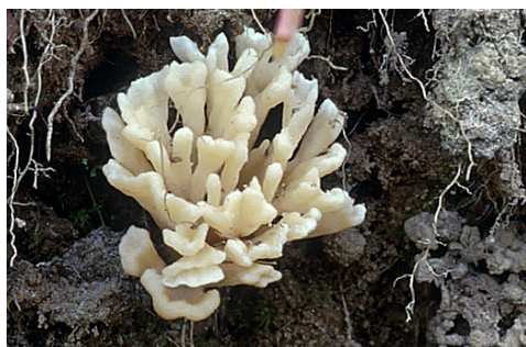
Tremellodendriopsis tuberosa