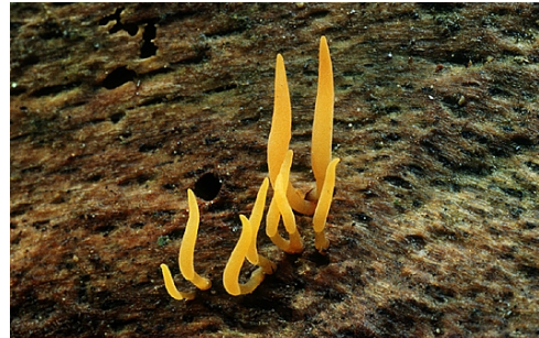
Calocera cornea