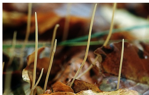
Macrotyphula juncea