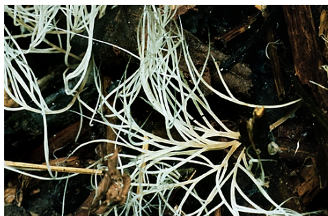
Pterula multifida