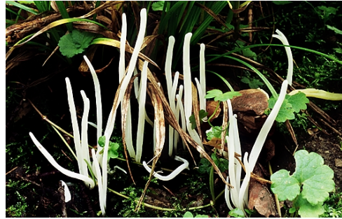
Clavaria vermicularis