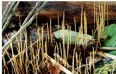
Typhula phacorrhiza