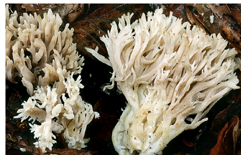
Clavulina cristata

Basidia mostly four-spored; spores globose to ellipsoide; branches mostly smooth with acute to rounded tops 10