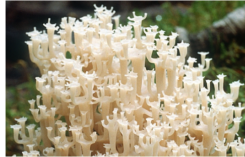
Clavicornona pyxidata

Tops acute to rounded; without gloeocystidia; spores non-amyloid 8