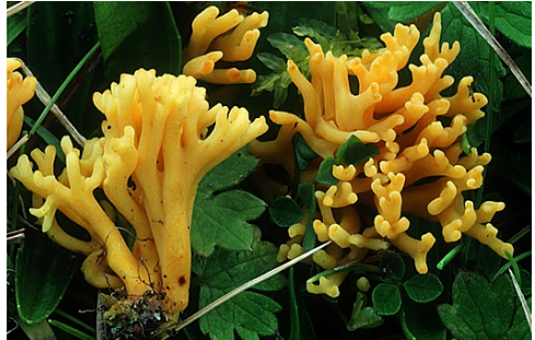
Clavulinopsis corniculata