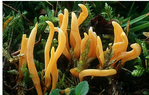
Clavulinopsis luteoalba