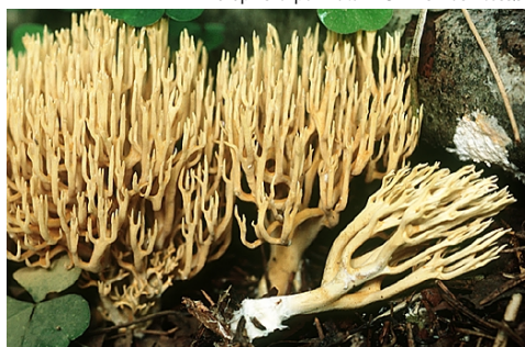
Ramaria eumorpha