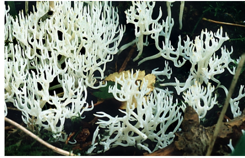
Ramariopsis kunzei