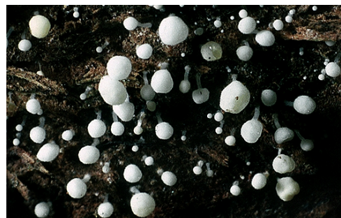
Physalacria sp.