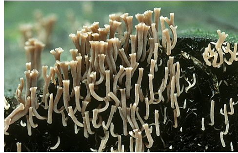
Clavicornona cristata