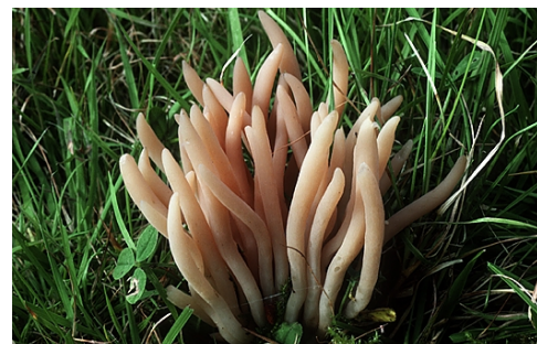
Clavaria fumosa

Hyphae generally with clamps, basidia with a normal clamp at the base 11