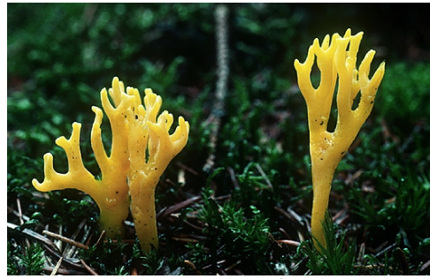
Calocera viscosa

Flesh soft and fragile or colour different; basidia club-shaped 7