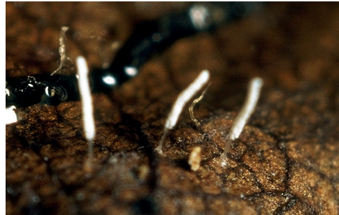
Ceratellopsis aculeata