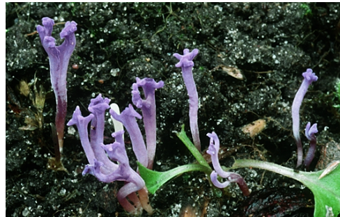
Ramariopsis pulchella