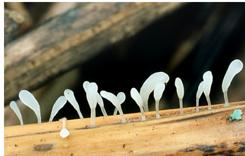
Typhula quisquillaris