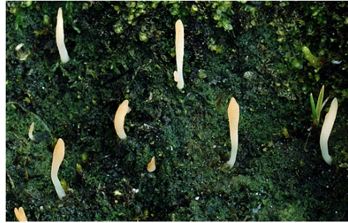
Multiclavula vernalis