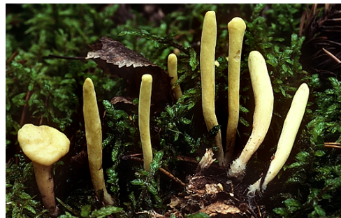
Clavariadelphus ligula