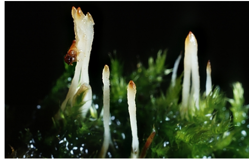
Eocronartium muscicola