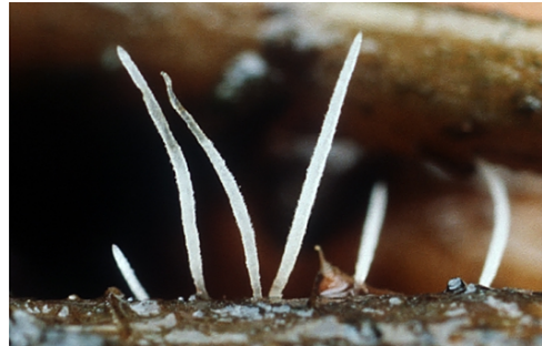
Pterula gracilis