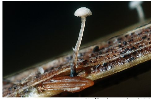
Pistillina brunneola