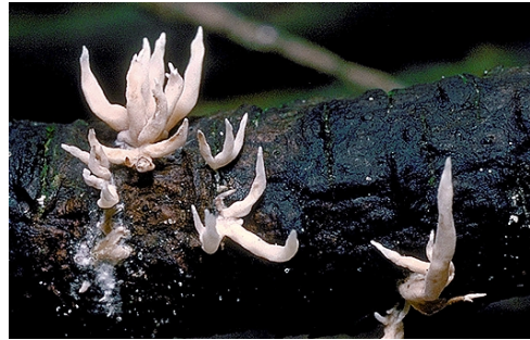
Lentaria byssiseda