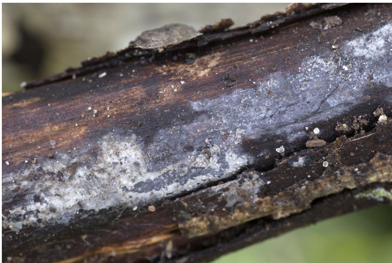
Figure 2 – Amyloenasma allantosporum in Suomussalmi (TH 20170037).

These are the 7 th –9 th records in Finland. The previous records are from Tammisaari (1b), Helsinki (1b, two sites), Kuhmoinen (2b), Toivakka (2b) and Lieksa (3b) (Kotiranta et al. 2009, Miettinen 2012).