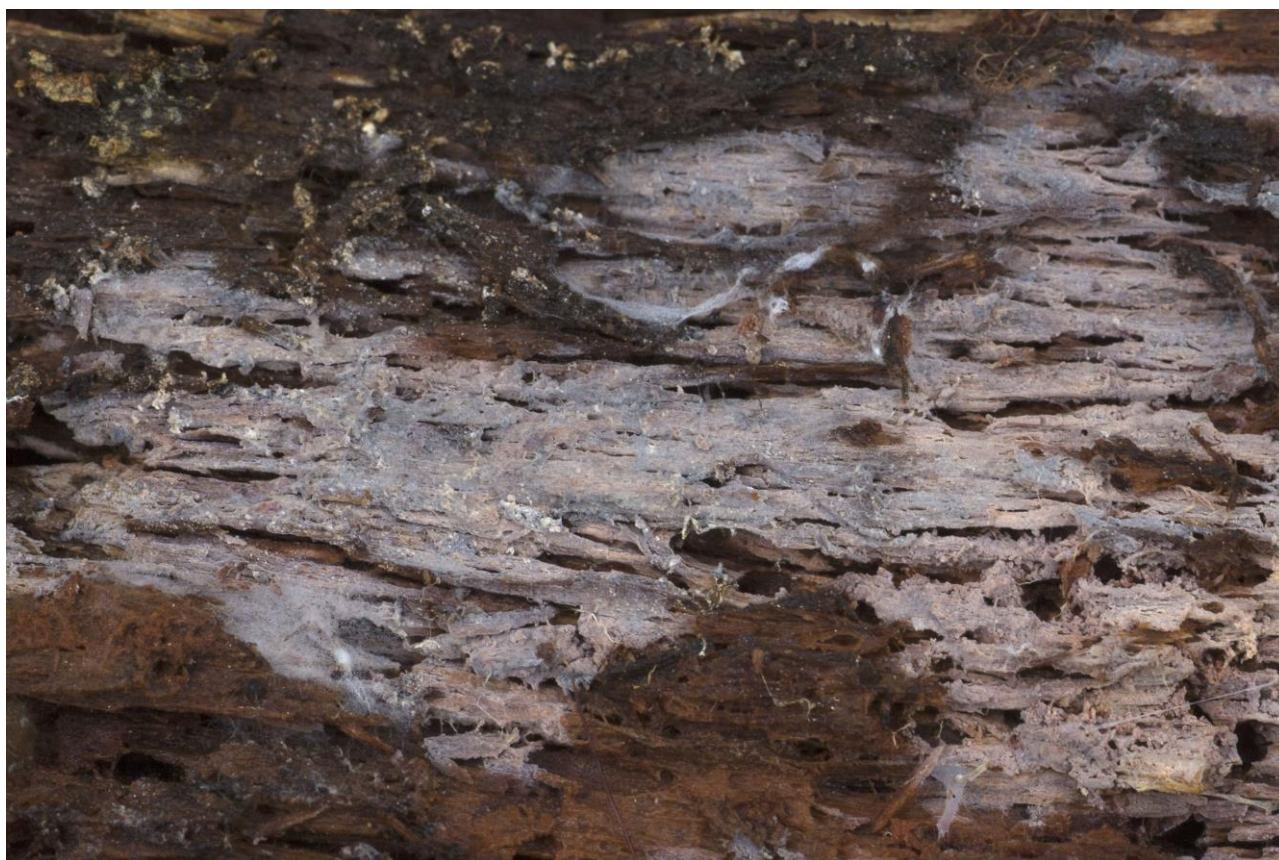
Figure 5 – Basidioidendron radians in Paltamo.

New to Middle boreal, Ostrobothnia (3a). This is the 4 th record in Finland. Previous records are from Lohja (1b), Kirkkonummi (1b) and Padasjoki (2a) (Kotiranta et al. 2009).