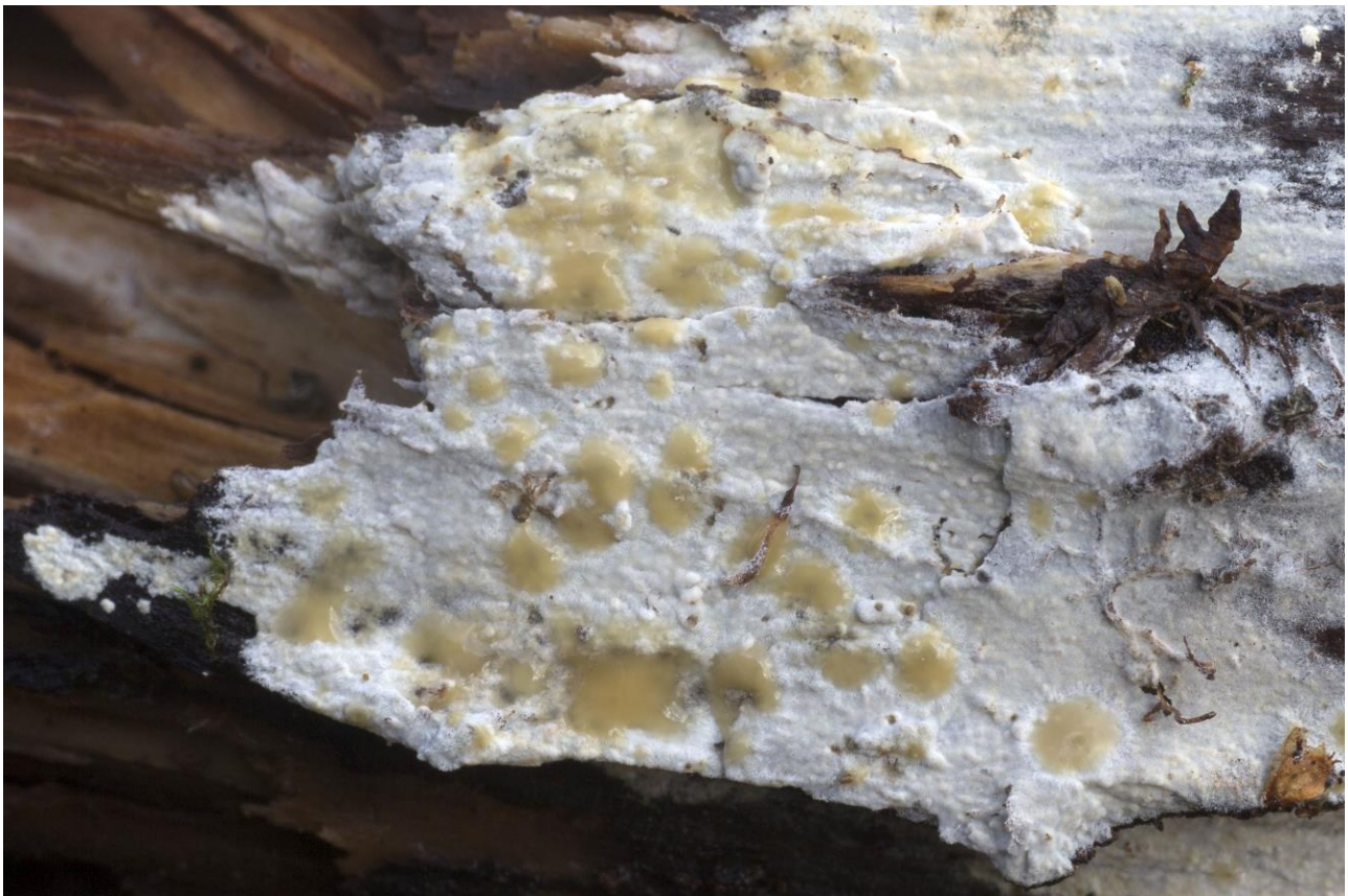
Figure 7 – Colacogloea peniophorae grew on Peniophorella pratermissa in Kajaani (TH 20170006).

These are the 3 rd –4 th records in Finland. The previous ones are from Lammi (2a) and Muurame (2b) (Kotiranta et al. 2009).