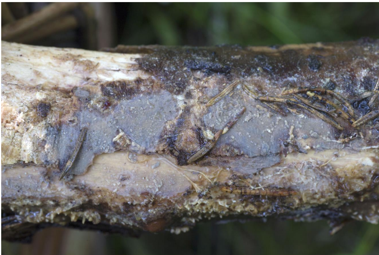
Figure 14 – Phanerochaete deflectens in Kajaani (TH 20170035).

New to Southern boreal, Lake District (2b) and Middle boreal, Northern Carelia – Kainuu (3b). Near Threatened.