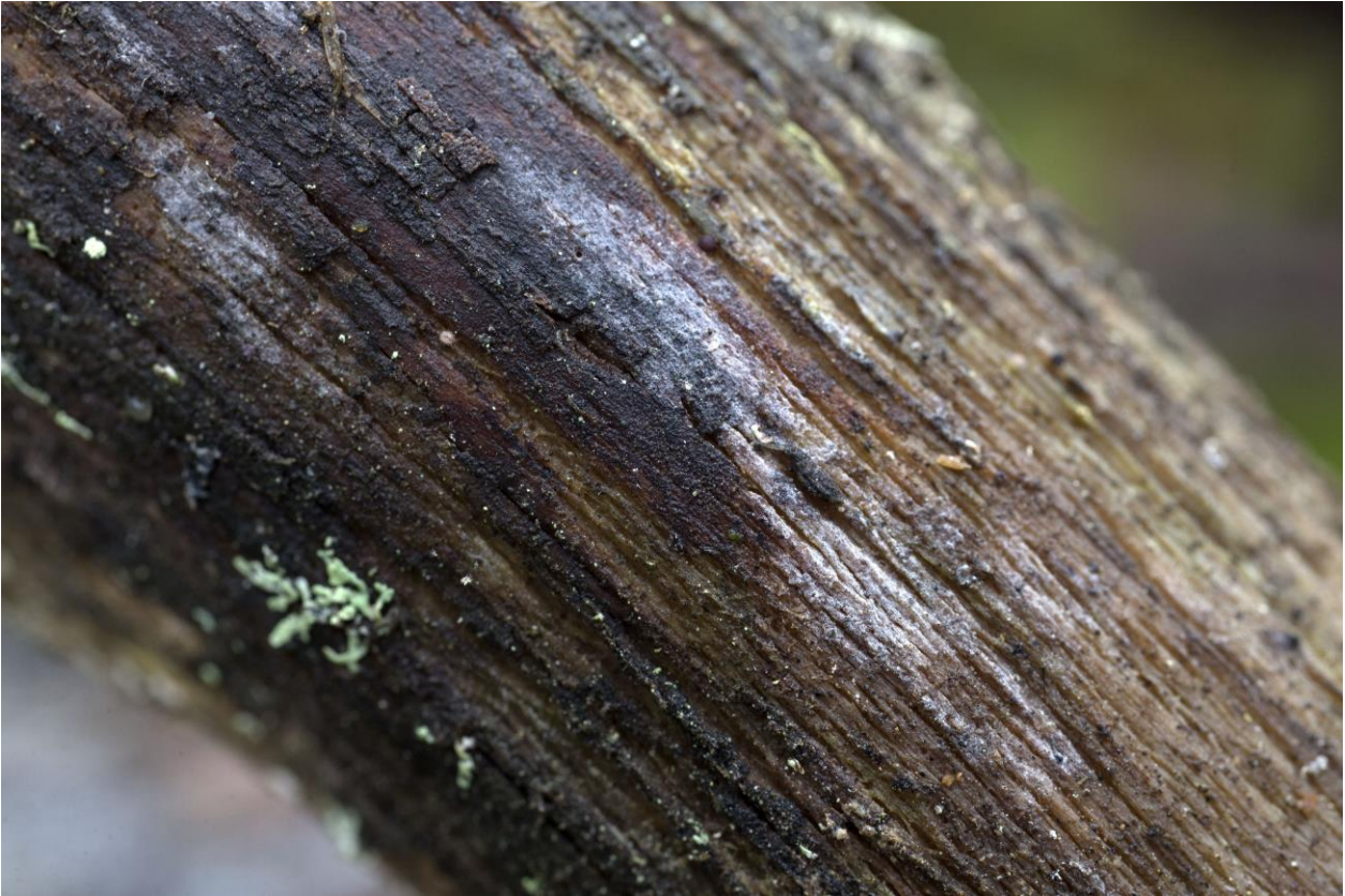
Figure 25 – Tulasnella allantospora in Suomussalmi (TH 20170015).

New to Southern boreal, Lake District (2b) and Middle boreal, Southwestern Lapland (3c).