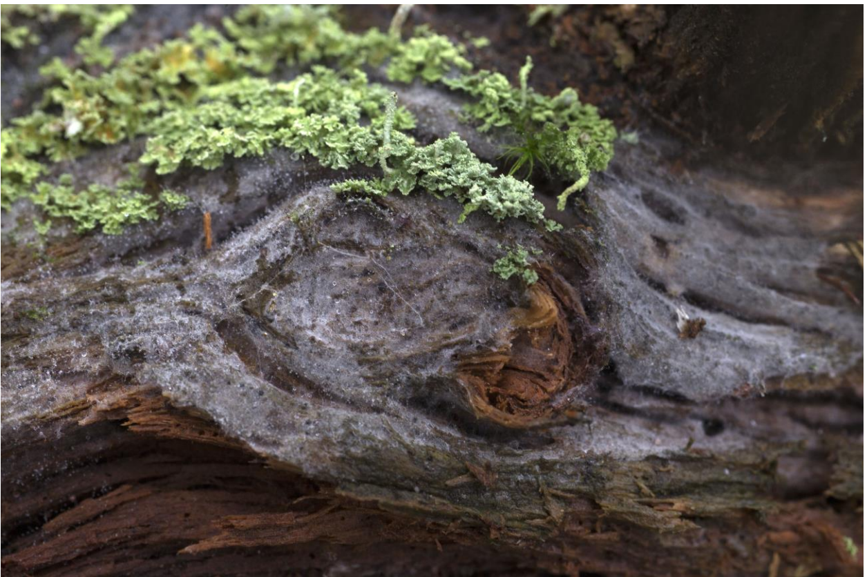
Figure 26 – Tulasnella brinkmannii s.l. in Suomussalmi (TH 20170002). Photo: Teppo Helo