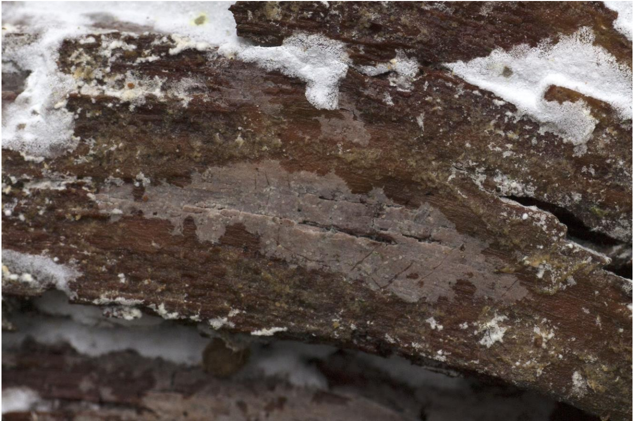
Figure 20 – Suillosporium cystidiatum in Puolanka (TH 20170004) with Tylosporium fibrillosum .

det. HK. This latter record has previously reported from false subzone (3b) (Kunttu et al. 2016a), but it should be 4a.