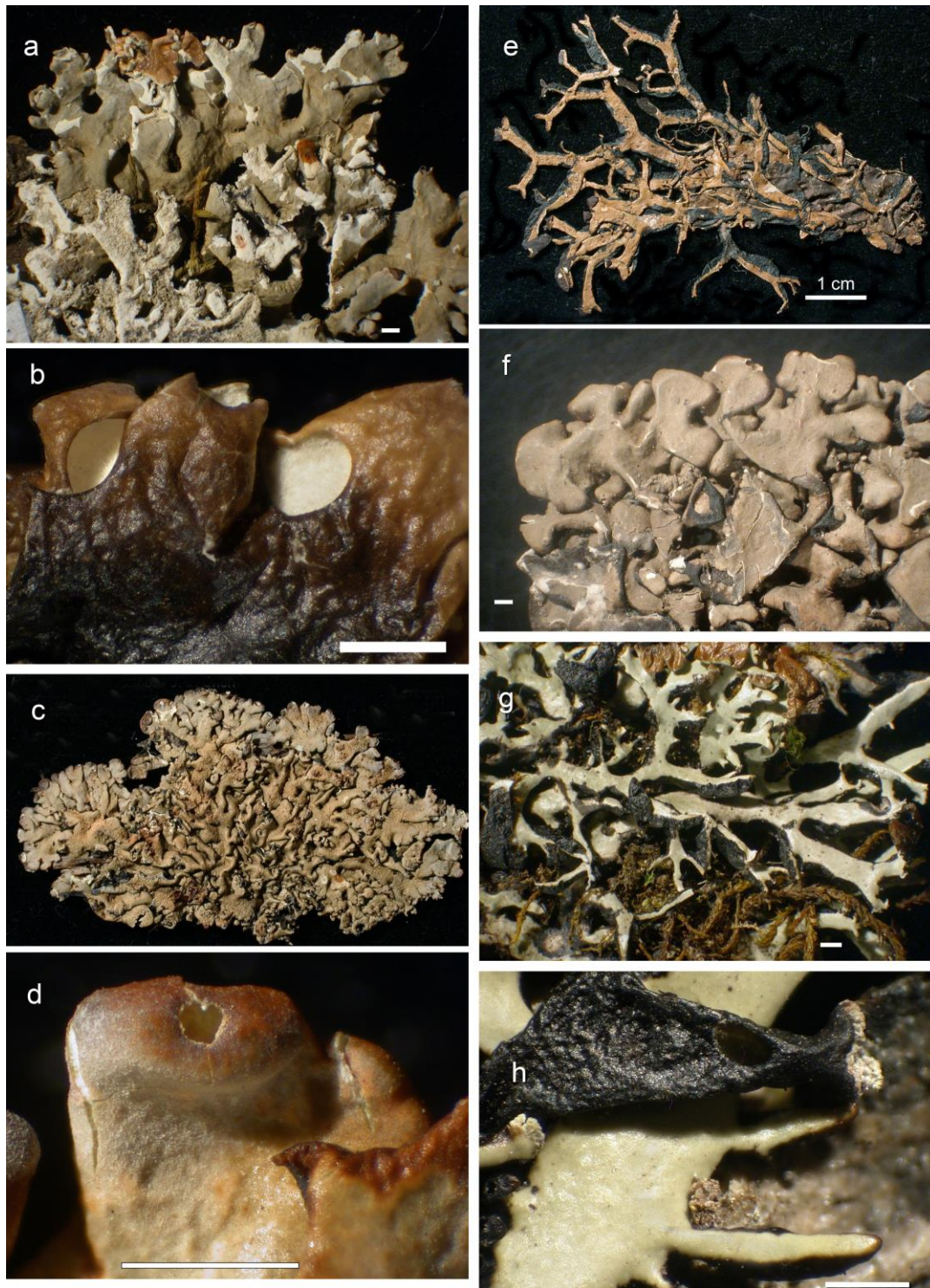
Fig. 14 – a Hypogymnia subfarinacea , habit (holotype, X. Y. Wang 10582). b H. subfarinacea , lower surface with perforations (X. L. Wei 11143). c H. subpruinosa , habit (holotype, X. Y. Wang 7094). d H. subpruinosa , lobe tips and perforation (X. Y. Wang 7094). e H. thomsoniana , habit (type, Thomson 277, H-Nyl) f. H. thomsoniana , short-lobed "pseudohypotrypa" morph (Awasthi 67-498). g H. vittata , lobes (McCune 25623). h H. vittata , lobes showing soralia, narrow adventitious lobes, and perforations (McCune 26705). Scale bars 1 mm unless otherwise indicated.

25623, 25661 (OSC); Wei Xi County, Ye Zhi Village, Ba Di, 27.72°N 99.05°E, 3500-3800 m, L. S. Wang 82-196, 82-213F, 82-1817 (KUN); Yi Liang County, small meadow, 27.62°N 104.0°E, 1700 m, L. S. Wang 96-16649 (KUN); Zhongdian County, Daxue Shan, 28.503°N 99.817°E, 3800 m, L. S. Wang 00-19824b, 00-19850 (KUN); Zhongdian County, Wengshuei Village, Daxue Shan,