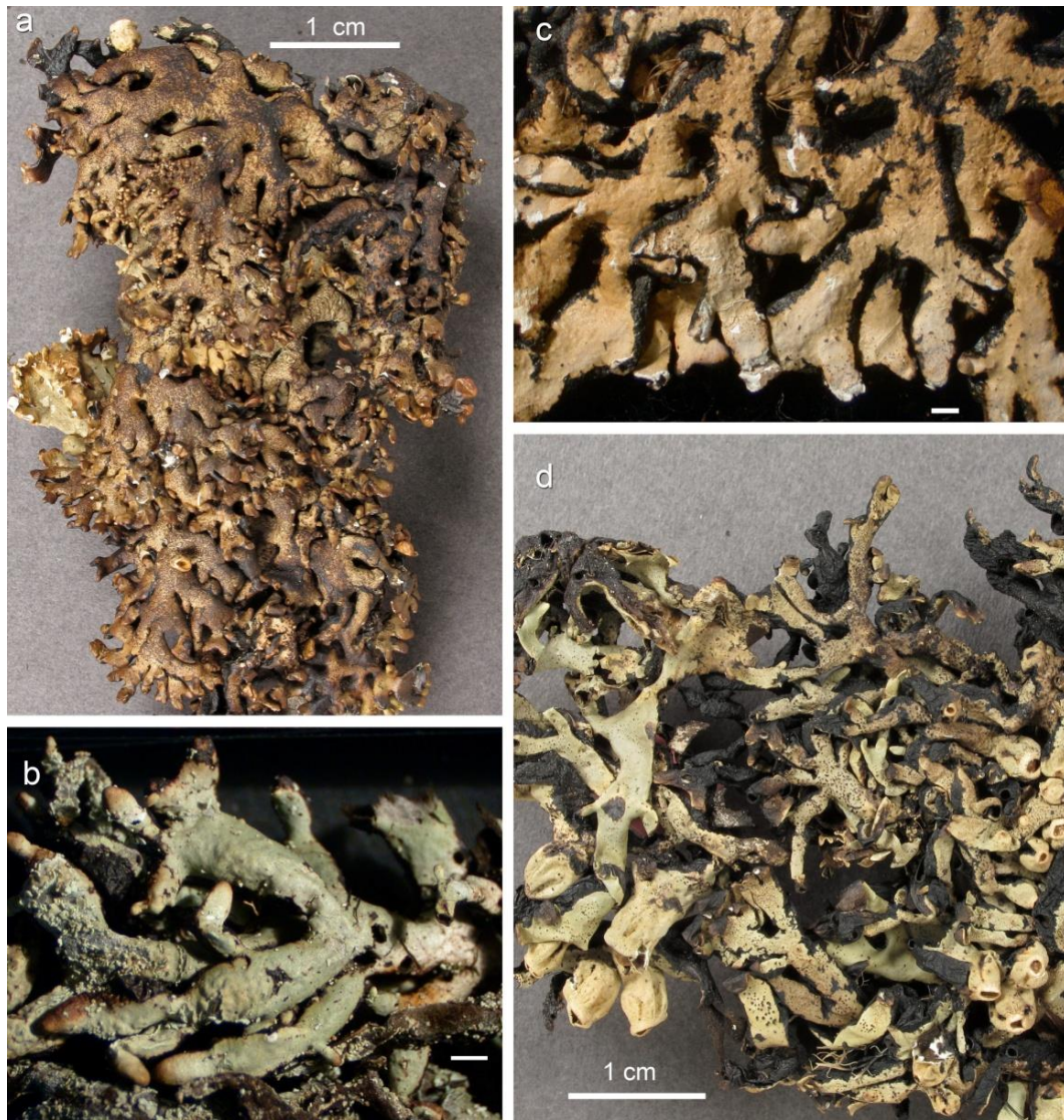
Fig. 6 – a Hypogymnia laccata , habit (McCune 25554). b H. laxa , lobes (McCune 25532). c H. lijiangensis , lobes (holotype, X. Y. Wang 6991). d H. macrospora , habit (L. S. Wang 00-20317). Scale bars 1 mm unless otherwise indicated.

Hypogymnia subvittata (J.D.Zhao) J.C.Wei, Enum. Lichens in China, p. 118. 1991.