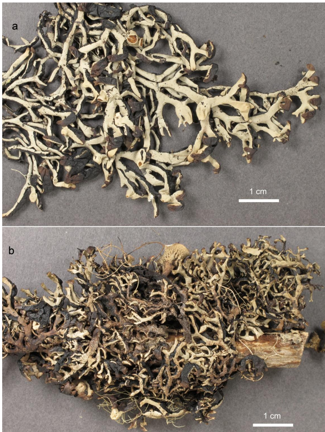
Fig. 9 – Hypogymnia pendula . a Habit (McCune 26711). b Habit of narrow-lobed morph (McCune 26712). Scale bars 1 mm unless otherwise indicated.

Description – Thallus appressed to suberect, to 6(15) cm broad; branching isotomic dichotomous to irregular, budding occasional; upper surface smooth to occasionally rugose, white, pale gray to greenish gray, solarizing to blackish, not or rarely dark mottled, black border seldom visible from above; lobes contiguous to imbricate or \pm separate, 0.5-2.5(4) mm broad; lobe tips and axils imperforate or irregularly torn at sites of incipient soralia; medulla hollow; ceiling of cavity white or dark, floor of cavity dark; lower surface black, rarely perforate; soredia on the inside of the burst lobe tips, developing labriform soralia; isidia absent, lobules rare; apothecia rare, substipitate to stipitate, to 2(4) mm in diam; stipe funnel-shaped, hollow; disc brown; thalline exciple becoming sorediate; hypothecium weakly POL+, stronger at the base; ascospores ellipsoid, 6.1\text{--}7.9 \times 4.5\text{--}5.6 \mu\text{m} ; pycnidia occasional; spermatia narrowly cylindrical to weakly bifusiform, 5.5\text{--}7.1 \times 0.9\text{--}1.3 \mu\text{m} .