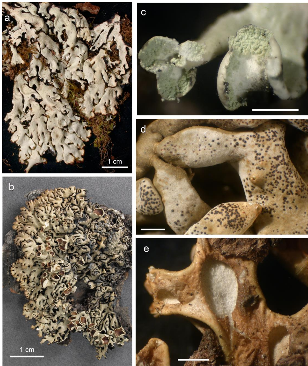
Fig. 7 – a Hypogymnia magnifica , habit (McCune 26718). b H. metaphysodes , habit, (McCune 26058, near type locality in Japan). c H. physodes , soralia (McCune 31241; Canada: British Columbia). d H. pruinoidea , pruinose lobes (holotype, Wei 1728). e H. pruinoidea , perforations in lower surface, Wei 1727). Scale bars 1 mm unless otherwise indicated.

Chemistry – Atranorin (trace to major), physodic (major), 2'- O -methylphysodic (minor), and vittatic (minor accessory, usually present) acids; cortex K + yellow, P + pale yellow, C - , KC - (except the pink-orange medullary reaction showing through); medulla K - , C - , KC + orange red, P - .