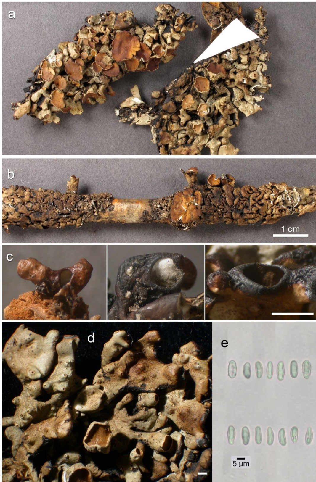
Fig. 13 – Hypogymnia tenuispora . a Habit (McCune 25572). b Habit (McCune 25573). c Perforations (McCune 25572). d Lobes (McCune 25572). e Ascospores (McCune 25573). Scale bars 1 mm unless otherwise indicated.

(KUN); Yulong Shan, Yu Feng Temple, 26.97°N 100.20°E, 2500 m, Moberg 32217 (UPS); Luquan County, Jiaozixue Mt., 26.083°N 102.133°E, 3700-4000 m, L. S. Wang 92-12928, 92-13117, 93-1357400-20367 (KUN); Jiaozixue Mt., 26.100°N 102.867°E, 3500-3700 m, McCune