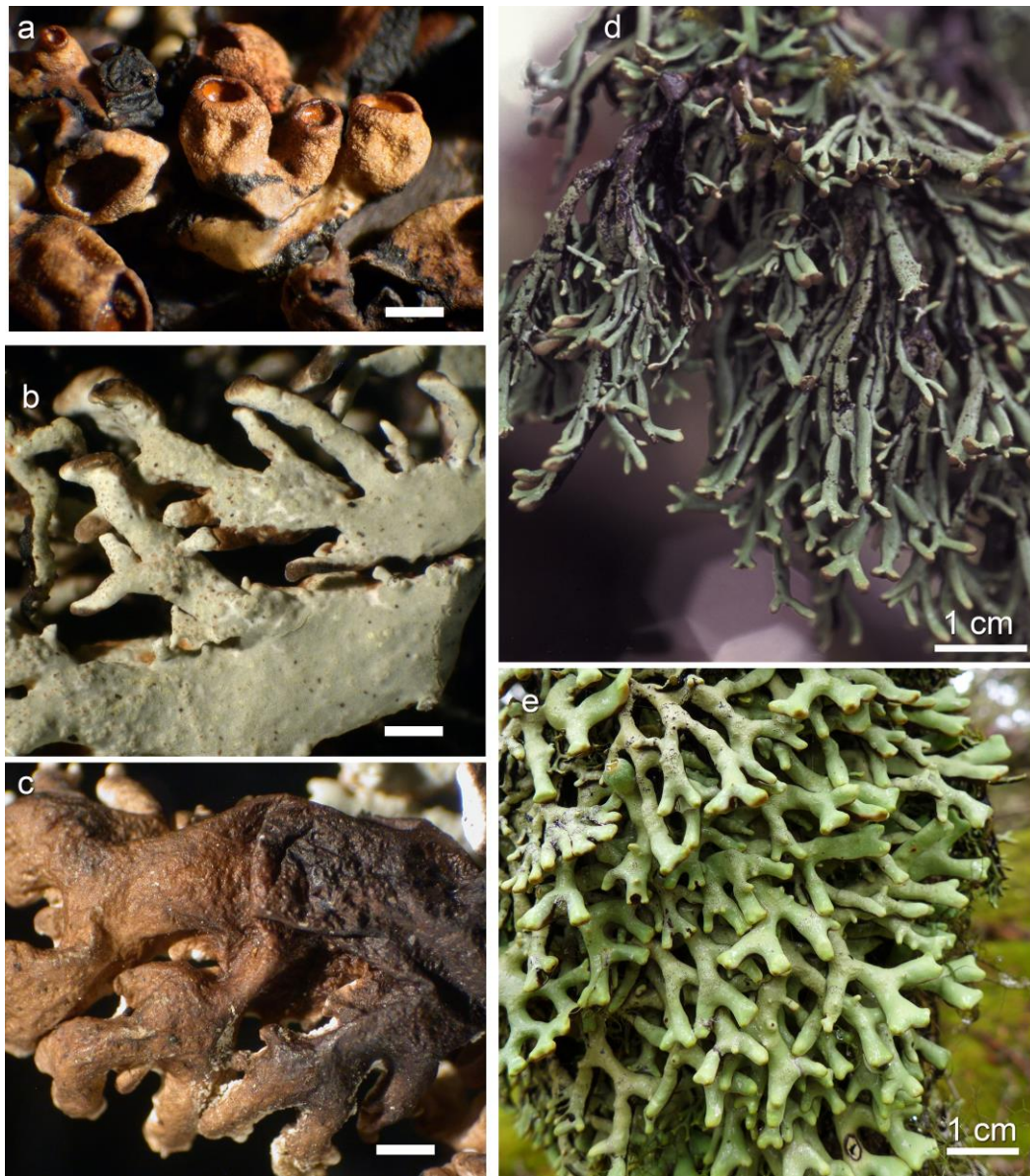
Fig. 4 – a Hypogymnia congesta apothecia (L. S. Wang 82-415). b H. delavayi lobes (McCune 26736). c H. delavayi lower surface (McCune 26736; holes not visible in this view). d H. diffractaica , habit (L. S. Wang 00-20411). e H. flavida , habit (L. S. Wang 13-38786). Scale bars 1 mm unless otherwise indicated.

Chemistry – Atranorin, physodic acid (major), physodalic acid (major, giving a P+ medullary reaction, but sometimes rather weak or absent by TLC and giving a P- medulla), and protocetraric acid (minor with physodalic acid), 2'- O -methylphysodic (minor, accessory), rarely with 3-hydroxyphyodic acid; cortex K+ yellow, C-, KC-, P+ pale yellow; medulla K-, rarely K+ reddish brown, C-, KC+ orange or red, P+ deep yellow to orange or red, rarely P-.