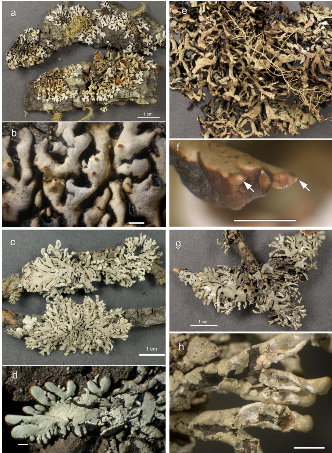
Fig. 10 – a. Hypogymnia pruinosa , habit (McCune 26750). b. H. pruinosa , lobes (McCune 26739). c. H. pseudobitteriana , habit (McCune 26737). d. H. pseudobitteriana , lobes (McCune 26829). e. H. pseudocyphellata , habit (L. S. Wang 00-19814). f. H. pseudocyphellata , lobe tips with pseudocyphellae (arrows) and axillary rimmed hole (L. S. Wang 00-19814). g. H. pseudophysodes , habit (McCune 26057). h. H. pseudophysodes , lobes (McCune 26057). Scale bars 1 mm unless otherwise indicated.