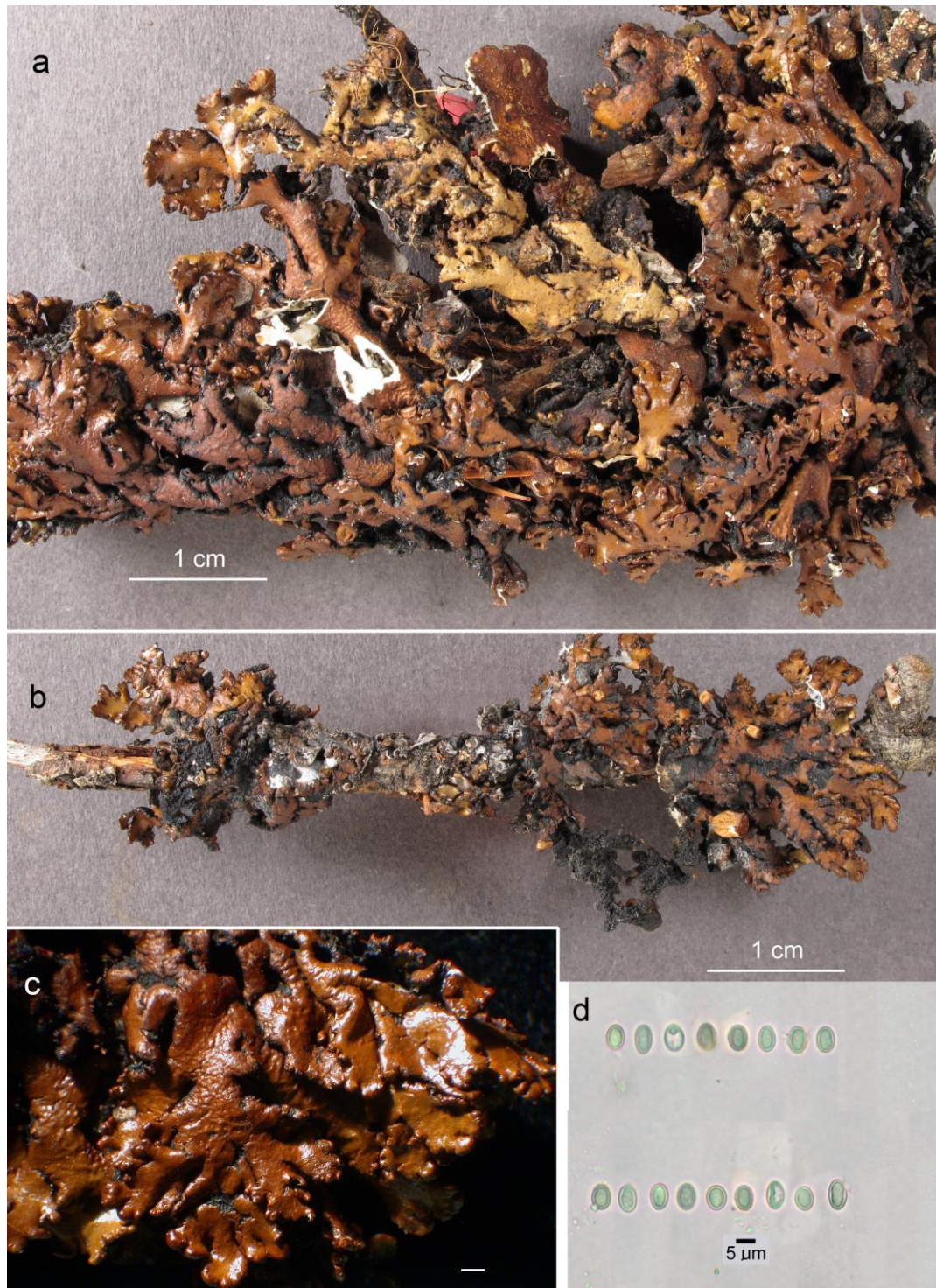
Fig. 8 – Hypogymnia nitida . a Habit (Wang 93-13495). b Habit (Xing 1952b). c Lobes (Wang 93-13495; scale bar 1 mm). d Ascospores (Wang 83-1793).

and absence of perforations are also reminiscent of H. austerodes . That species and its close relative H. bitteri are, however, sorediate and do not normally develop separate lobes, nor do they become subpendant. The circumboreal H. subobscura is similar in its brown coloration, and approaches H. nitida in its slightly more open branching than H. austerodes and H. bitteri , but differs from H. nitida in having frequent but small perforations in the lobe tips.