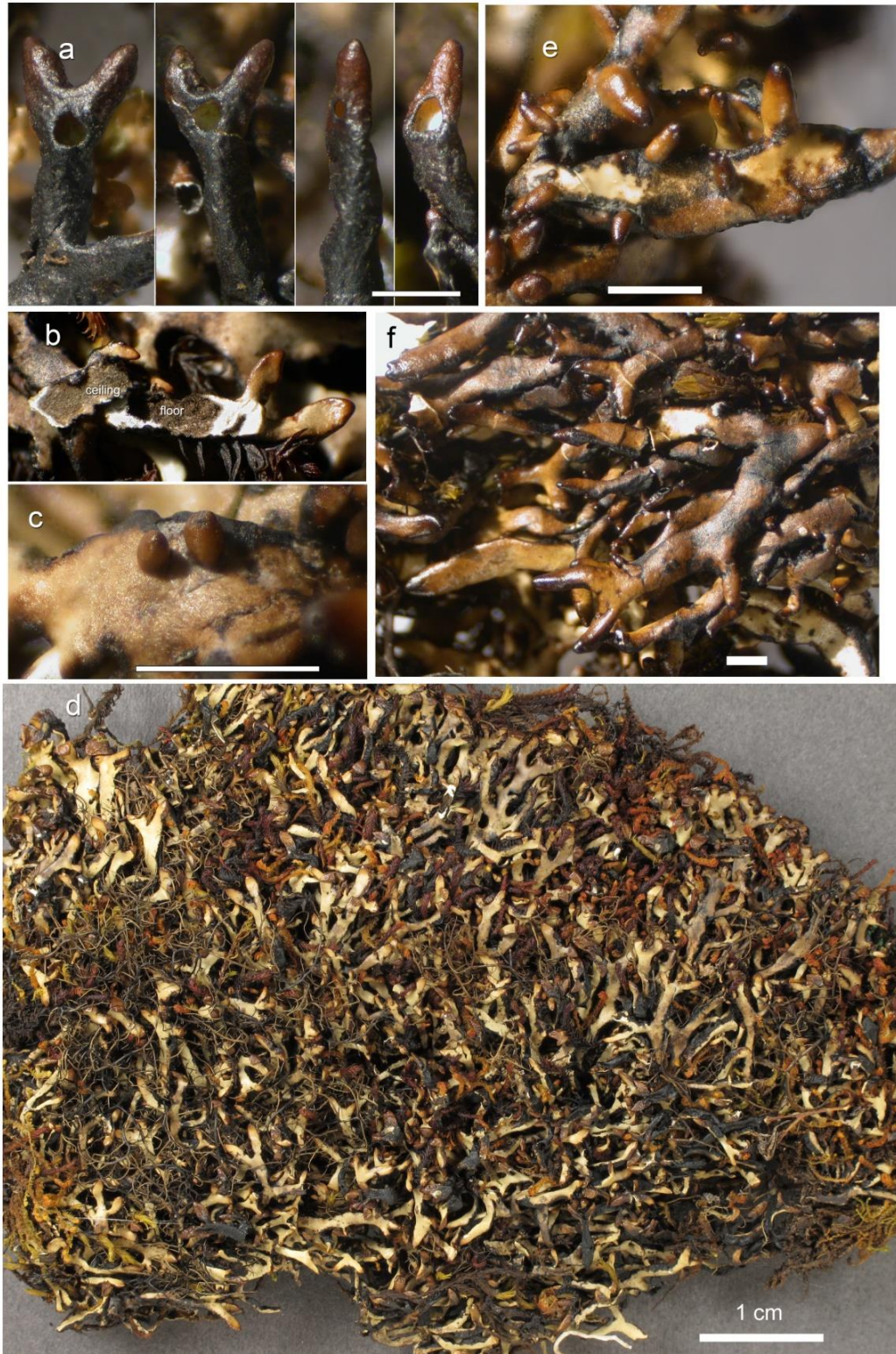
Fig. 12 – Hypogymnia saxicola . a Perforations (McCune 25561). b Lobe cavity (McCune 25644). c Laminal budding (Wang 92-1293). d. Habit (McCune 25644). e. Marginal budding (Wang 92-1293). f Lobes (Wang 92-1293). Scale bars 1 mm unless otherwise indicated.

Small individuals resemble H. pseudophysodes in the appressed habit and the combination of schizidia and soredia, often flaking off to expose the blackish medulla, but the lobe width of H. sinica is typically twice that of H. pseudophysodes . While both species are perforate below, the holes in H. sinica are large and gaping, similar to H. hypotrypa and H. flavida , while those in H. pseudophysodes are usually easily found but more moderate in size.