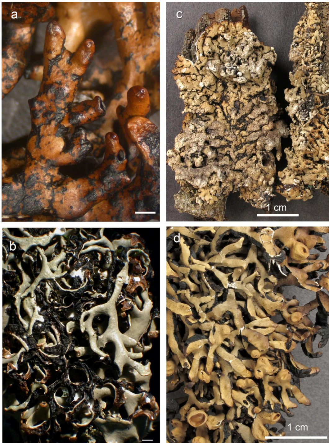
Fig 2 – a Hypogymnia alpina , lobes (L. S. Wang 85-0262). b H. arcuata , habit (McCune 24855). c H. austerodes , habit (L. S. Wang 01-20578). d H. bulbosa , habit (Ahti 46473). Scale bars 1 mm unless otherwise indicated.

Synopsis – Lobes with abundant adventitious budding, strongly constricted at base and often shaped like a broadly curved prow of a boat; holes rimmed, mainly terminal and axillary; thallus usually P+ but sometimes P-.