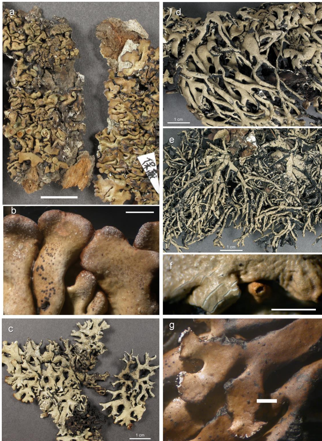
Fig. 11 – a Hypogymnia pseudopruinosa , habit (X. L. Wei 11143). b H. pseudopruinosa , lobe tips (X. L. Wei 11143). c H. sinica , habit (McCune 25523). d H. stricta , habit (L. S. Wang 01-20658). e H. stricta , habit (L. S. Wang 01-20659) f H. stricta , cracks in upper cortex (L. S. Wang 83-1806). g H. subarticulata , lobes (McCune 25598). Scale bars 1 mm unless otherwise indicated.

Notes – H. sinica was treated as a synonym of the esorediate Hypogymnia pseudohypotrypa by Wei (1991), while McCune & Obermayer (2001) accepted H. sinica as a distinct, sorediate species.