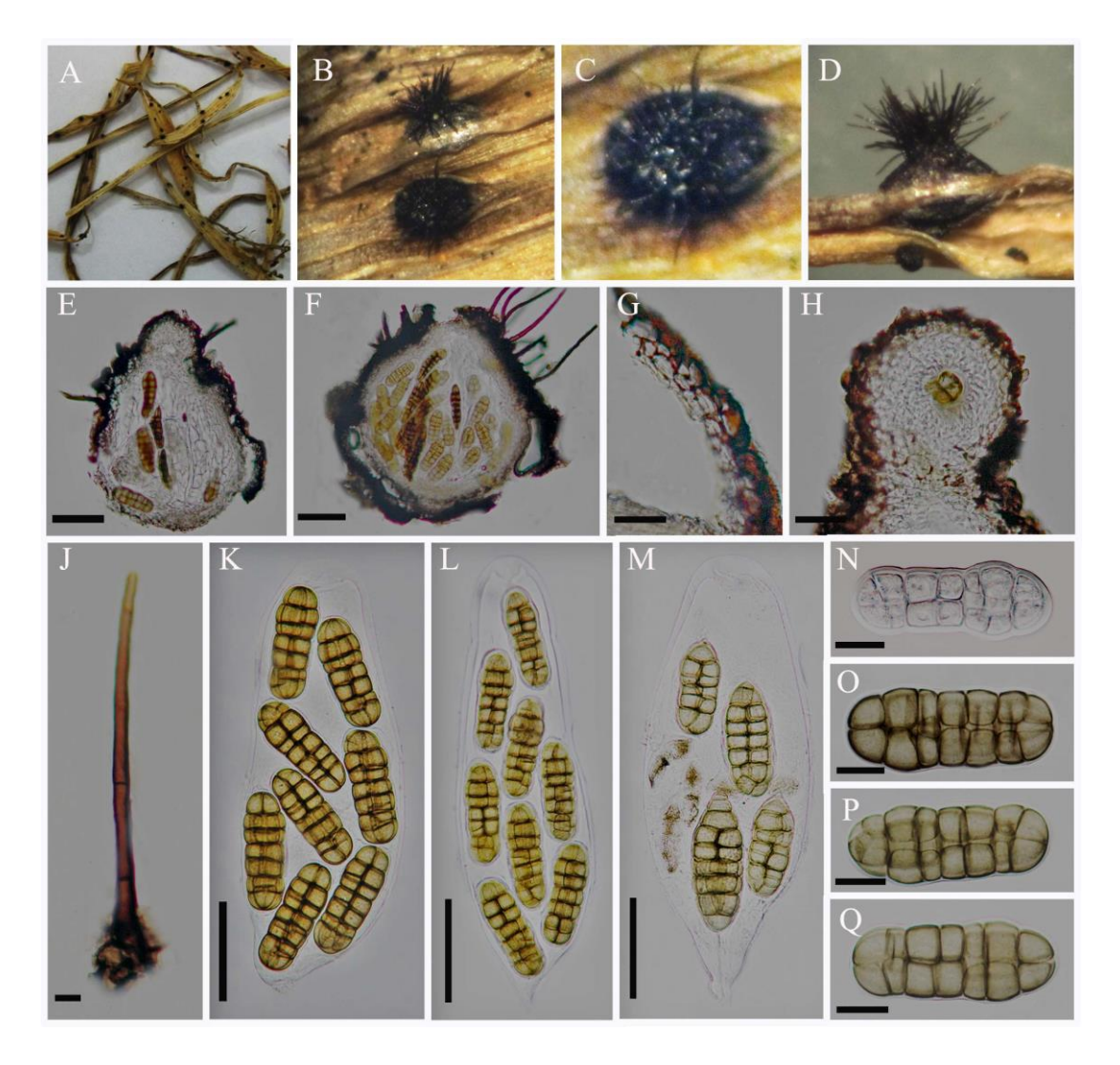
Fig. 3 – Pyrenophora phaeocomes (neotype) A, B. Ascomata on host specimen. C. Close up of ascoma. D. Side view of ascoma with neck covered with setae. E, F. Sections of ascomata. G. Section of peridium. H. Ostiole, with central periphyses. J. Light brown seta. K-M. Asci with 8 ascospores, distinct ocular chamber and apical ring. N-Q. Mature and immature muriform ascospores. Scale bars: E-F=200 \ \mu m , G=30 \ \mu m , H=80 \ \mu m , J=50 \ \mu m , K-M=50 \ \mu m , N-Q=15 \ \mu m .