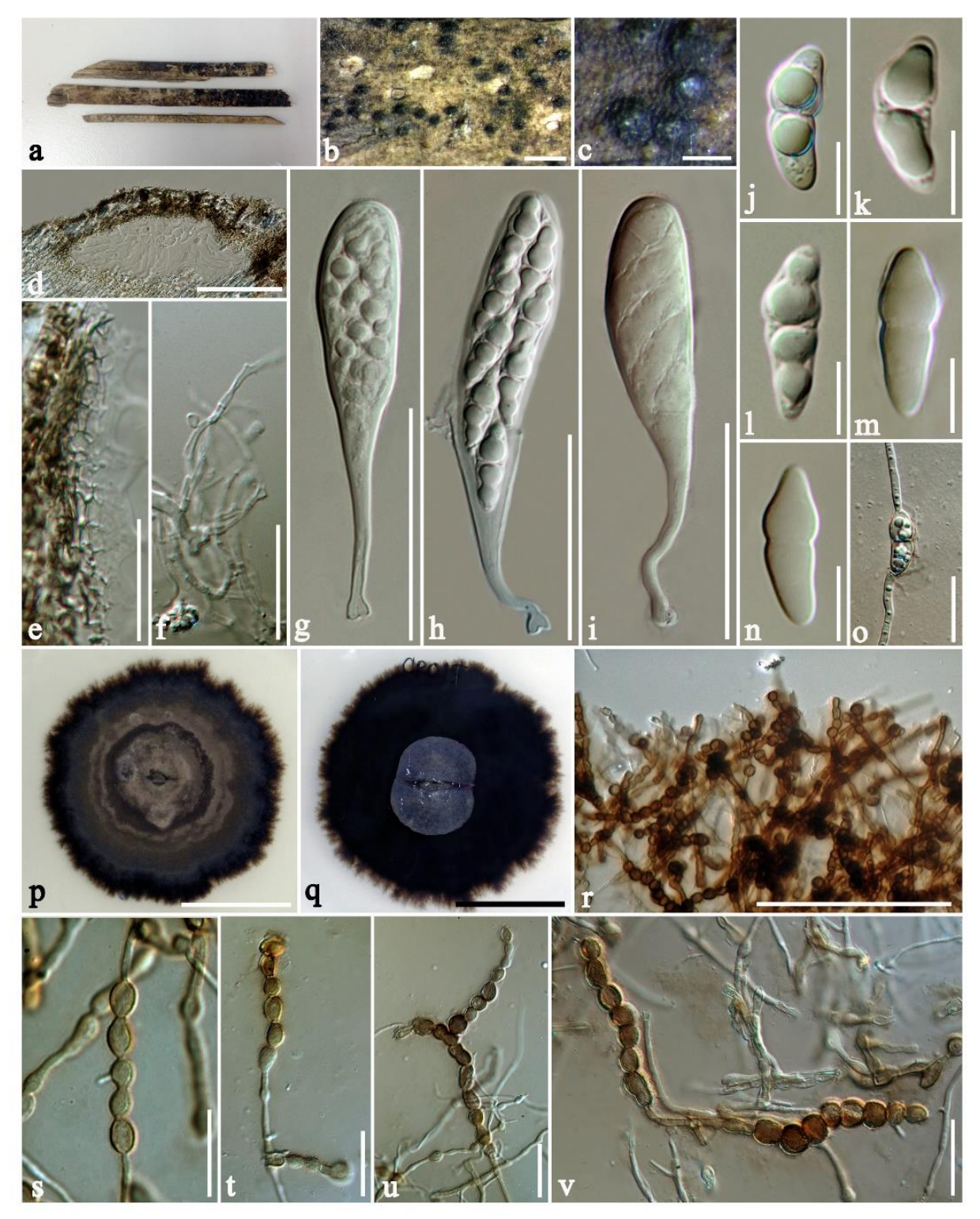
Fig. 3 – Longipedicellata aptrootii (MFLU 16–0032, reference specimen ). a Bambusodeae sp. habit. b , c Appearance of ascomata on the host surface. d Vertical section of ascoma. e Section of peridium comprising cells of textura prismatica . f Pseudoparaphyses. g – i Asci with long pedicels. j – n Development stages of ascospores. o Germinated ascospore. p , q Culture characters on PDA. r Close up of culture. s Chlamydospores. t – v Chlamydospore-like conidia in chains. – Bars: b = 500 µm, c = 200 µm, d = 100 µm, e–f, o, s–v = 20 µm, g–i = 50 µm, j–n = 10 µm, p–q = 20 cm.

with Pseudoxylomyces elegans (Goh et al.) Kaz. Tanaka & K. Hiray. basal to Latoruaceae (85 % ML/0.97 PP). The L. aptrootii strain (MFLUCC 16–0384) formed chlamydospore-like structures in culture, and produced conidia in chains at the apex which were similar to Pseudoxylomyces elegans . Pseudoxylomyces elegans also produces chlamydospores in chains at the apex of hypha (Goh et al. 1997).