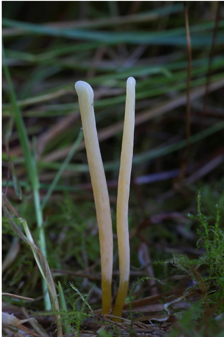
Fig. 3 – Clavaria flavipes in Sotkamo (TH 150007).