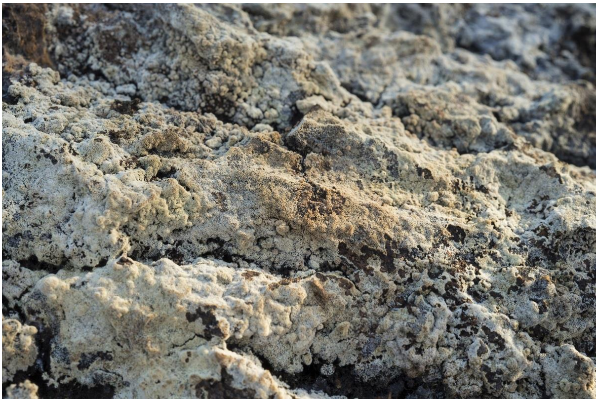
Fig. 7 – Thanatephorus fusisporus coll. on fallen trunk of Populus tremula in Suomussalmi (PH 2948).

New to Middle boreal, Northern Carelia – Kainuu (3b).