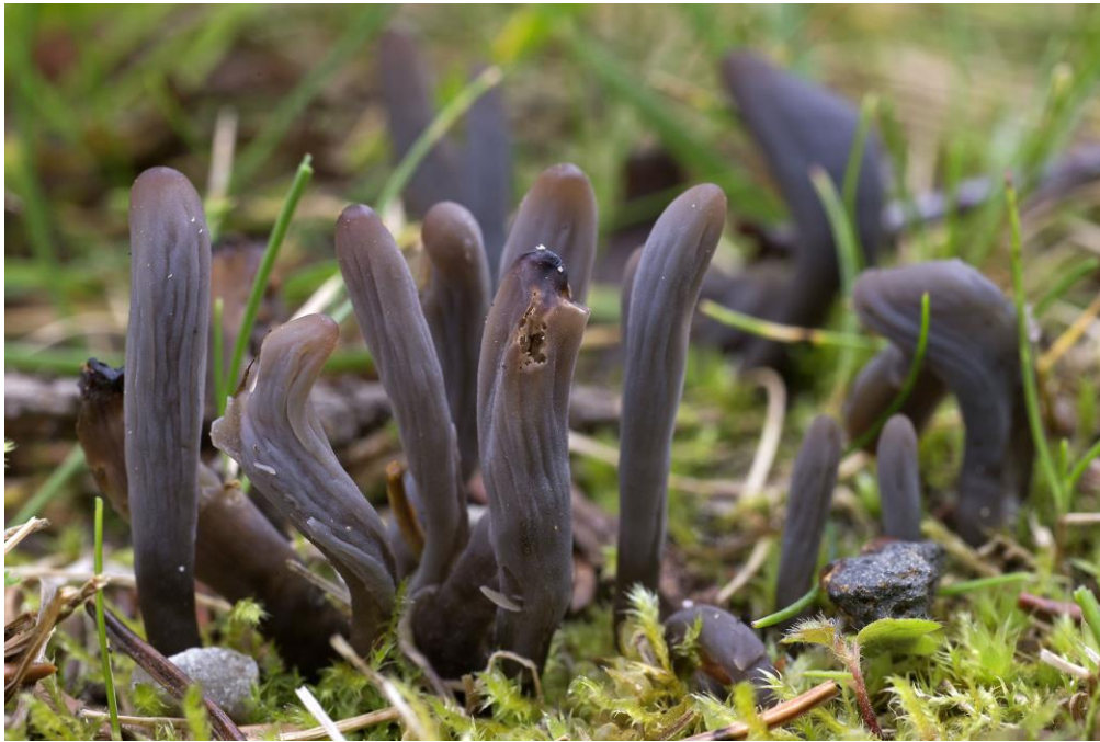
Fig. 4 – Clavaria greletii in Kajaani (TH 150001).