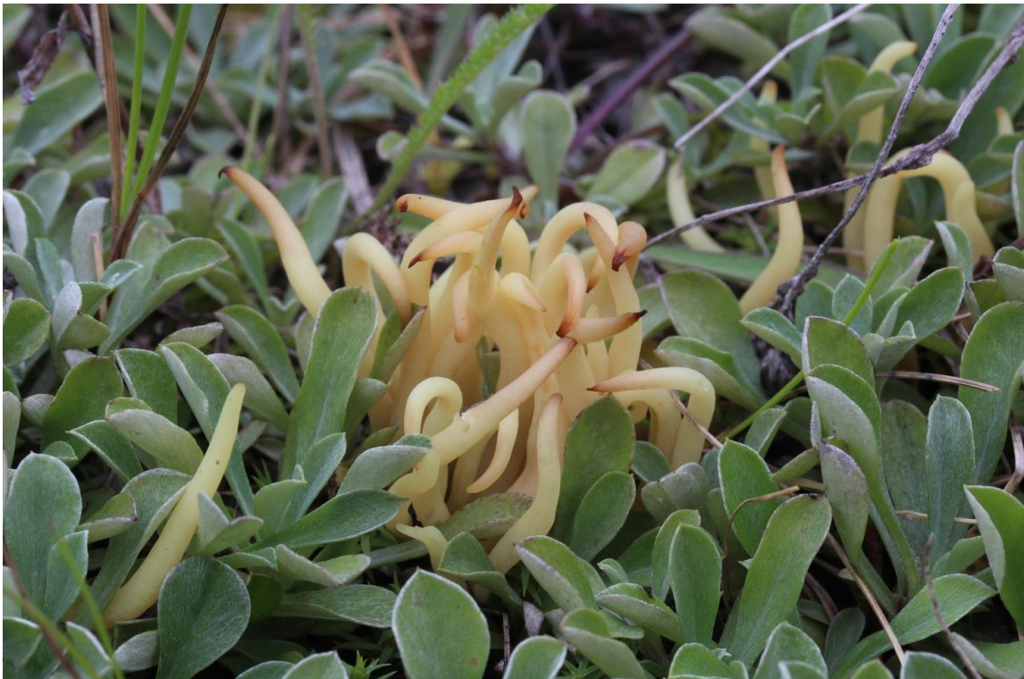
Fig. 2 – Clavaria amoenoides in Kemijärvi (TK 1859).

New to Northern boreal, North Ostrobothnia (4b).