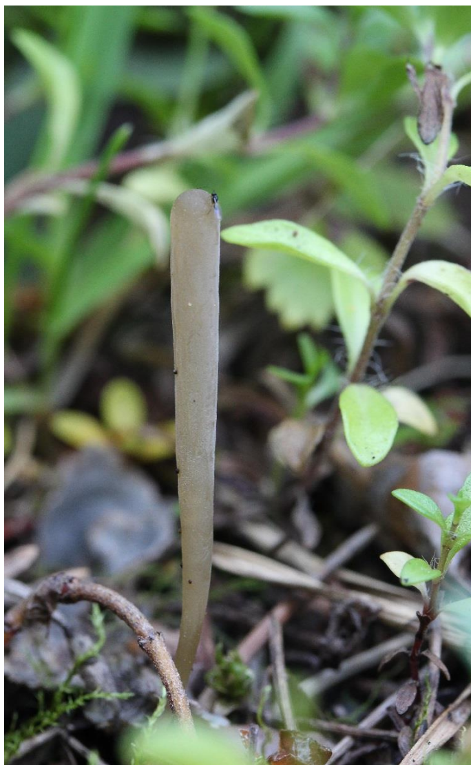
Fig. 5 – Clavaria tenuipes in Rovaniemi (TK 1871).