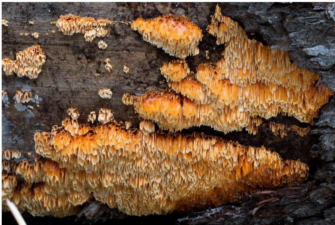
Fig. 6 – Pycnoporellus alboluteus on fallen trunk of Picea abies in Puolanka (TH 150013).

New to Middle Boreal, Northern Carelia – Kainuu (3b). This is the eighth locality in Finland. Previous localities are in Tervola (3c), Rovaniemi (3c), Pudasjärvi (4a), Taivalkoski (4a), and Kemijärvi (4b), Rovaniemi (4b) (Kotiranta et al. 2009, Kunttu et al. 2015). The number of occupied trunks is much higher. Substrata: Picea abies , Alnus incana and Populus tremula , almost solely on trees decayed by Fomitopsis pinicola . Endangered.