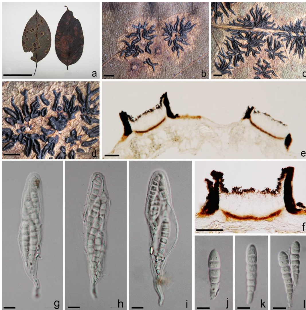
Fig. 1 – Aldona stella-nigra (M! 176025, isotype). a Spots on lower surface of leaves. b–d Black ascomata with longitudinal openings. e, f Section of ascomata. g–i Clavate to cylindrical asci containing eight ascospores. j–l Hyaline ascospores with 4-7 septa. – Bars: a = 50 mm, b–d = 1 mm, e, f = 100 \mu m, g–l = 10 \mu m.

Ascospores multiseriate, ellipsoid to fusiform, muriform, hyaline, with up to 8 transverse and longitudinal septa, lower cell narrow and longer, caudiform, with a mucilaginous sheath. Spermatogonia solitary to gregarious, sub-immersed, black and shiny, carbonaceous, globose to irregular, mostly growing around the central of grayish-white spot. Wall of Spermatogonia 1-layered, composed of thick-walled colorless cells of textura angularis . Spermatophores reduced to Spermatogenous cells. Spermatogenous cells hyaline, enteroblastic, phialidic, determinate, arising from basal cells of inner peridium wall. Spermatia aseptate, fusiform to cylindrical, hyaline, tapering at both ends, smooth-walled.