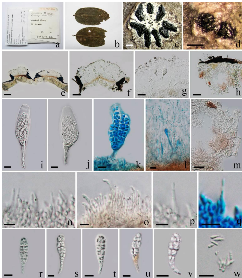
Fig. 4 – Aldonata pterocarpi (K! IMI 322833, holotype). a Herbarium labels. b Herbarium material. c Ascomata on host surface. d Spermatogonia on host surface. e–g Section of ascomata. h Section of spermatogonium. i–k Asci with ascospores, note k mounted in cotton blue reagent. l Hamathecium. m Wall of spermatogonium. n–q Spermatogenous cells. r–v Ascospores, note the long and narrow ends. w Spermatia – Bars: c = 500 \mu m, d, e = 200 \mu m, f = 100 \mu m, g, h = 50 \mu m, m = 20 \mu m, i–l, r–v = 10 \mu m, n–q, w = 5 \mu m.

and lower wall thin, not well developed, sometimes absent. Hamathecium 2–5 \mu m broad with transverse septa, filamentous pseudoparaphyses, long, colourless, branched, and verrucose at the tips. Young asci variable in shape, cylindric-clavate to clavate, with a subapical chamber visible before spore delimitation. Mature Asci 72–87 \times 11–24 \mu m ( \bar{x} = 66 \times 16 \mu m, n = 10), 6–8-spored, bitunicate, cylindrical to clavate, thick-walled particularly in the upper part, short-pedicellate, thin-walled, embedded in mucilage, not changing color in IKI. Ascospores 11–20 \times 6–8 \mu m ( \bar{x} = 16 \times 6 \mu m, n = 10), uniseriate or biseriata, ellipsoid to fusiform or narrowly ovoid, verrucose, usually two-celled, normally unequal, upper cell wider, lower cell narrow and longer, transverse septa obviously shrink, hyaline and then becoming light brown when spores are senescent, with an oil drop, the apex rounded and the base obtuse, the mucilaginous sheath degenerating at maturity. Asexual morph – Undetermined.