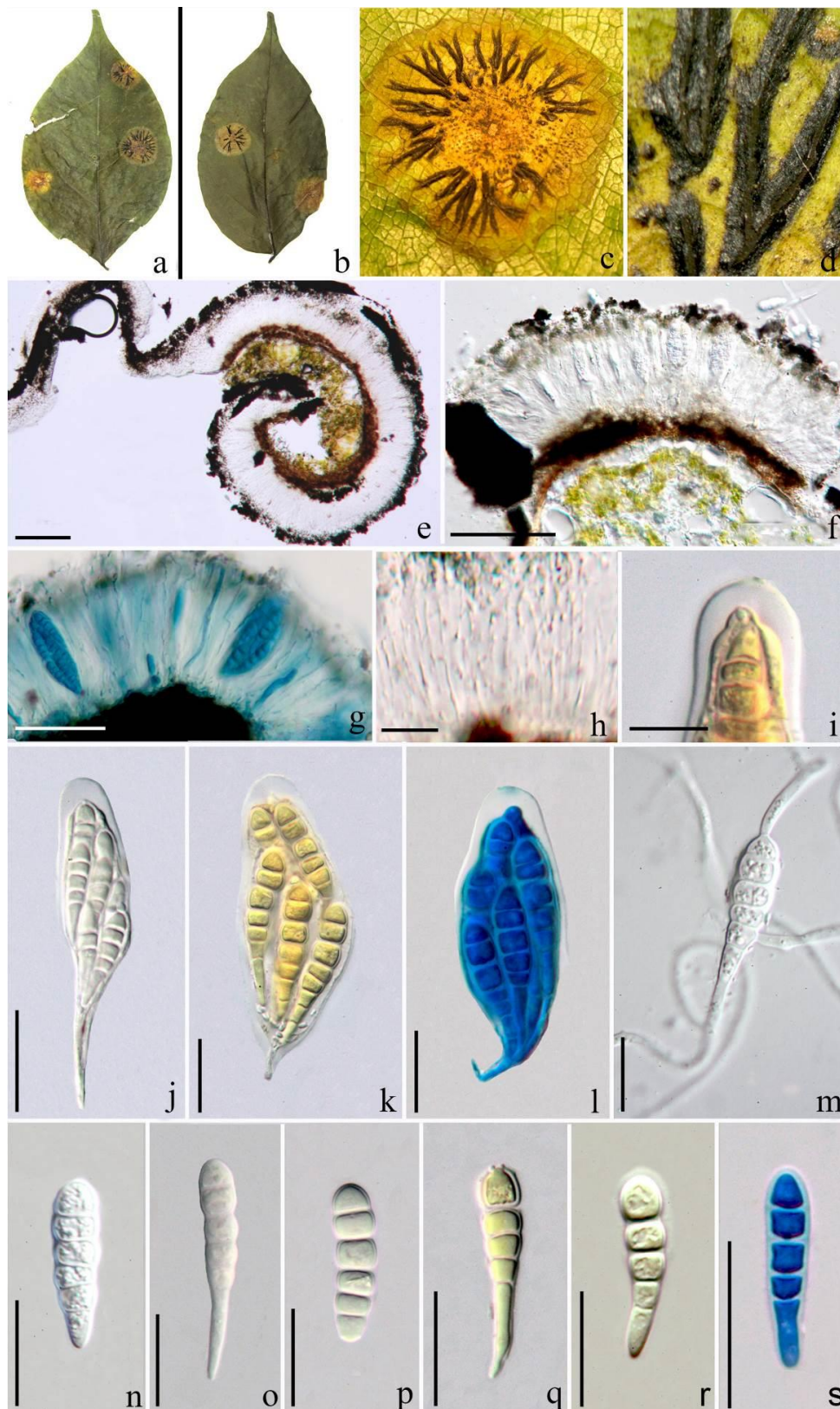
Fig. 2 – Aldona stella-nigra (MFLU14-0011). a, b Colony on lower side of living leaves. c, d Ascomata on yellowish leaf spot. e, f Vertical section of ascoma. g Asci arrangement in gelatinous matrix. h Hamathecium. i Ascus tip, note ocular chamber in Melzer's reagent. j–l Asci with ascospores, note k mounted in Melzer's reagent and l mounted in cotton blue reagent. m Germinating ascospore, n–s Ascospores, note the long and narrow ends, q and s mounted in Melzer's reagent. s mounted in cotton blue reagent. – Bars: e, f = 100 \mu m, g = 50 \mu m, i = 10 \mu m, h, j–s = 20 \mu m.