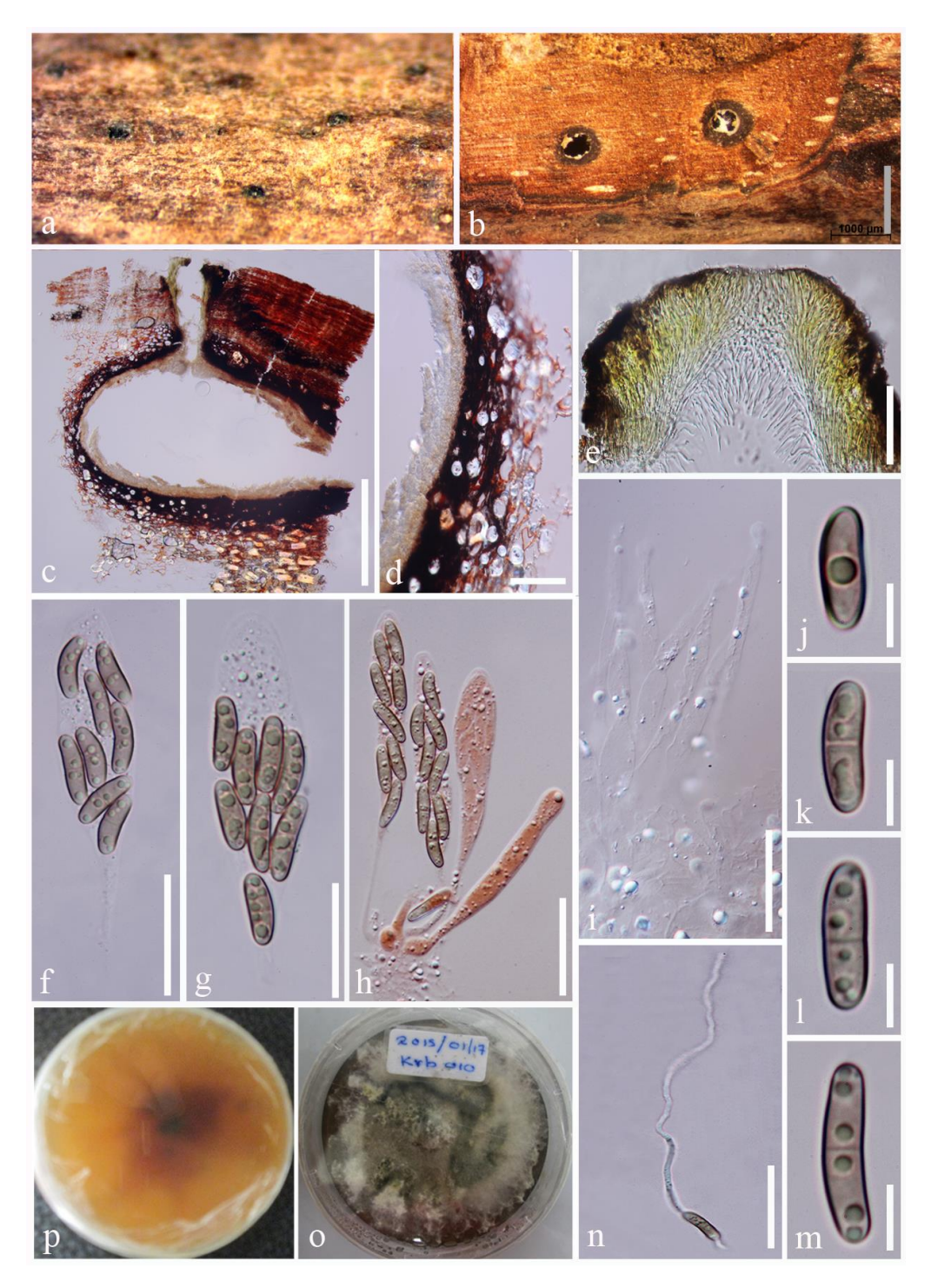
Fig. 2 – Halodiatrype salinicola (MFLU 15-0179, holotype ). a. Appearance of ascomata opening on host. b. Transverse section of ascoma on the host. c. Vertical section through ascoma. d. Peridium. e. Section through neck with periphyses. Note the yellow colouration. f, g Asci. h. Asci stained with congo red. i. Paraphyses. j–m. Ascospores. n. Germinting spore. o, p. Culture on MEA ( o = from above, p = from below). Scale bars: c = 100 \mu m , d = 50 \mu m , e = 20 \mu m , f-i = 10 \mu m , j-n = 5 \mu m .

Depending on the stromatal morphology, and the nature of asci and ascospores described by Vasilyeva & Stephenson (2006), our new strains mostly resembled the type of Cryptosphaeria ; Cryptosphaeria eunomia . The novel taxa morphologically best fit Cryptosphaeria . However, phylogenetic analyses of combined ITS and \beta -TUB sequence data, indicate that the novel taxa has no affinity with Cryptosphaeria species including; C. eunomia , C. ligniota , C. pullmanensis and C. subcutanea .