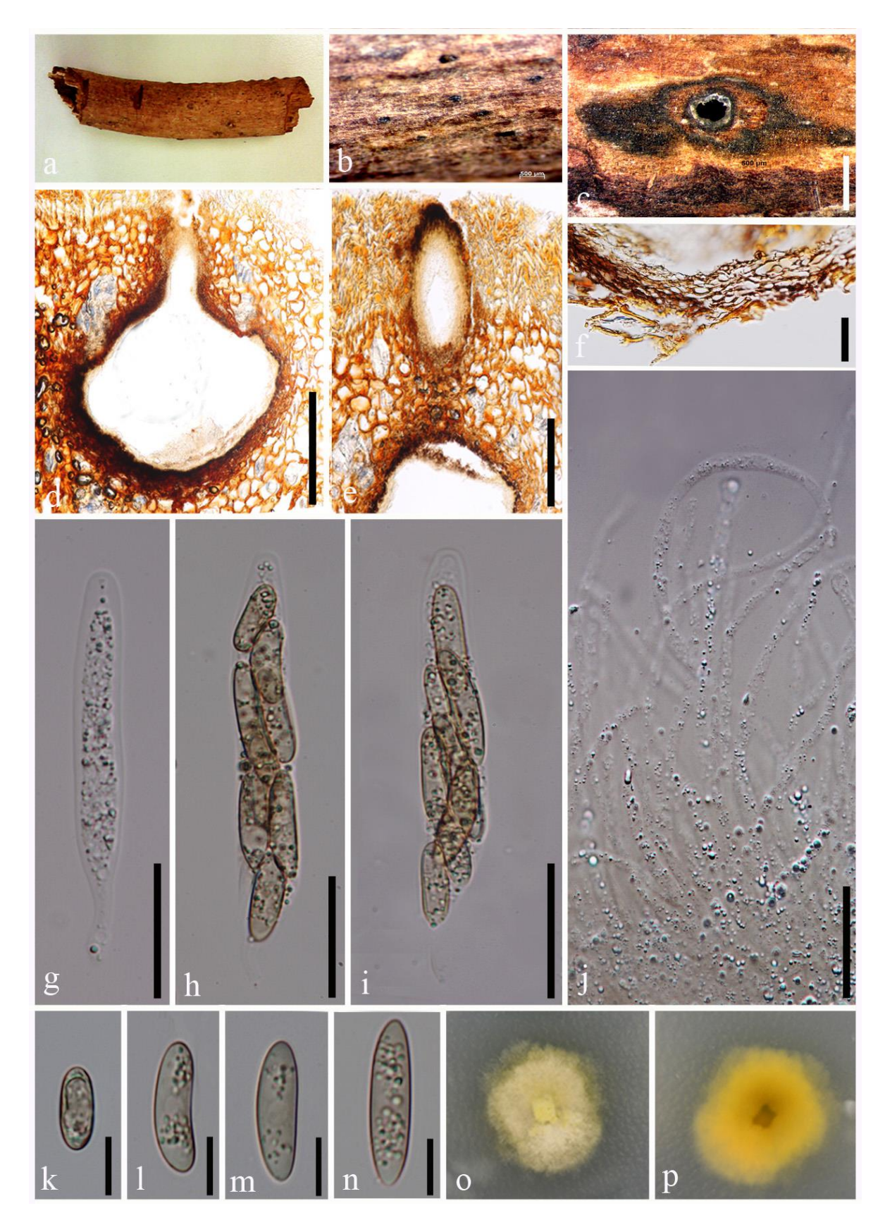
Fig. 3 – Halodiatrype avicenniae (MFLU 16-1185, holotype ) a. Host specimens. b. Appearance of ascomata on host surface. c. Transverse section of ascoma in the darkened pseudostroma. d. Vertical section through ascoma. e. Section through neck. f. Peridium. g – i. Asci. j. Paraphyses. k – m . Ascospores. n , o. Culture on PDA ( n = from above, o = from below) Scale bars: c, d, f–i = 50 \mu m, e, j–m = 10 \mu m.