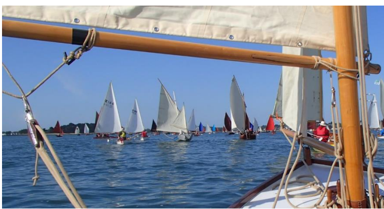
Sail and oar craft viewed from "Proteus"

La Semaine du Golfe du Morbihan is a spectacular biennial event.