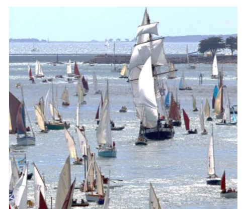
Small craft mingle with the tall ships during The Parade

Could any sort of sailing be ... better than ... chasing each other around the marks? Some of our members could tell you. Here's just one example.