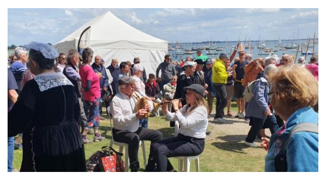
Song and dance on Ile D'Arz – (Steve Morton)

Food (not only oysters) and entertainments are laid on at all ports.