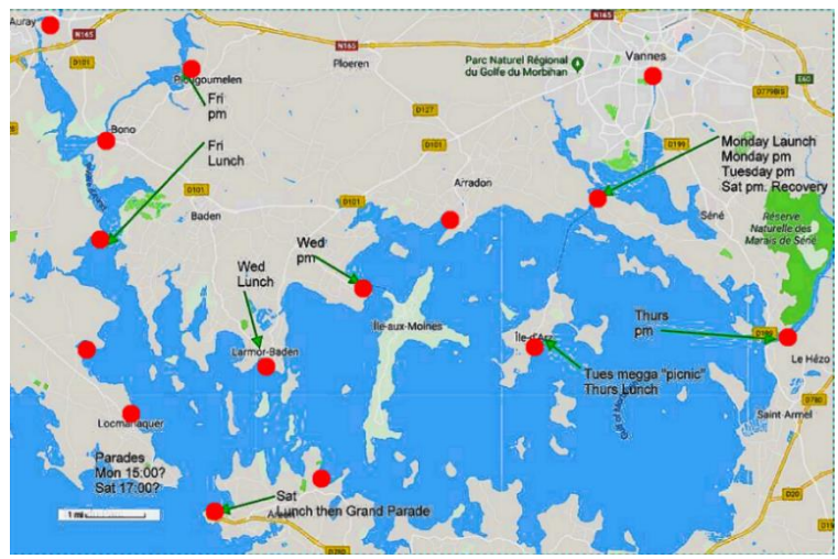
Map of Golfe du Morbihan – (Public domain with PW additions)

This is the setting for "an international maritime festival, gathering traditional and classic boats, "of character"".